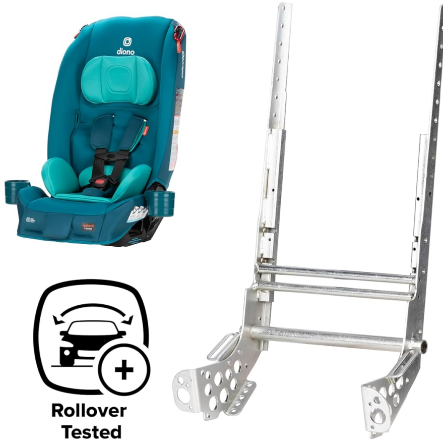
Figure 3.2: The car seat's compact folding feature, illustrating its suitability for travel and storage in various environments, including an airplane overhead bin.