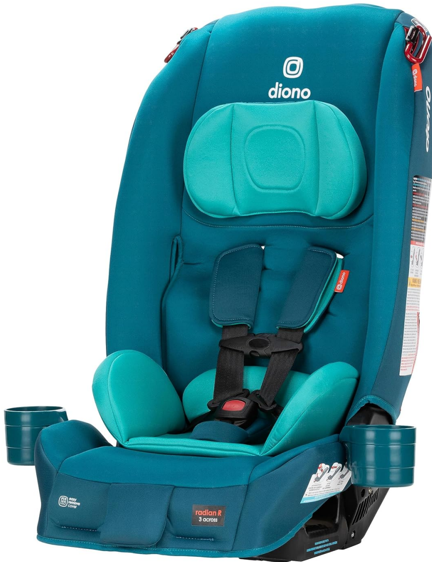
Figure 1.1: The Diono Radian 3R All-in-One Convertible Car Seat in Blue Razz Ice, showcasing its full upright position with head support and harness system.