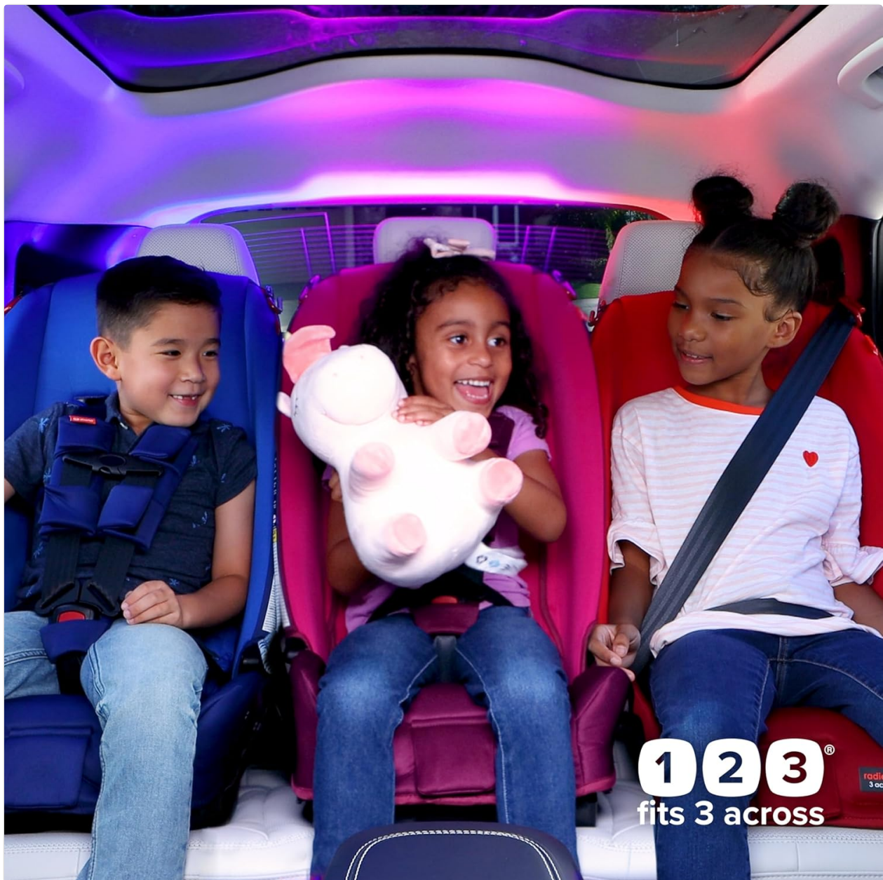
Figure 3.1: Demonstrating the "3-across" capability of the Diono Radian 3R, showing three car seats fitting comfortably in a vehicle's back seat.

The slim-fit design of the Radian 3R allows for up to three car seats to fit across the back seat of most vehicles, making it ideal for growing families or carpooling needs.