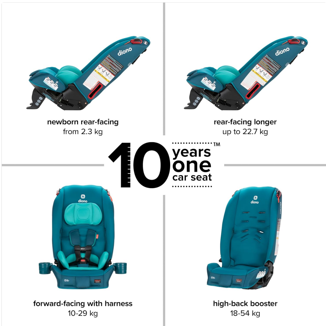
Figure 4.1: The four versatile modes of the Diono Radian 3R, illustrating its adaptability for children from infancy to booster age.