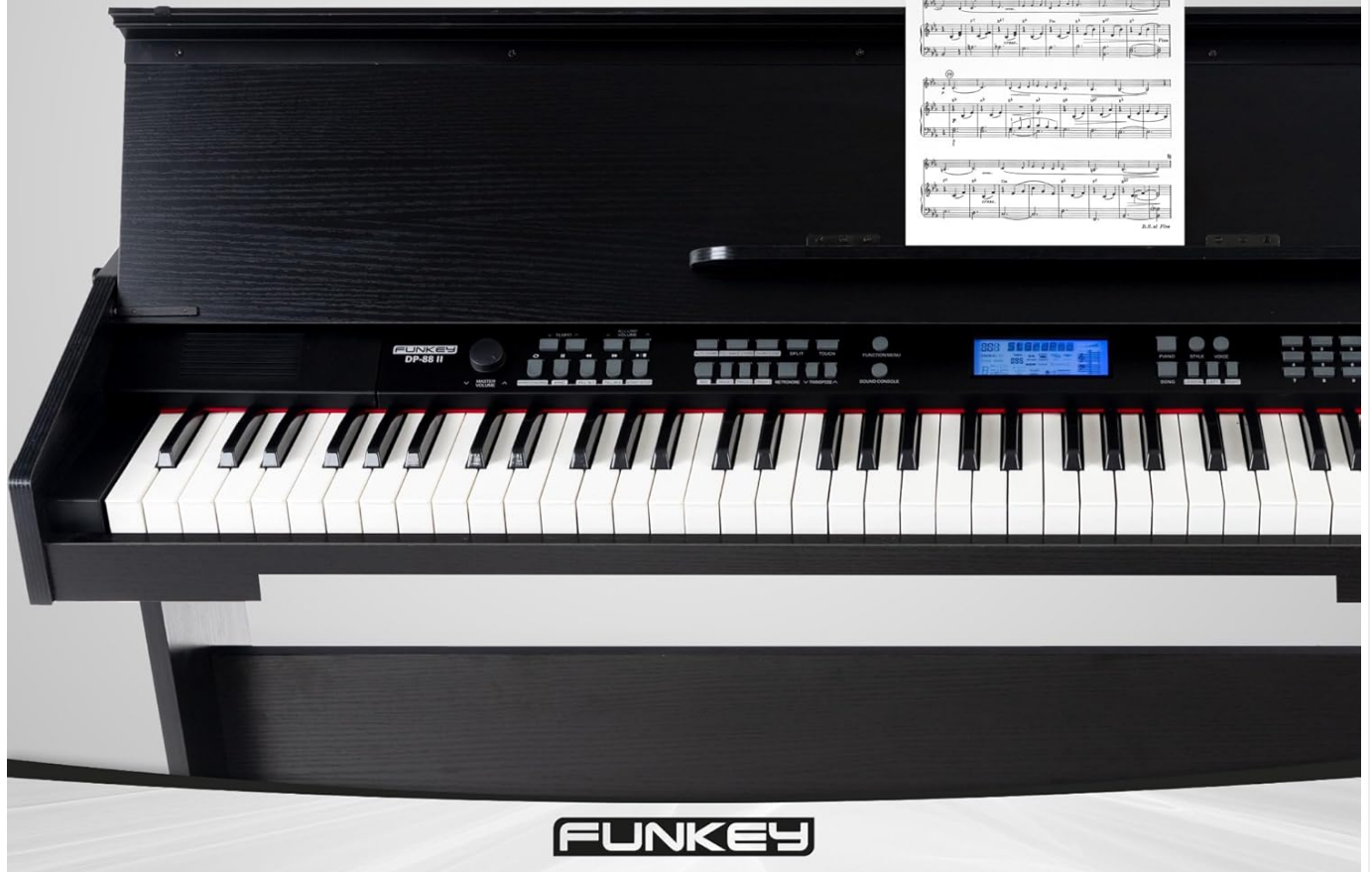
Figure 8: Features for creative recording, precise practice, and playing along.