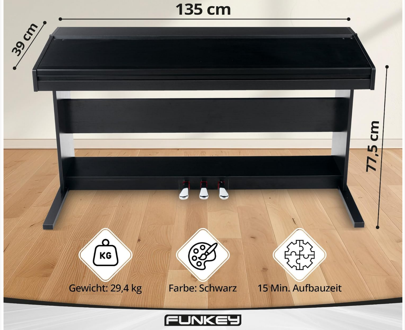
Figure 3: The FunKey DP-88 II digital piano is compact and designed for quick assembly.