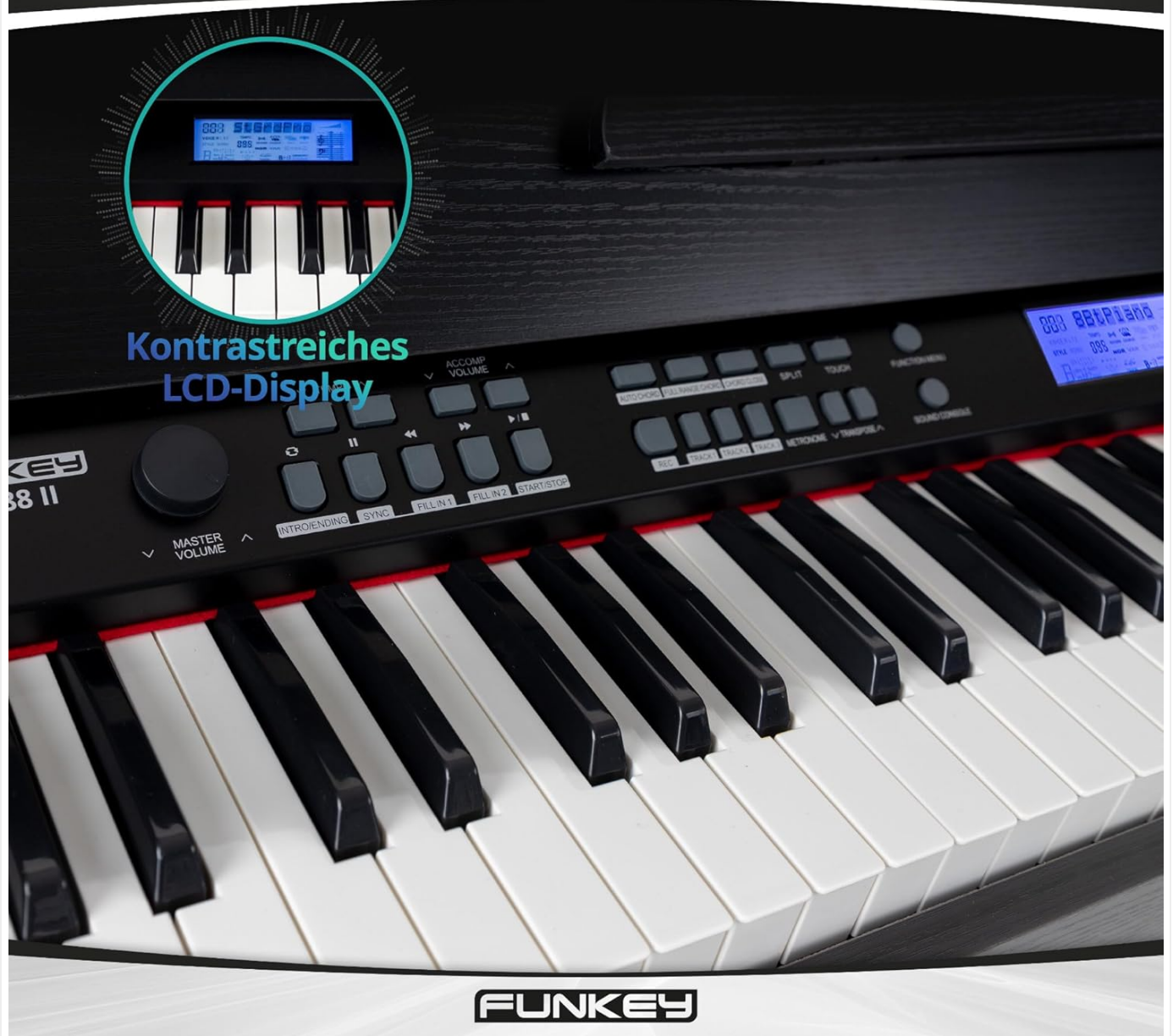
Figure 5: Intuitive control panel with LCD display for easy navigation.