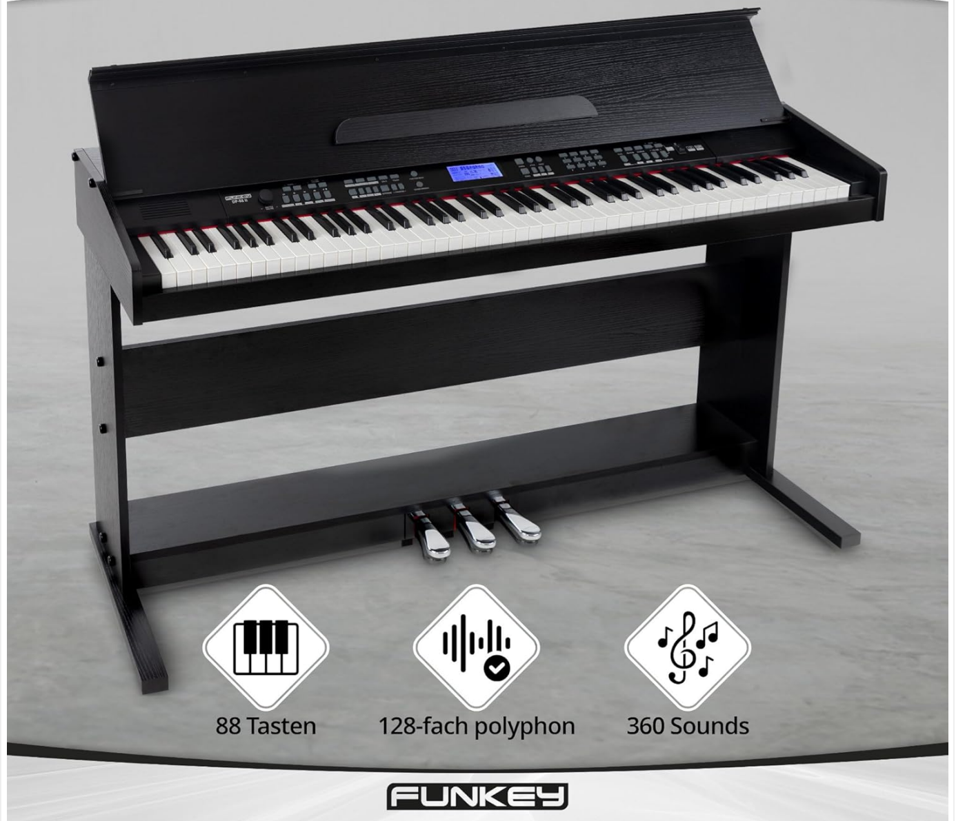
Figure 1: The FunKey DP-88 II Digital Piano.