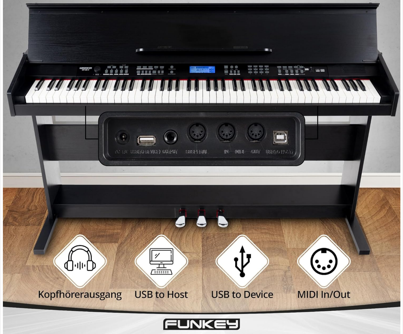
Figure 4: Rear panel connections for the FunKey DP-88 II digital piano.