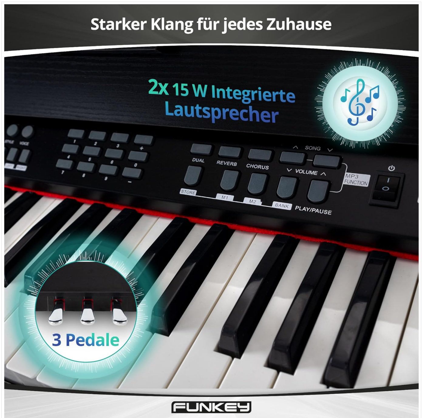
Figure 6: Integrated stereo speakers and three pedals for expressive play.