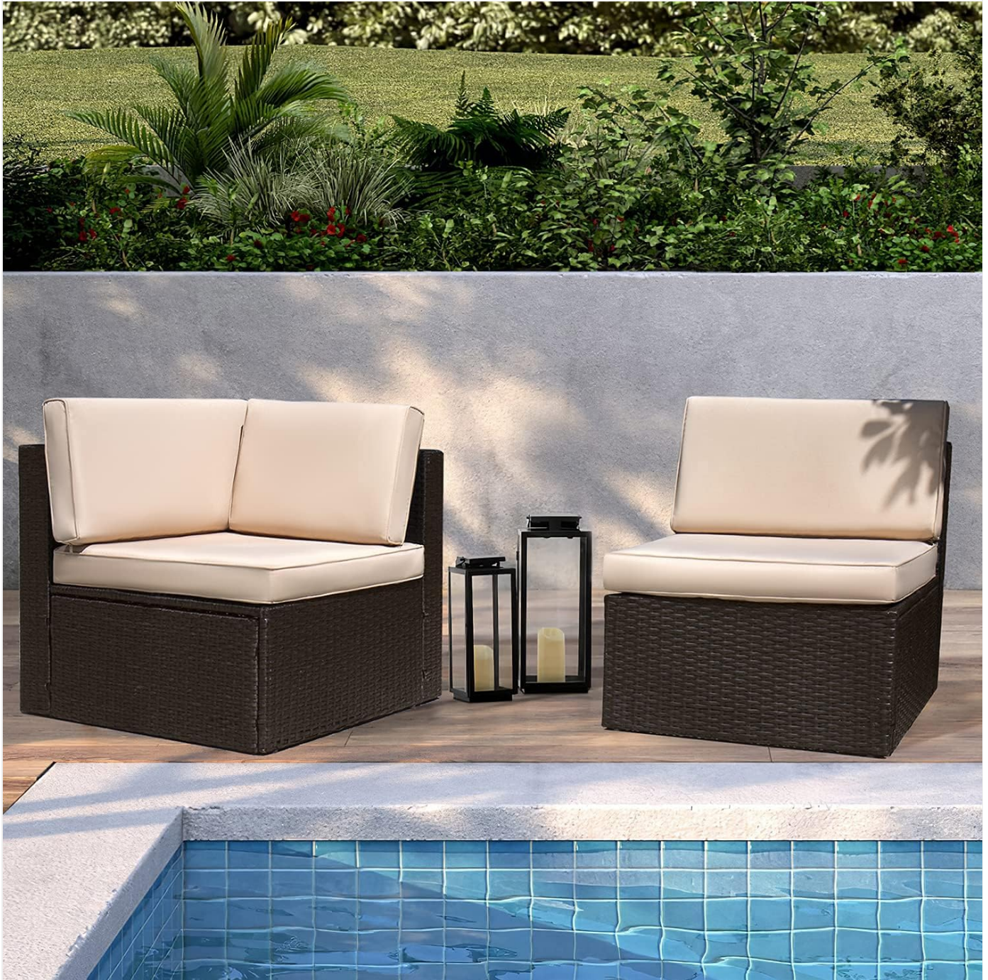
Image: Individual corner and armless sofa units, demonstrating the modular nature of the set before combination.