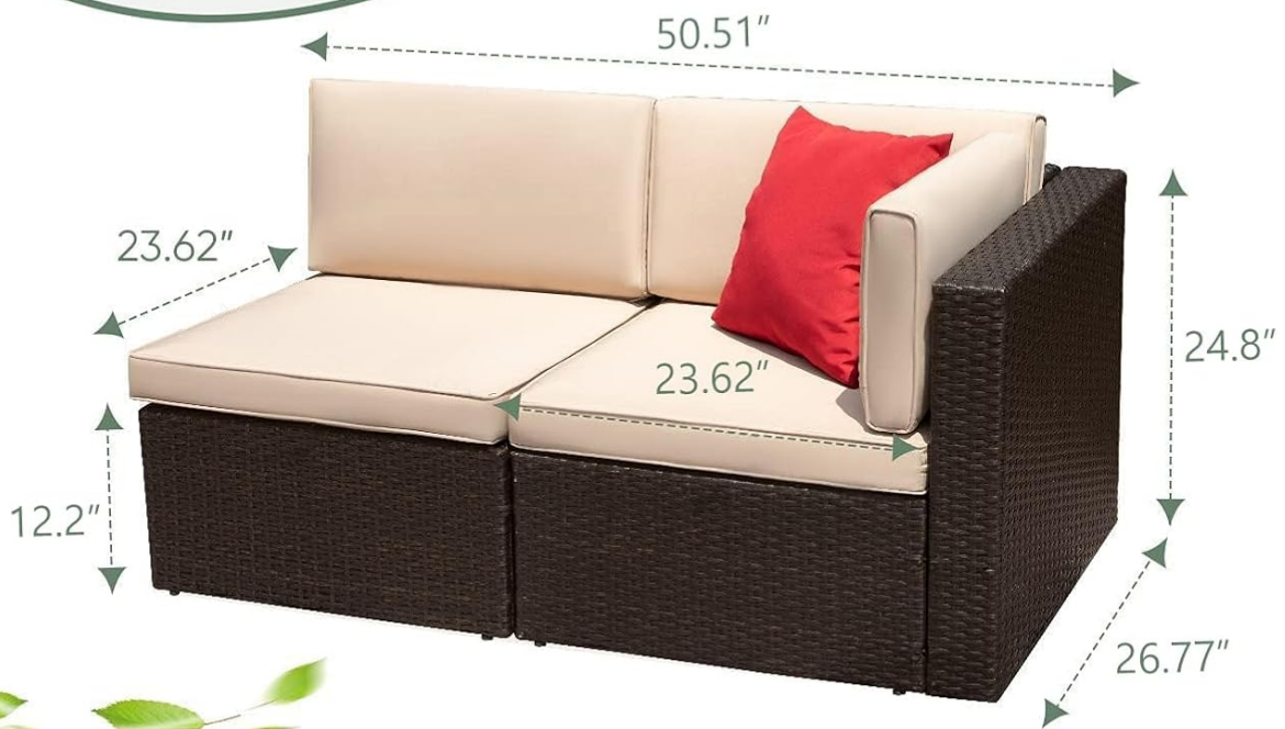
Image: A diagram illustrating the key dimensions of the assembled 2-piece sofa set for reference.