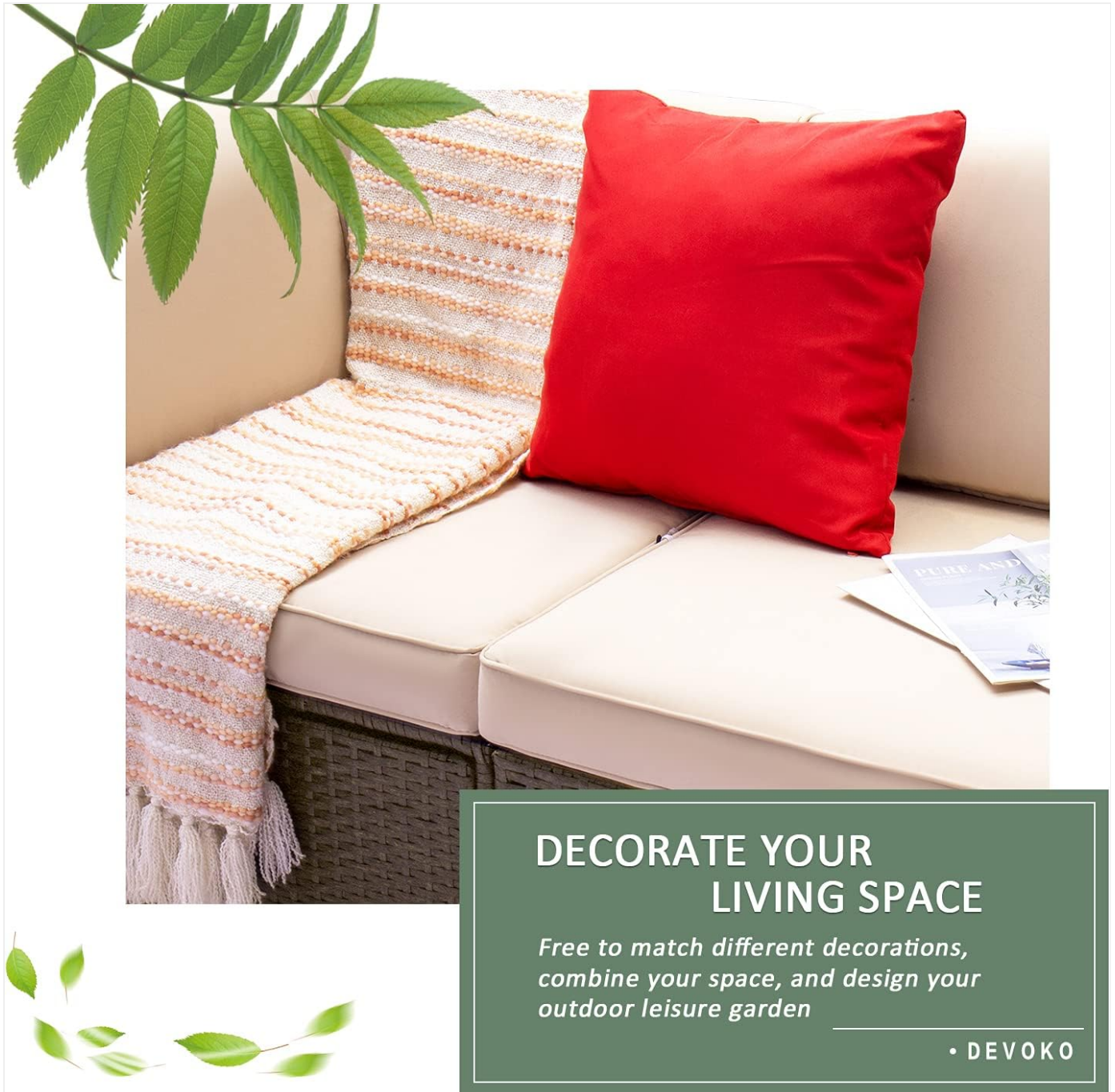
Image: A close-up view of the sofa's cushions and rattan frame, highlighting the materials that require regular cleaning and care.