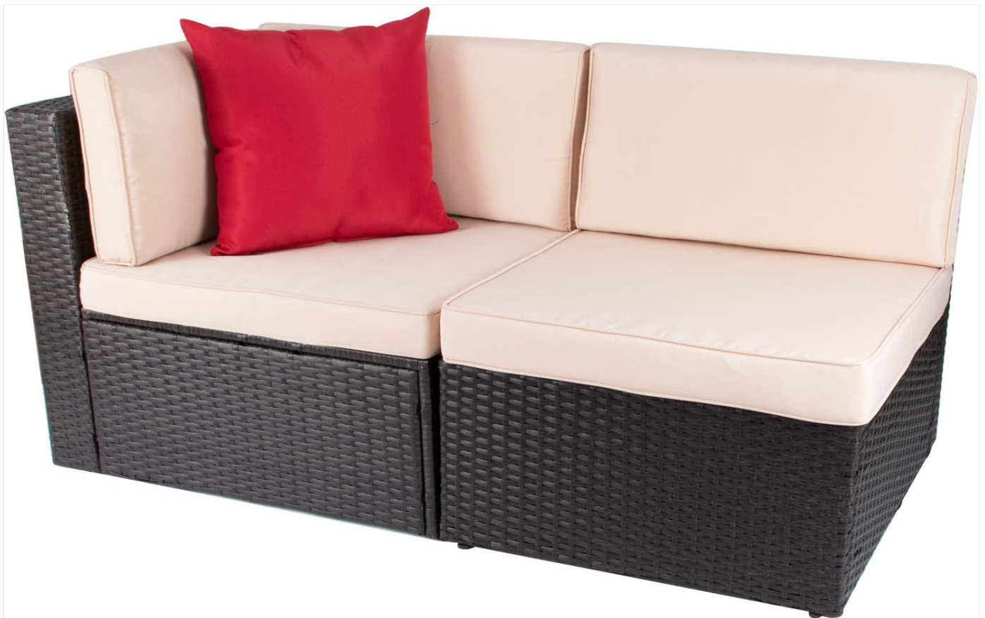
Image: The assembled Devoko 2-piece patio sofa set in beige, featuring a corner sofa and an armless sofa with comfortable cushions.

This manual provides detailed instructions for the assembly, operation, maintenance, and troubleshooting of your Devoko Patio Furniture Sofa Set. This set includes one corner sofa and one armless sofa, designed for outdoor use with all-weather durability.