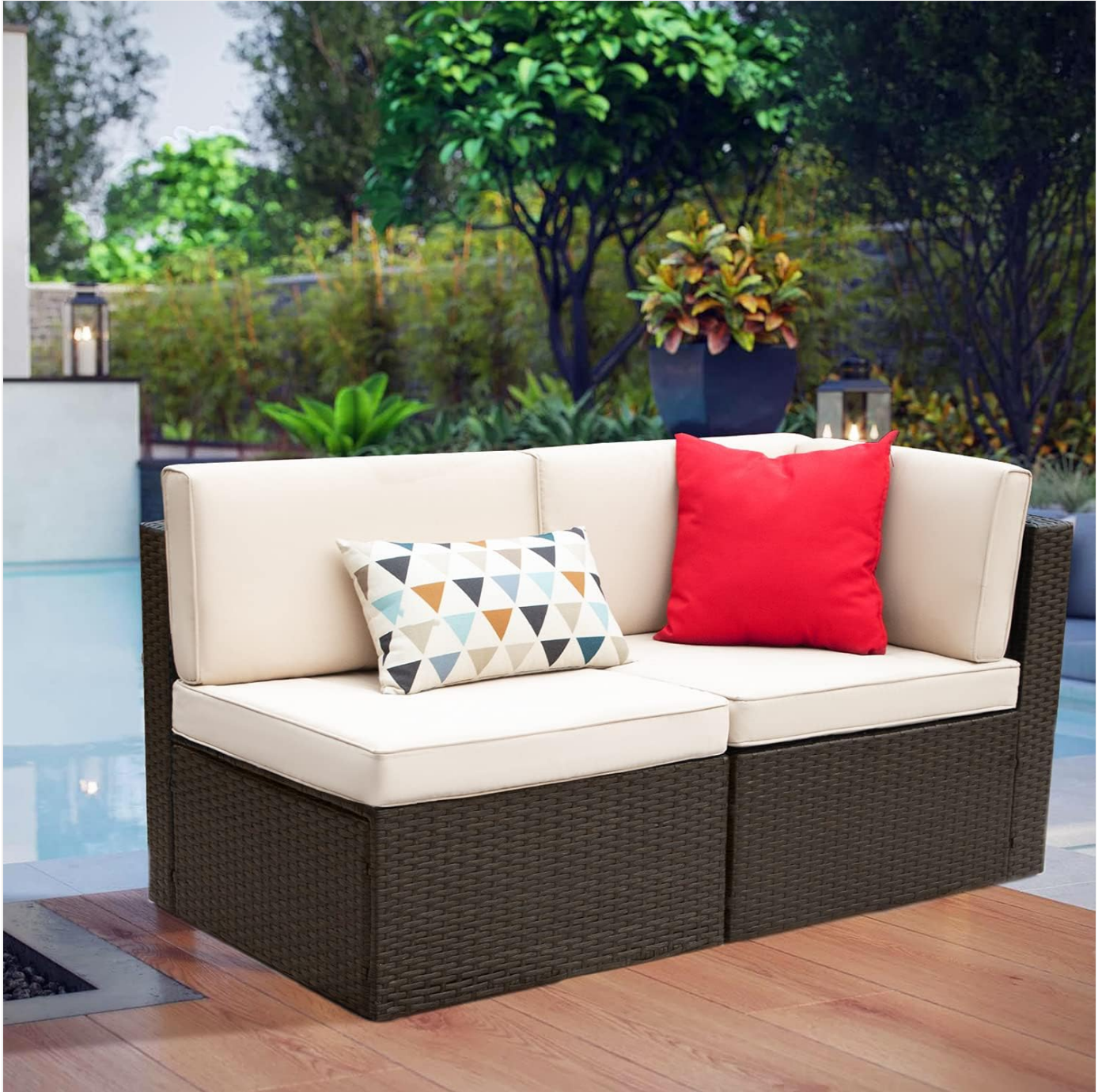
Image: The sofa set positioned on a patio, illustrating a common arrangement for outdoor leisure.