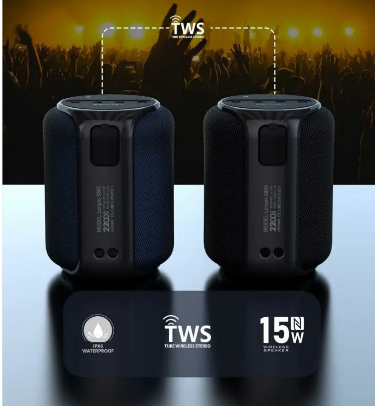
Figure 4: Illustration of two Lenyes S805BK speakers utilizing the True Wireless Stereo (TWS) function for enhanced audio.

Two devices can realize the TWS interconnection function and realize the stereo surround effect