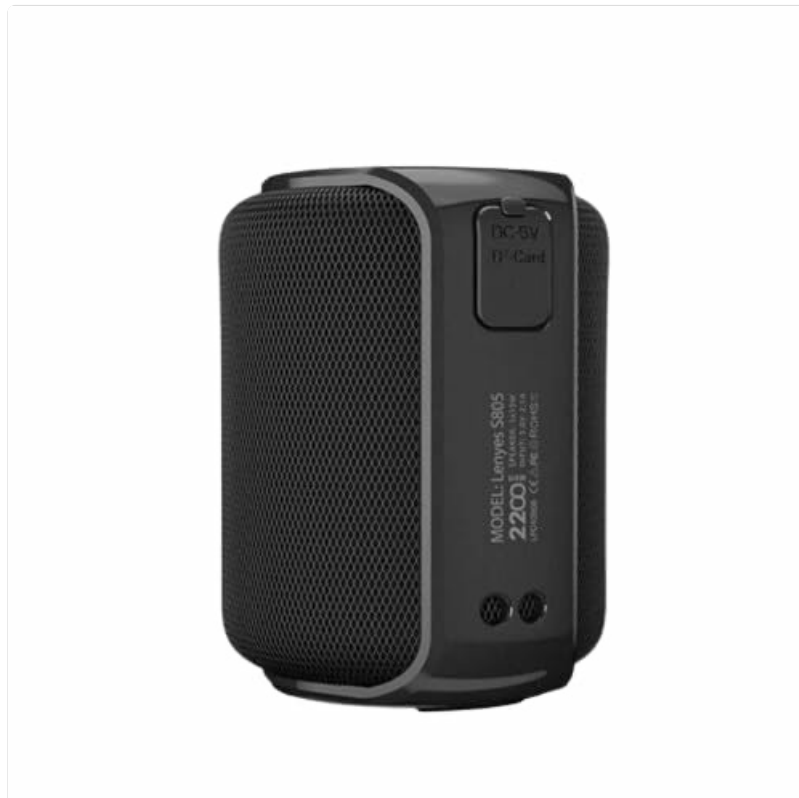
Figure 2: Side panel of the speaker, indicating the DC-5V charging port and the TF-Card slot for local music playback.