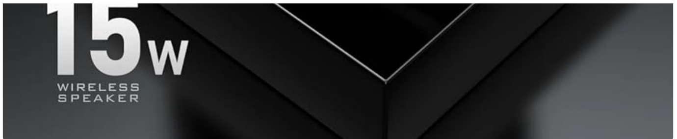
Figure 3: Top panel of the speaker, showing the integrated control buttons for power, volume, and playback functions.

Familiarize yourself with the following components: