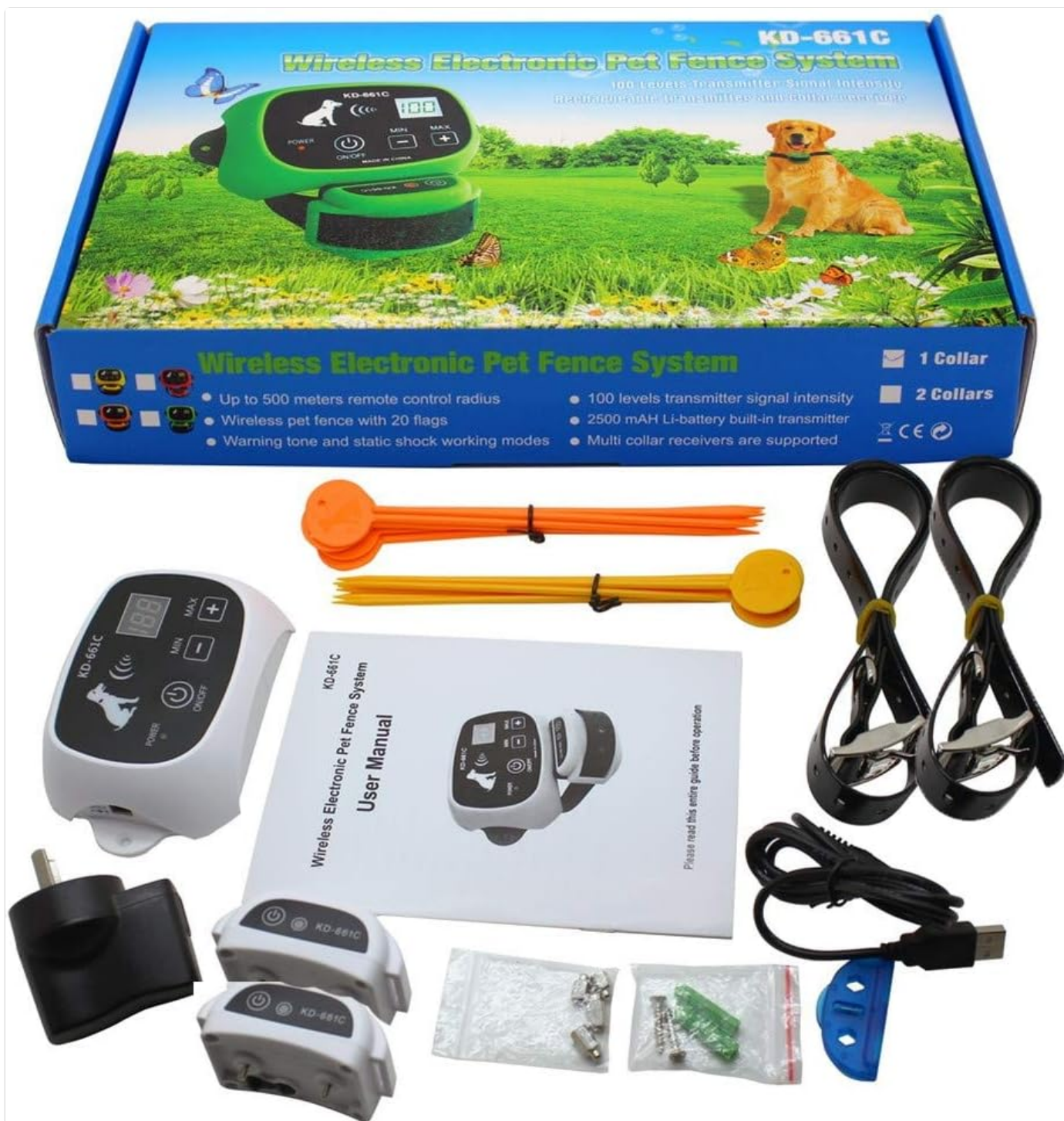
Image: Complete package contents of the SXDD Wireless Dog Fence System, including the transmitter, receiver collars, charger, test light, boundary flags, and user manual.