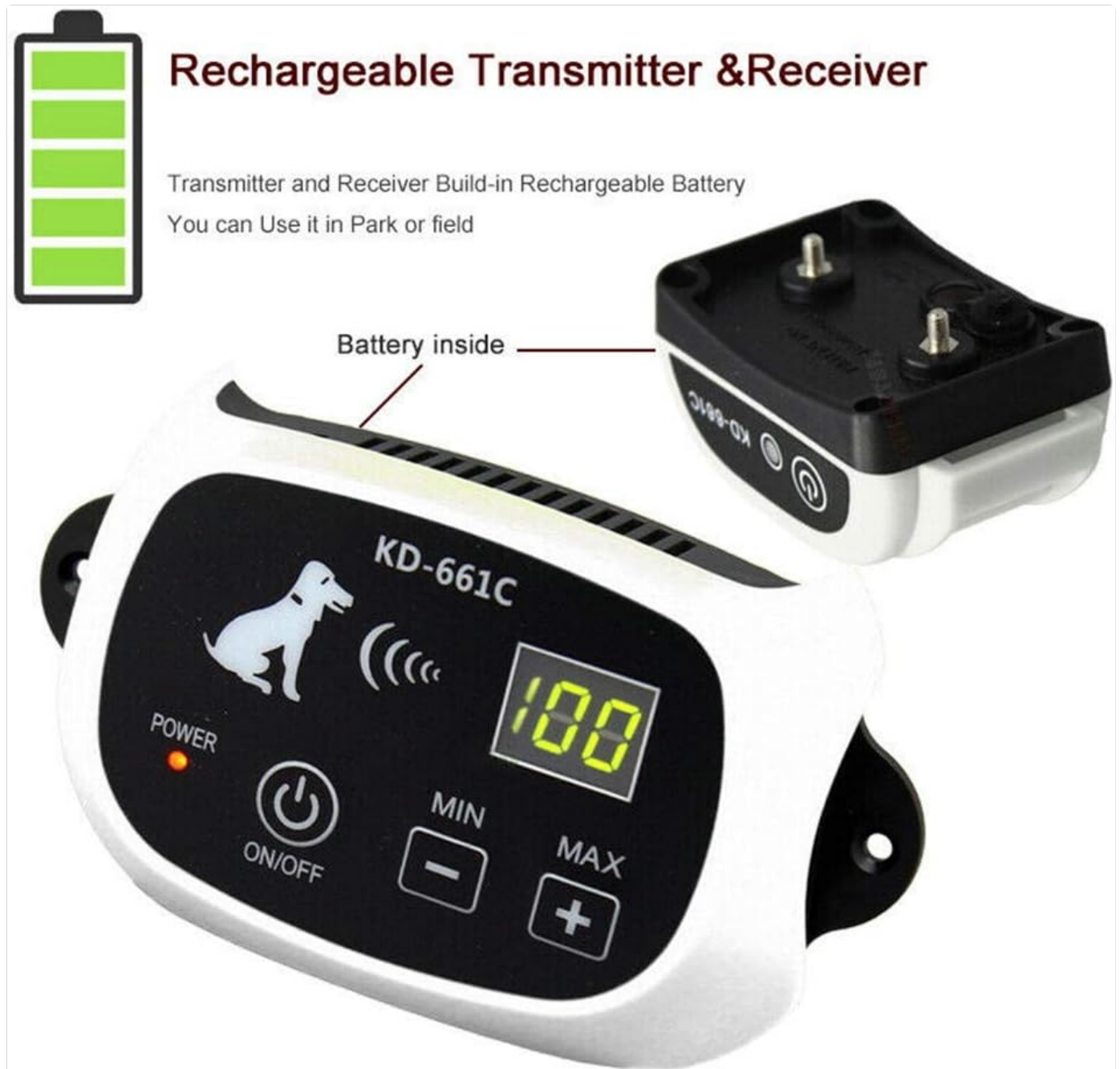
Image: Close-up view of the rechargeable transmitter and receiver collar, highlighting their internal rechargeable batteries.

included in your package). A full charge typically takes several hours.