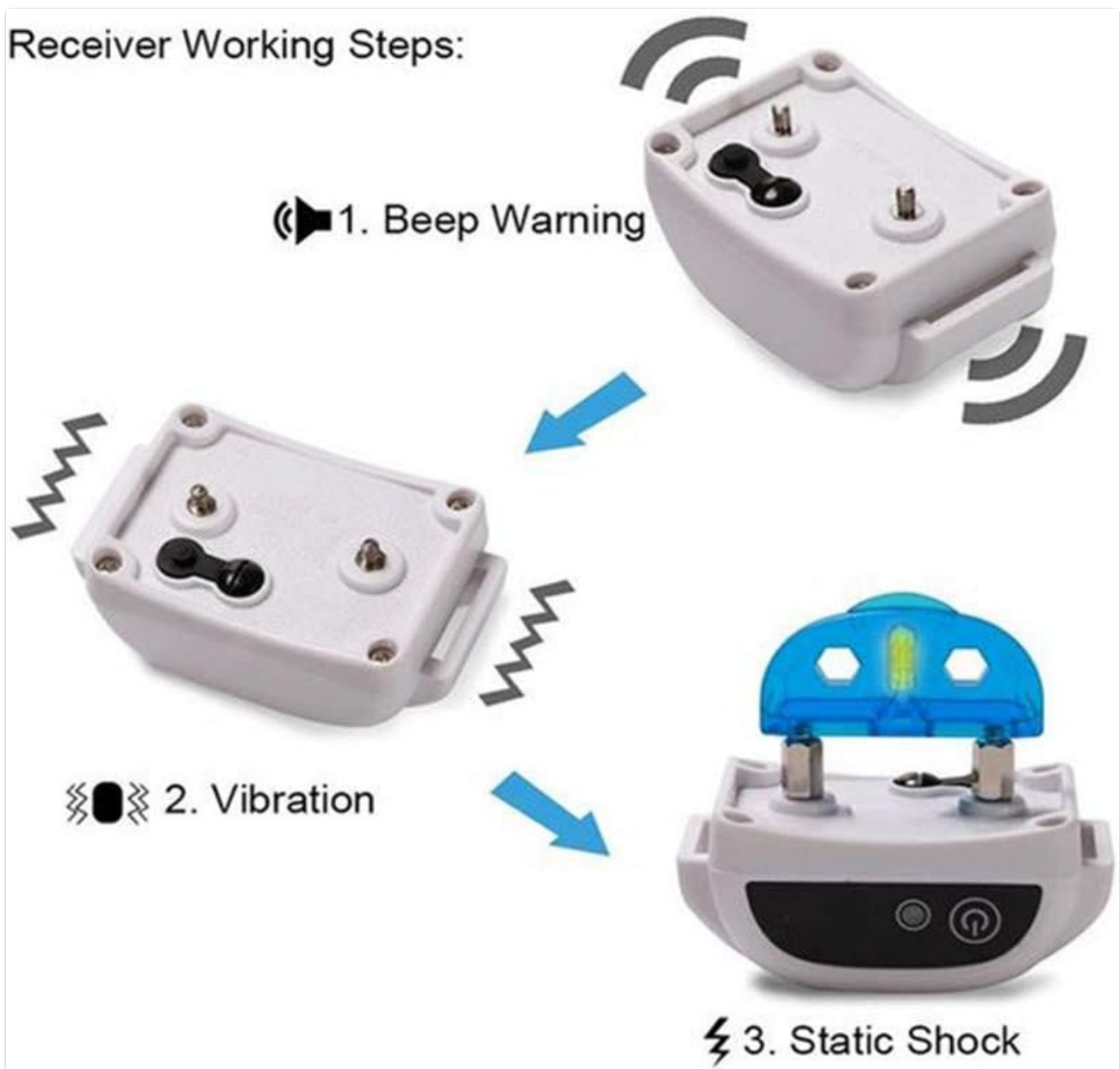
Image: Diagram illustrating the three stages of receiver operation: 1. Beep Warning, 2. Vibration (implied by the second image, though the product description focuses on tone and static), and 3. Static Shock.