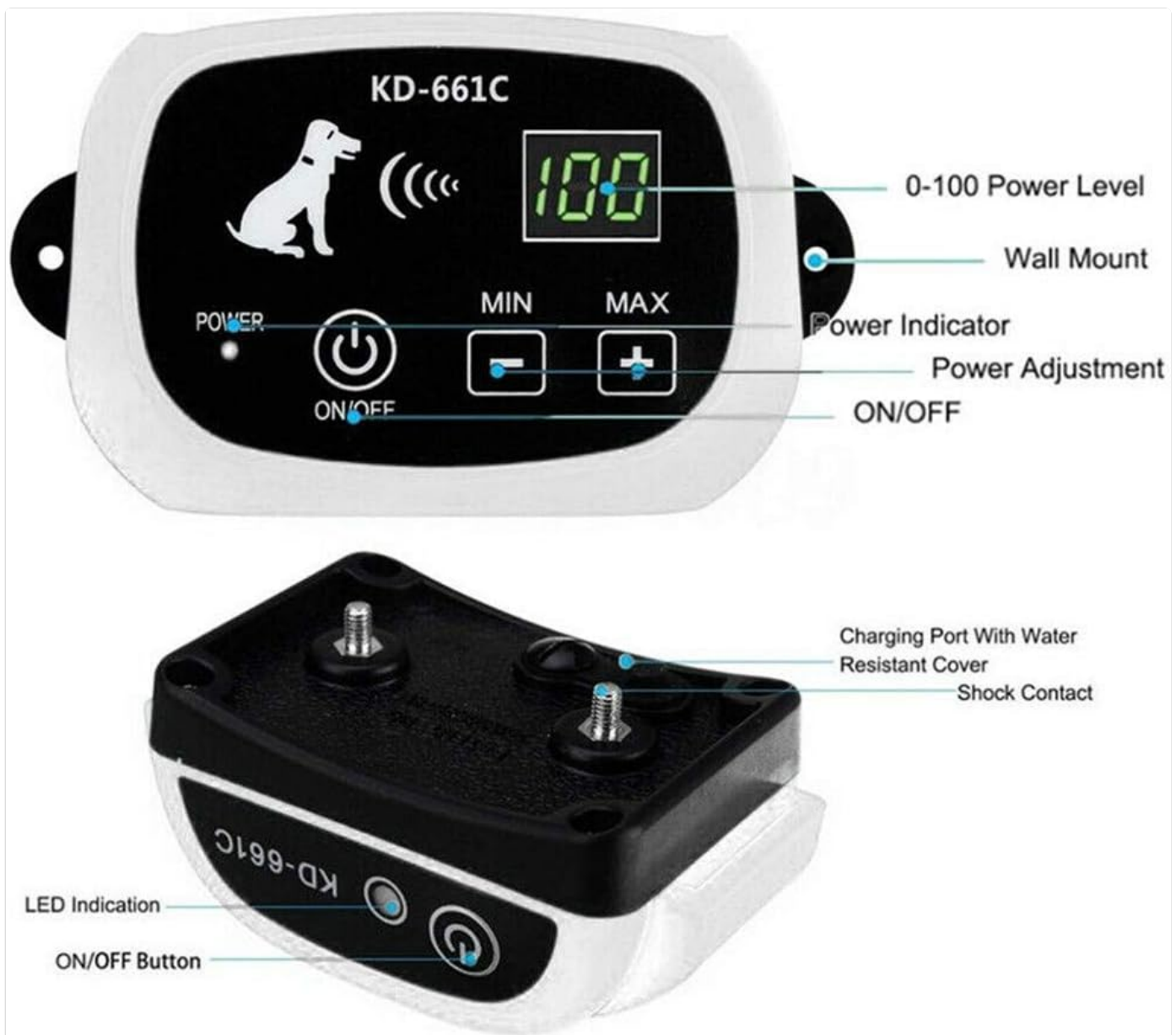
Image: Detailed diagram of the KD-661C transmitter and receiver collar, showing the power level display, power indicator, power adjustment buttons, ON/OFF switch, charging port, shock contacts, and LED indication.