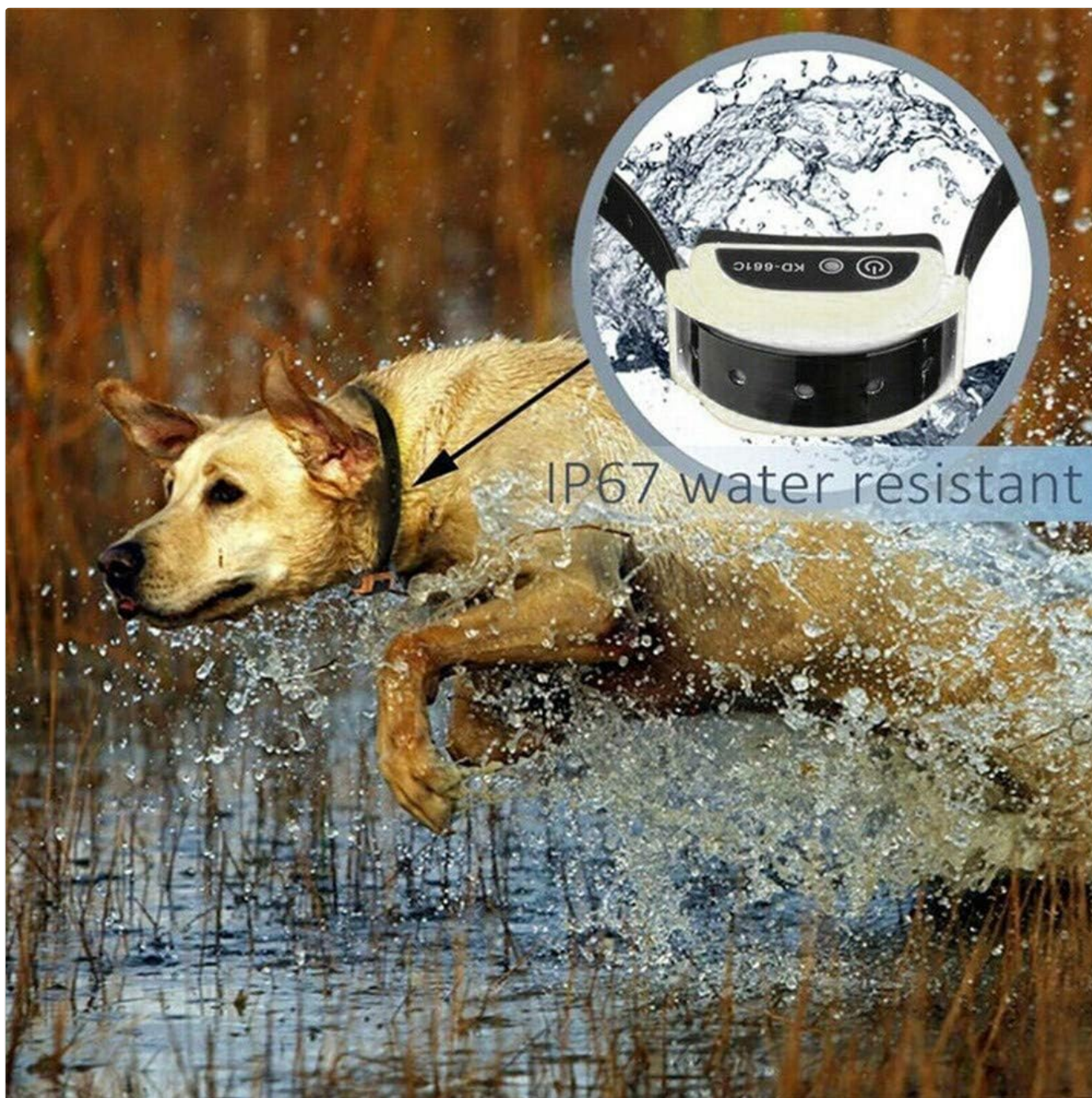
Image: A dog running through water, demonstrating the IP67 water resistance of the receiver collar, which is highlighted in the image.

Clean the receiver collar and contact points periodically with a damp cloth to remove dirt or debris. Ensure the charging port cover is securely closed to maintain water resistance, especially after outdoor use or exposure to water.