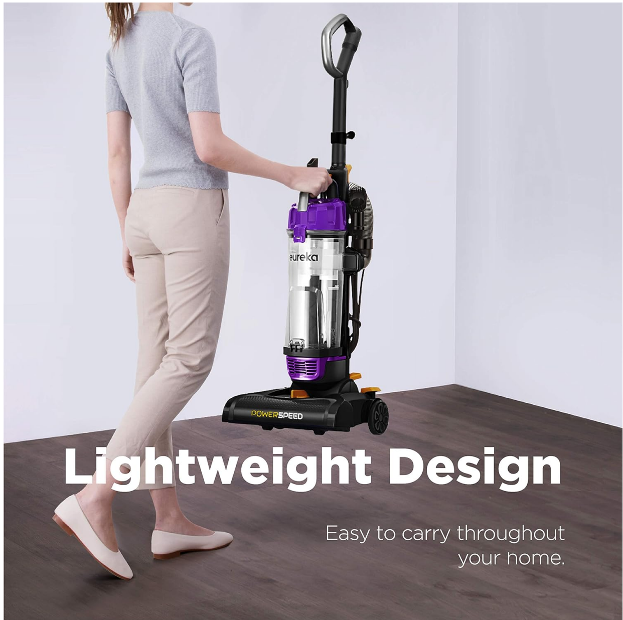
Image: A person effortlessly carrying the Eureka PowerSpeed vacuum cleaner, emphasizing its lightweight design for easy transport between rooms or up stairs.

throughout your home. Its powerful motor and brush roll effectively lift stubborn and heavy debris from various surfaces.