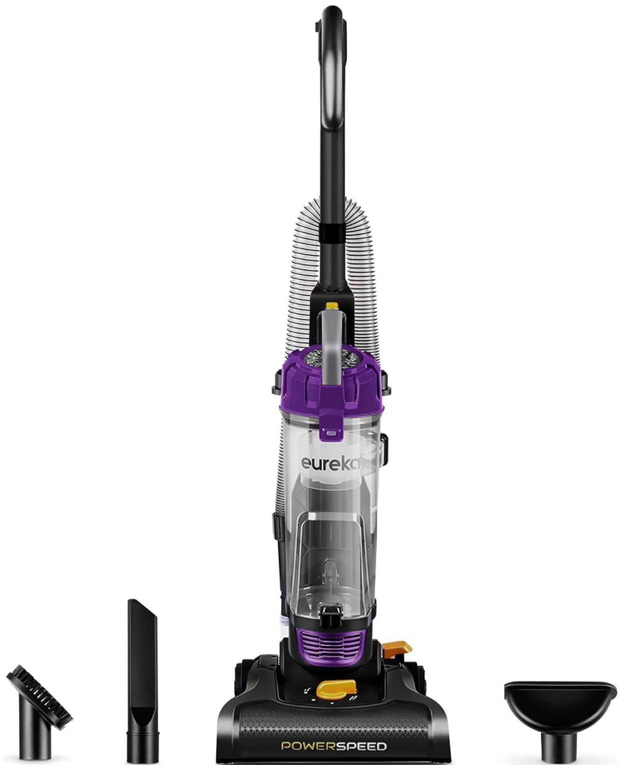
Image: The Eureka NEU182B PowerSpeed Bagless Upright Vacuum Cleaner shown with its main unit and three detachable accessories: a dusting brush, a crevice tool, and an upholstery tool.