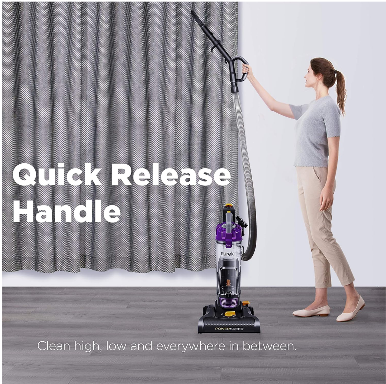
Image: A user demonstrating the quick-release handle feature, extending the hose to clean high surfaces like curtains, highlighting the vacuum's versatility.

Image: A composite image displaying the dusting brush cleaning blinds, the upholstery tool cleaning a sofa, and the crevice tool reaching into a tight space, showcasing the utility of each accessory.