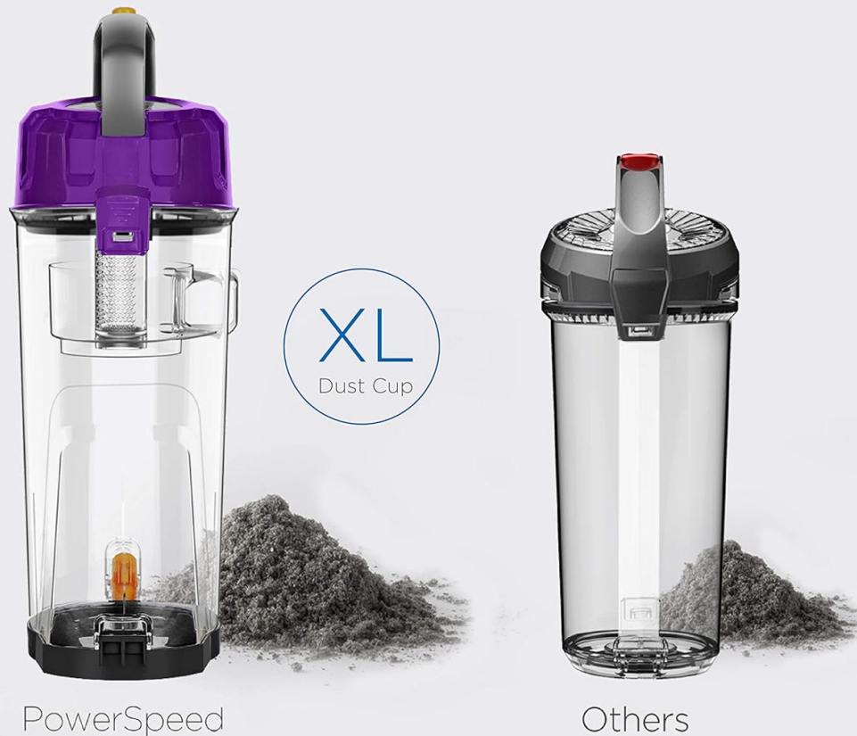
Image: A visual comparison highlighting the generous capacity of the Eureka PowerSpeed's dust cup, indicating less frequent emptying compared to smaller alternatives.

Less trips to the trash can saves you time and energy. Clean faster and more efficiently.