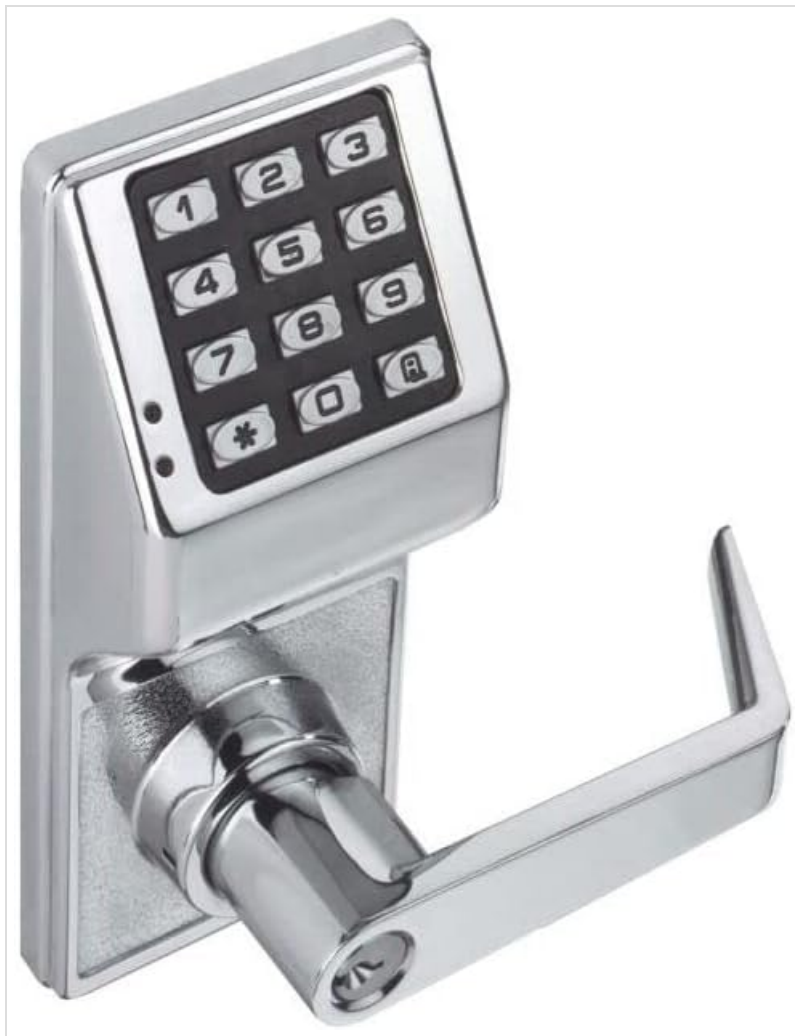
Figure 1: Alarm Lock Trilogy T2 DL2700/26D Digital Lock with Keypad and Lever Handle.