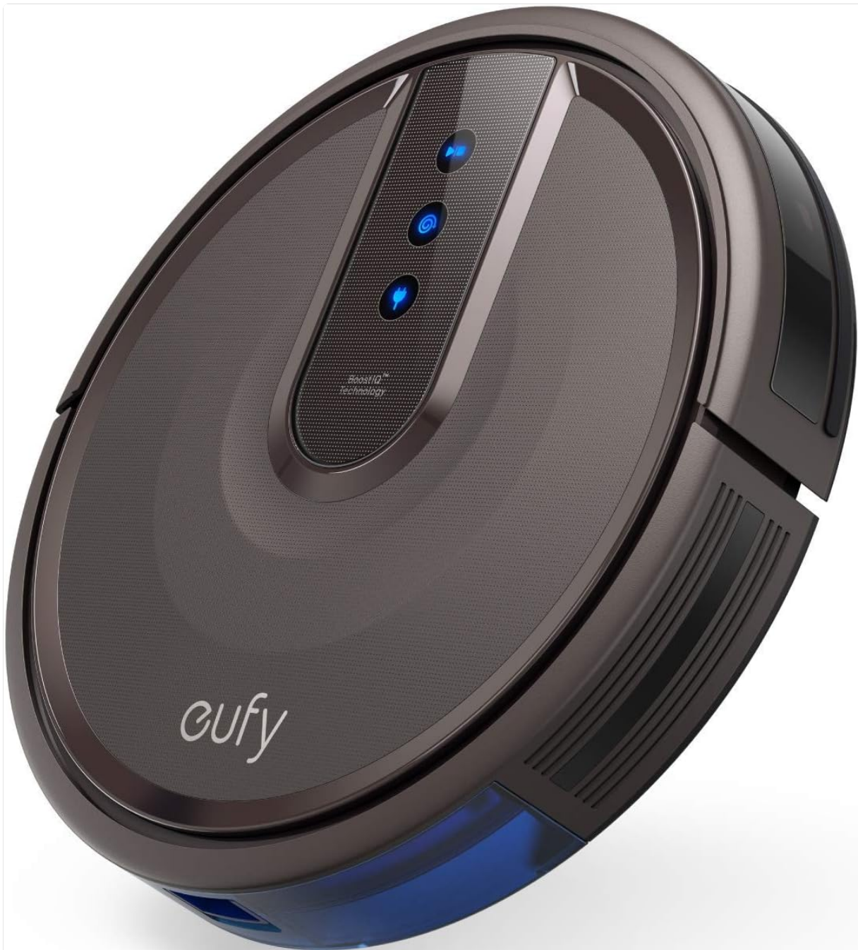
Image 1.1: The eufy BoostIQ RoboVac 15T robotic vacuum cleaner, a compact device designed for automated floor cleaning.