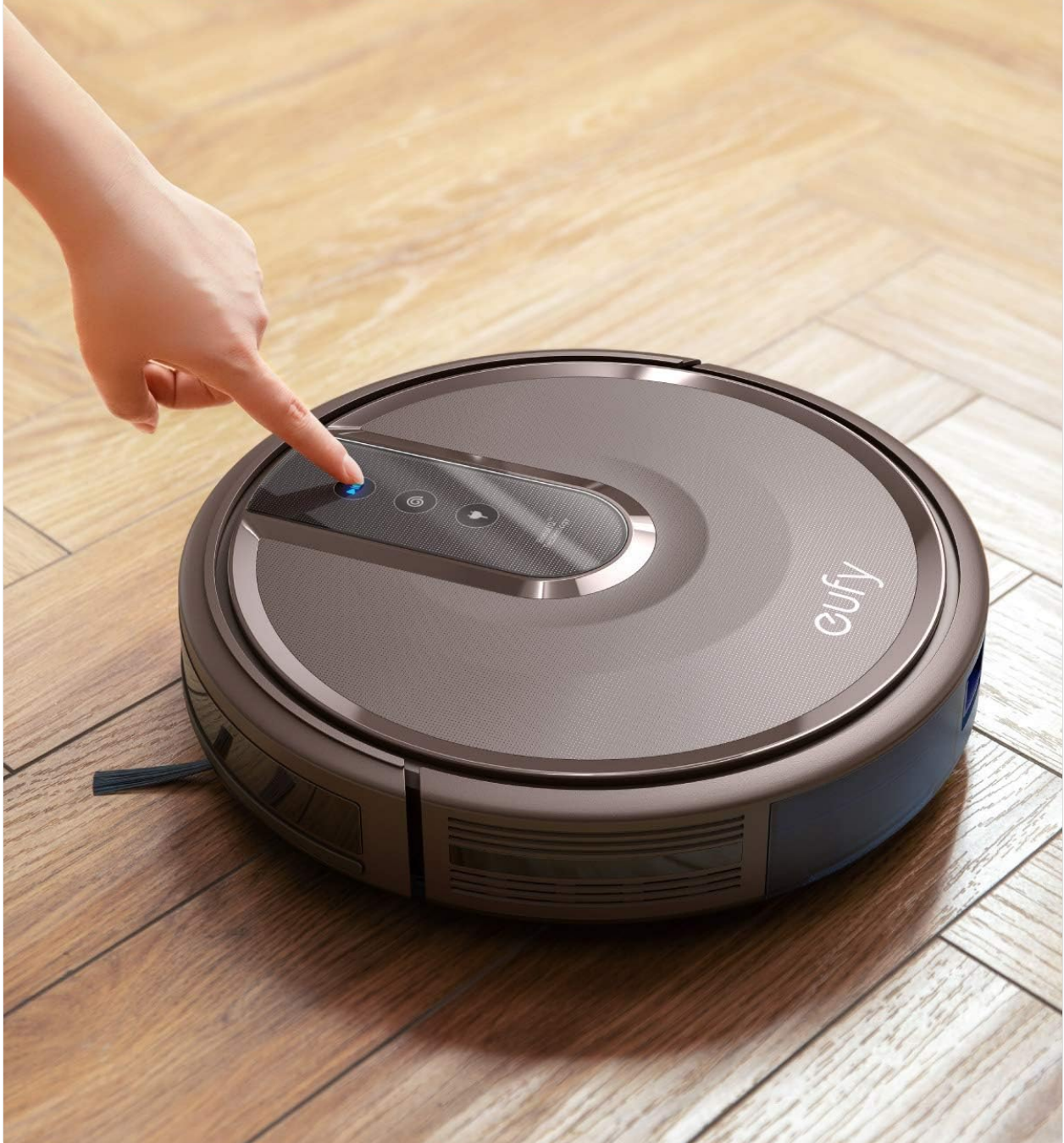
Image 6.1: The RoboVac 15T features a touch-control panel for easy operation, allowing users to initiate cleaning with a gentle touch.