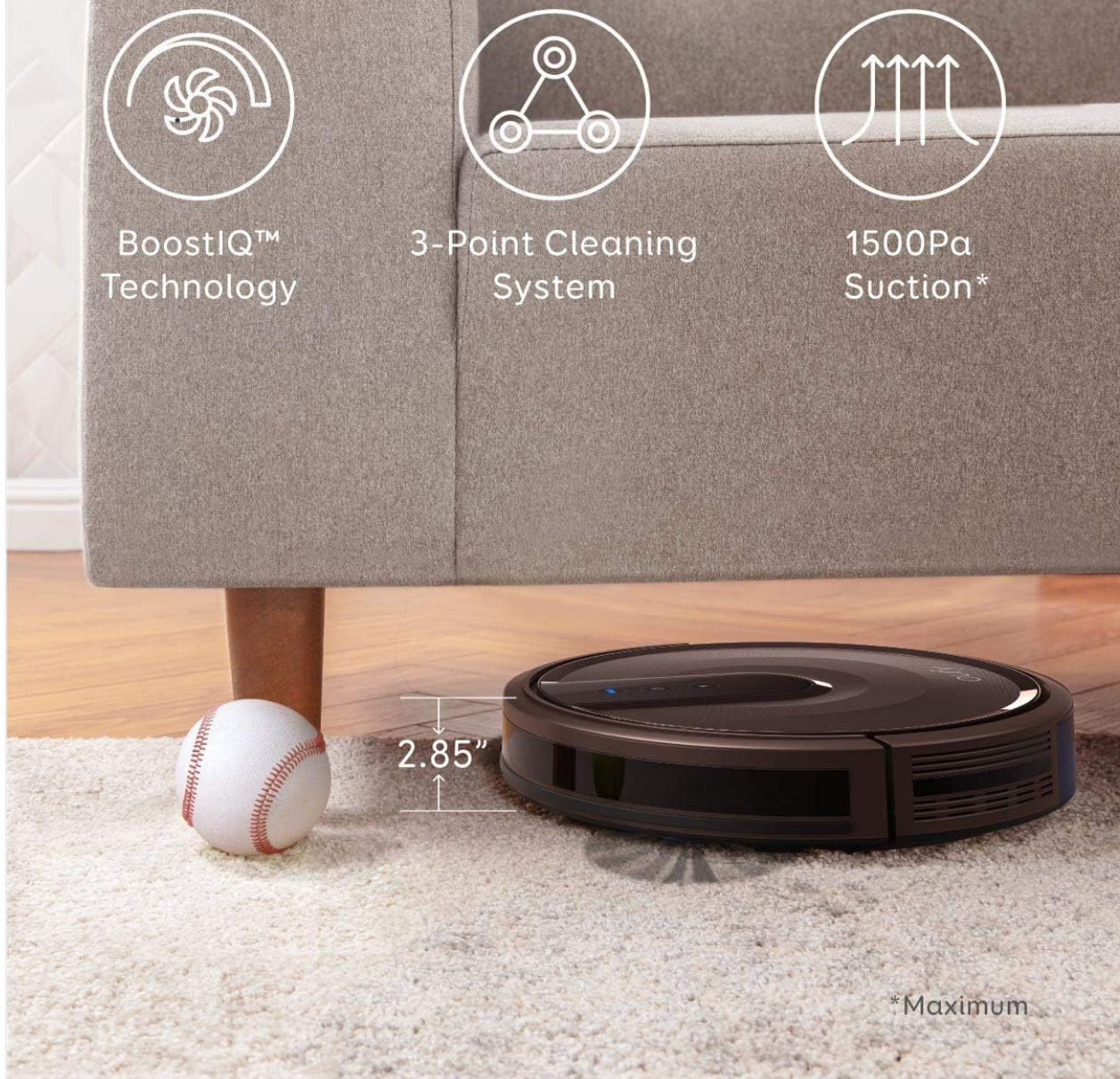
Image 4.1: Key features of the RoboVac 15T, including BoostIQ Technology, a 3-Point Cleaning System, and 1500Pa maximum suction power. The image also highlights its ultra-thin 2.85-inch design, allowing it to clean under low furniture.