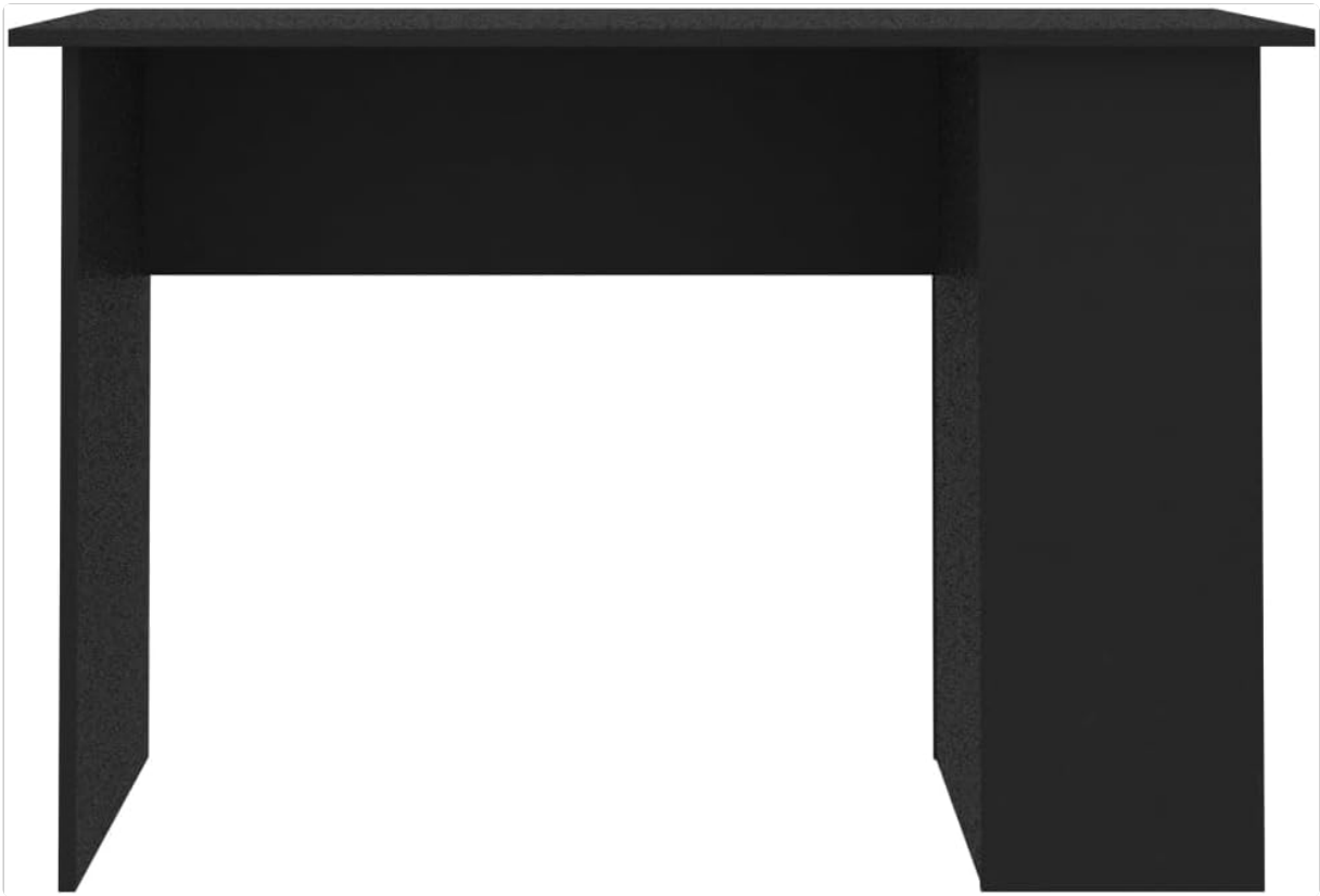
Image 4.1: Front view of the assembled desk, showing the main workspace and the integrated shelving unit.