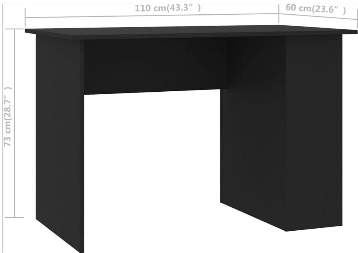
Image 8.1: Dimensional drawing of the desk, indicating its width, depth, and height.