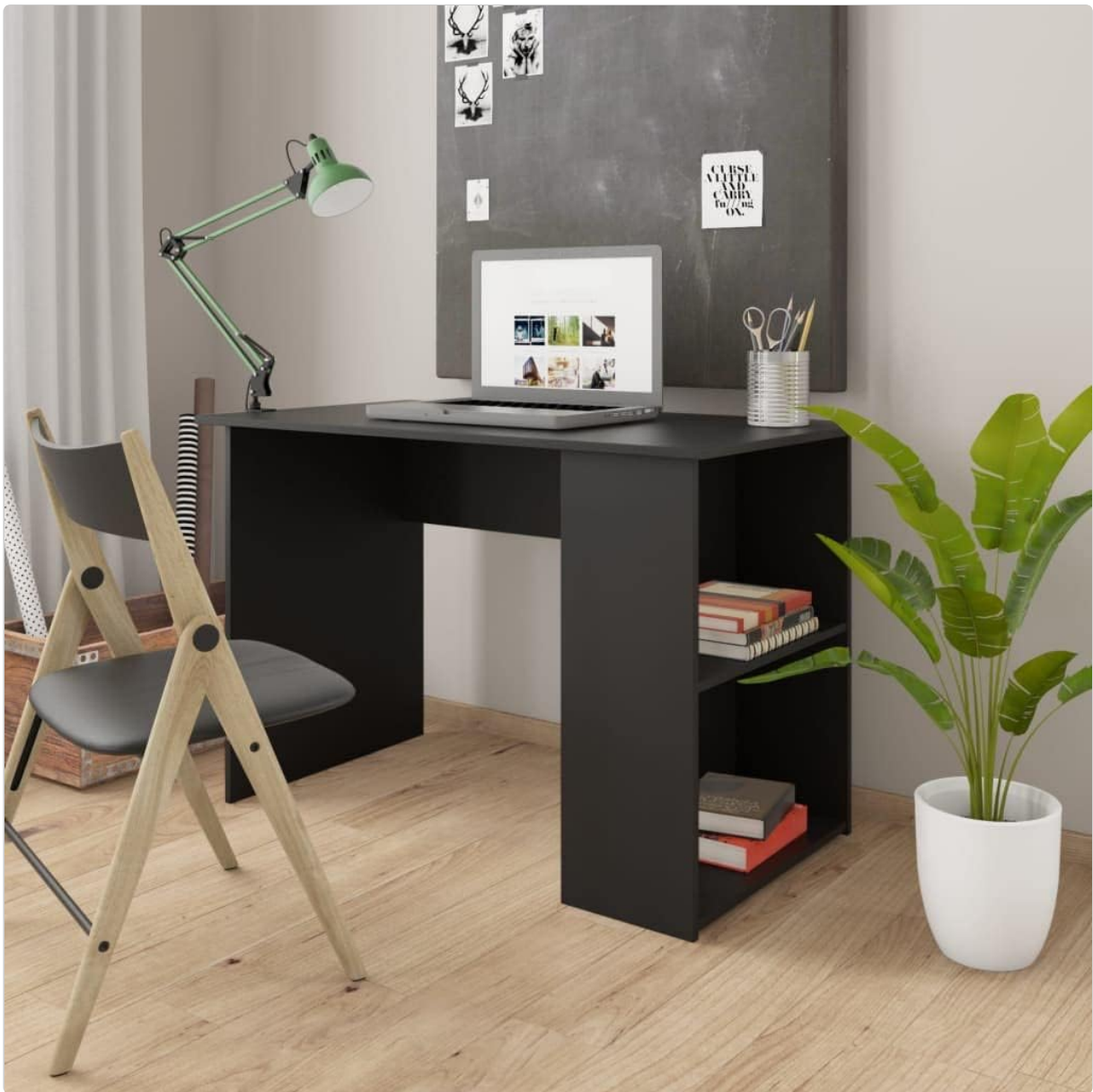
Image 1.1: The vidaXL Modern Desk (Model 800577) in a typical home office setup. This image shows the desk's overall appearance and its two integrated shelves.