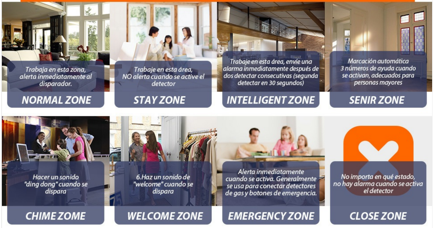
Image: Diagram illustrating the KERUI W18 system's operation.