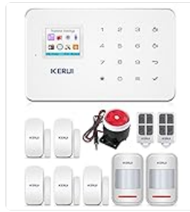
Image: The system can make multi-group alarm calls to notify several contacts simultaneously.

In case of an alarm, the system can automatically dial up to 6 preset phone numbers and send SMS alerts to notify designated contacts. This multi-group alarm call ensures that emergency contacts are promptly informed.