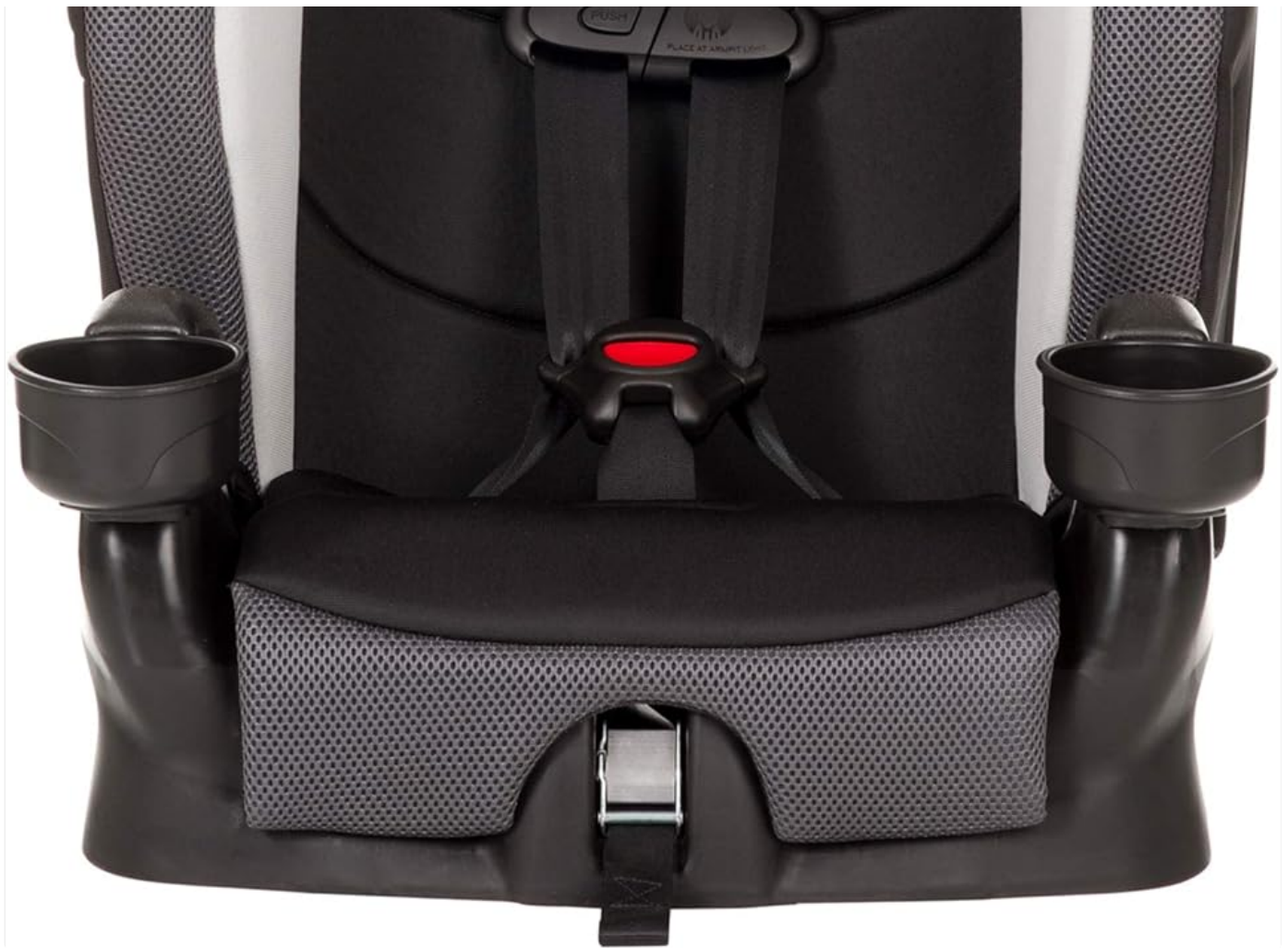
Front view of the Evenflo Chase Plus 2-in-1 Booster Car Seat, showcasing its design and harness system.