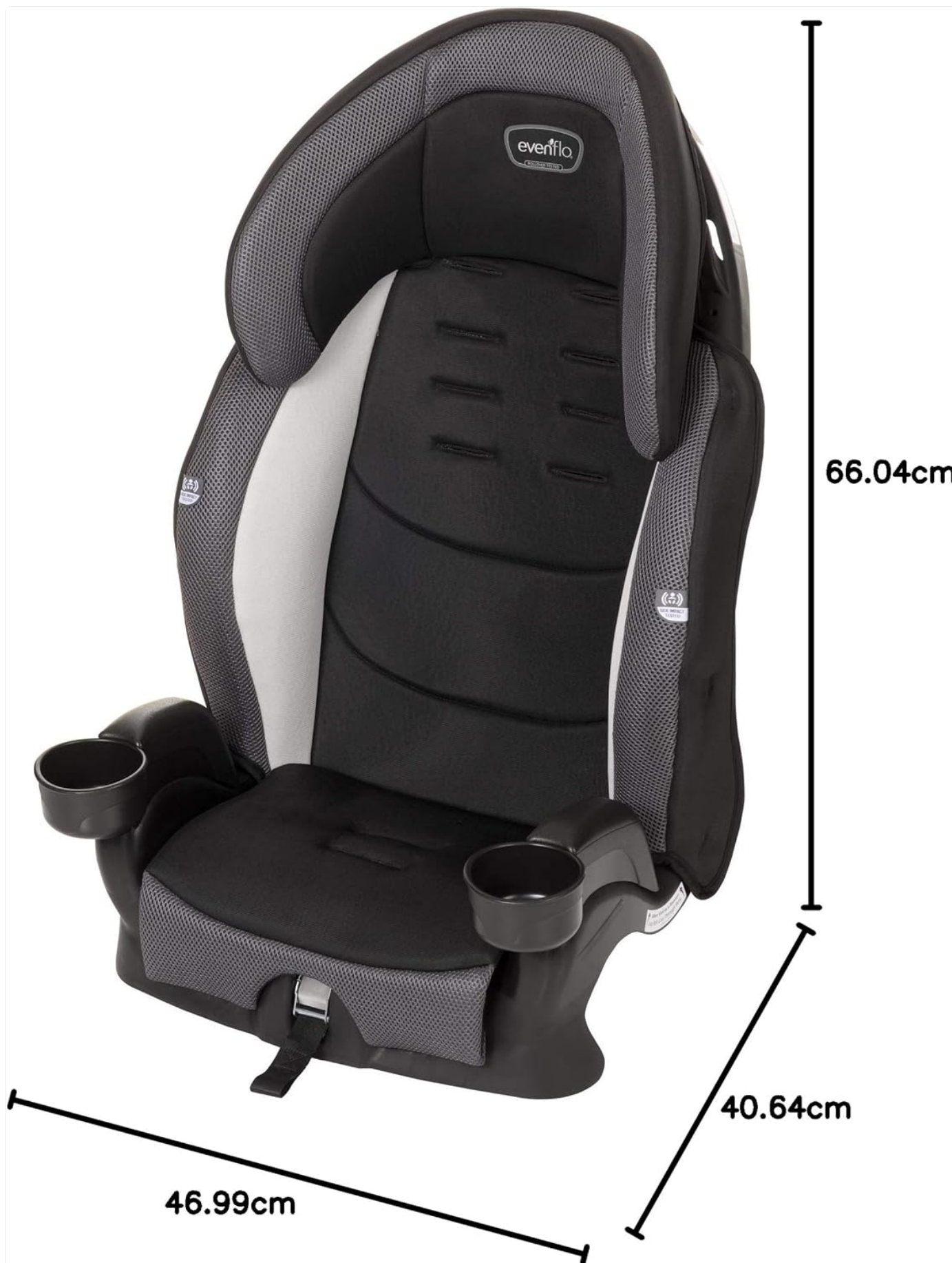
Diagram showing the key dimensions of the Evenflo Chase Plus 2-in-1 Booster Car Seat.