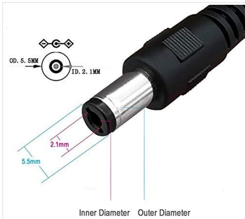
Image: Detailed view of the DC connector dimensions, illustrating the 2.1mm inner diameter and 5.5mm outer diameter for proper compatibility.