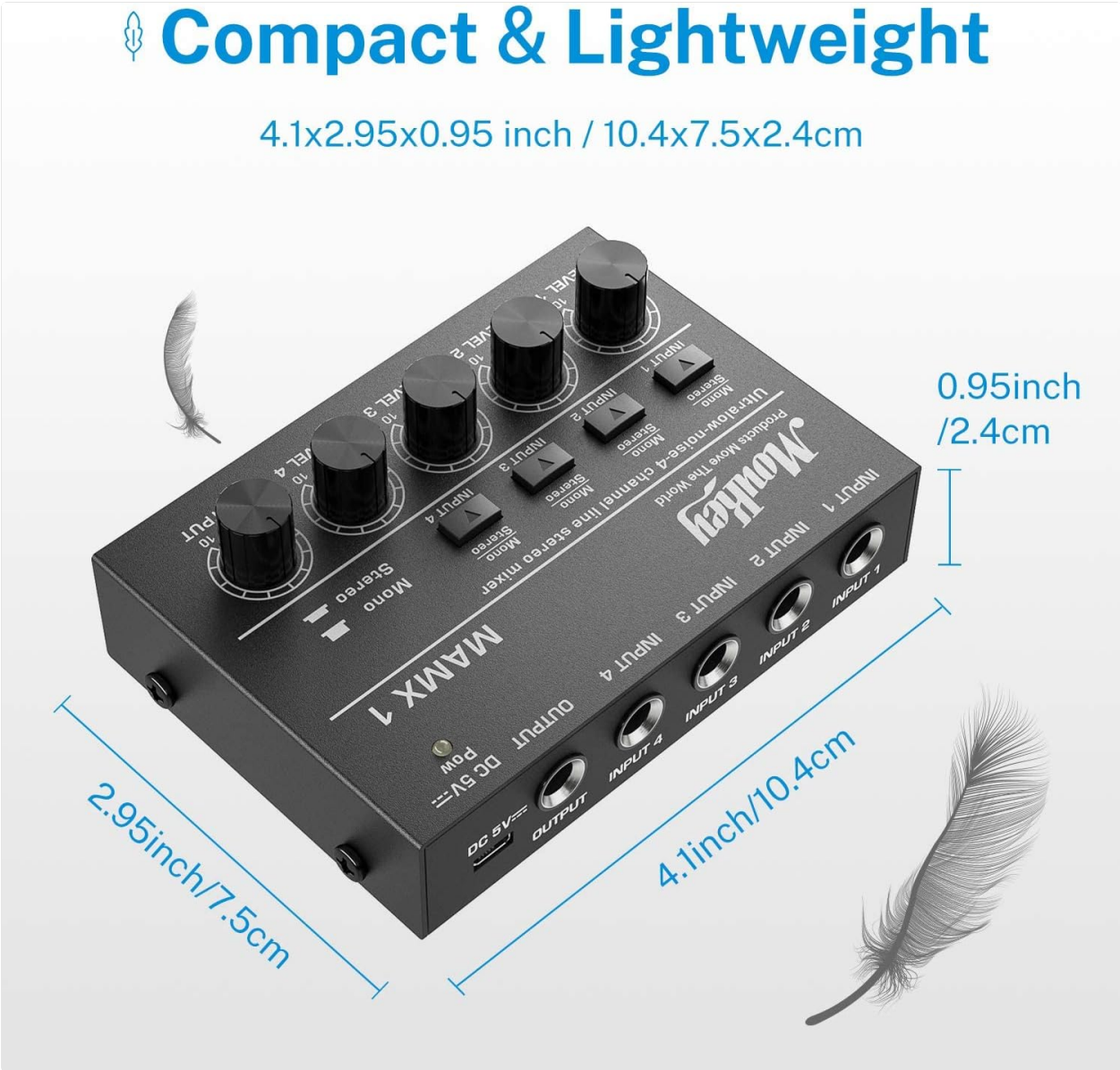
Figure 5.1: Compact and Lightweight Design with Dimensions.

This image highlights the compact and lightweight nature of the MAMX1 mixer, providing precise dimensions in both inches and centimeters for easy reference.