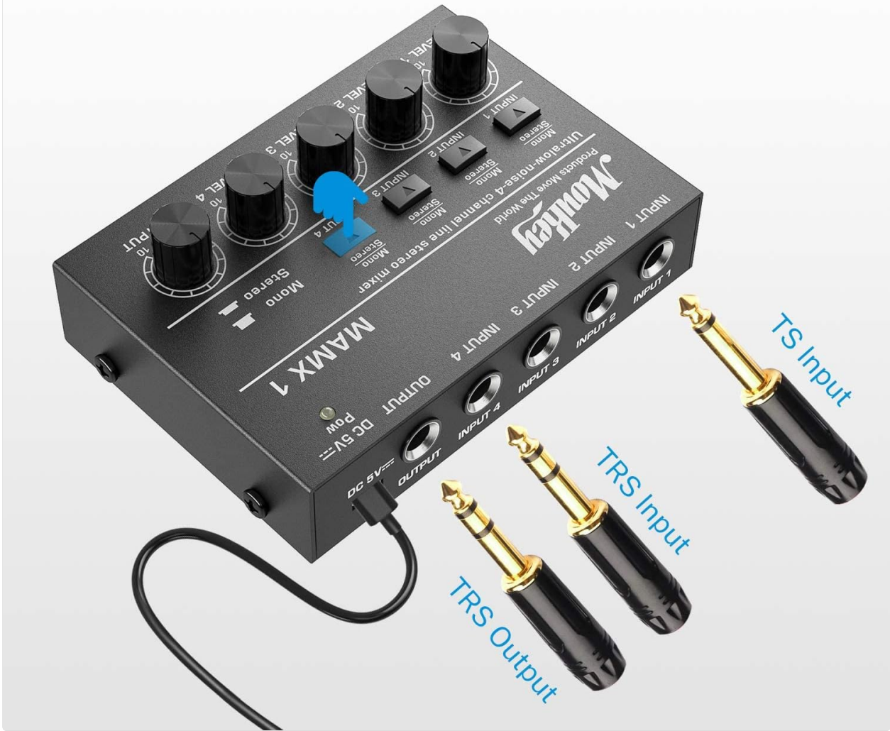
Figure 4.2: Stereo/Mono Input & Output Connections.

This visual guide demonstrates the correct cable types (TRS for stereo, TS for mono) for connecting audio sources to the mixer's inputs and outputs, crucial for proper stereo/mono operation.