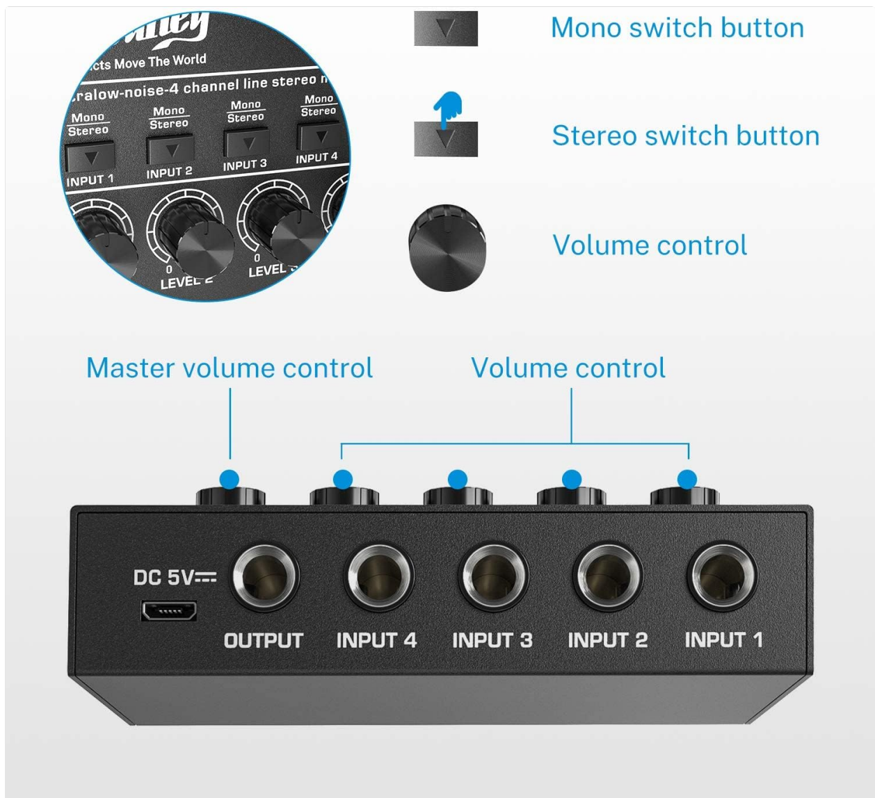
Figure 4.1: Control Layout of the MAMX1 Mixer.

This image provides a clear view of the mixer's front panel, detailing the individual input level knobs, the master output knob, and the mono/stereo switch buttons for each channel.