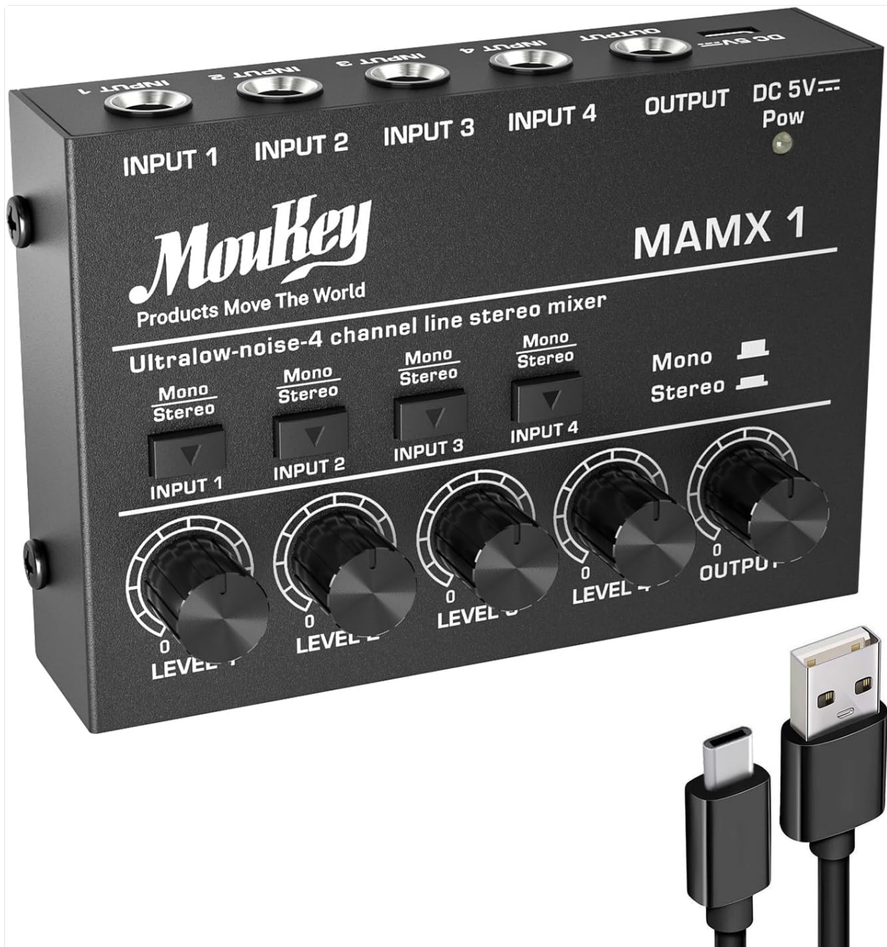
Figure 3.1: Moukey Mini Audio Mixer MAMX1 with included USB cable.

This image displays the compact Moukey MAMX1 mixer along with its USB power cable, highlighting its small size and simple design.