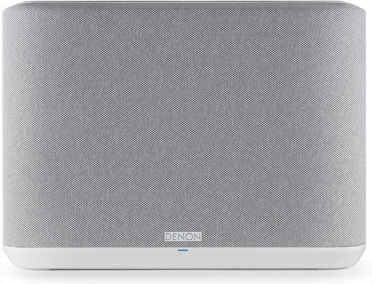
Front view of the Denon Home 250 Wireless Smart Speaker.