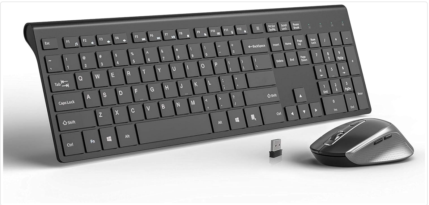
Image: The JOYACCESS wireless keyboard and mouse combo, featuring the full-size keyboard, ergonomic mouse, and the compact USB Nano receiver.