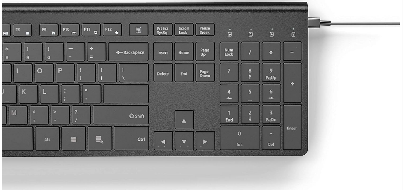
Image: Illustration showing the rechargeable keyboard and the mouse requiring one AA battery, with indicators for charging time (2 hours) and mouse battery life (up to 60 days).