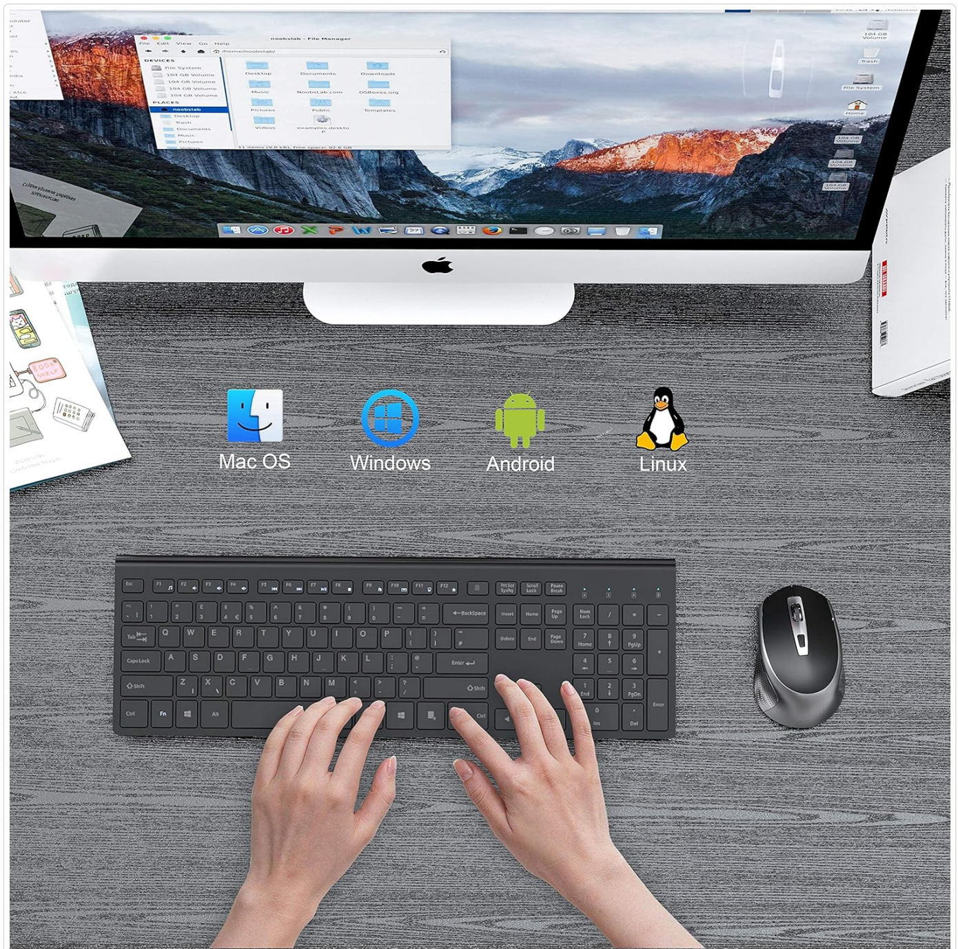
Image: An overhead view of the keyboard and mouse in use with a computer, displaying icons for Mac OS, Windows, Android, and Linux, indicating broad compatibility.