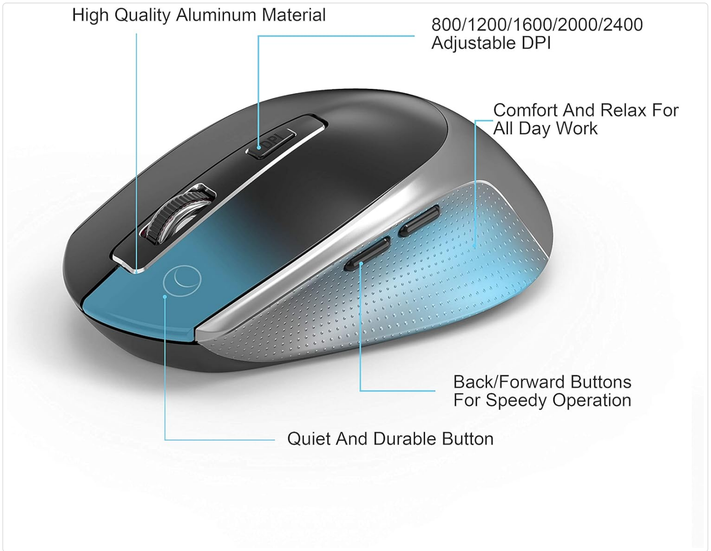
Image: Detailed diagram of the mouse, pointing out its features: high-quality aluminum material, 800-2400 adjustable DPI, comfortable ergonomic design, back/forward buttons, and quiet/durable buttons.