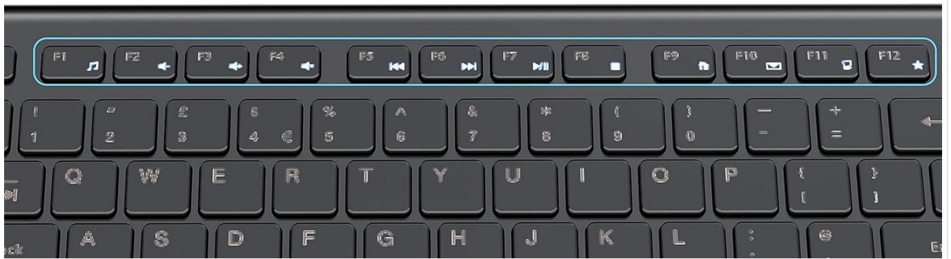
Image: Diagram illustrating the functions of the F1-F12 keys on the keyboard, including media controls, volume, navigation, and system functions.