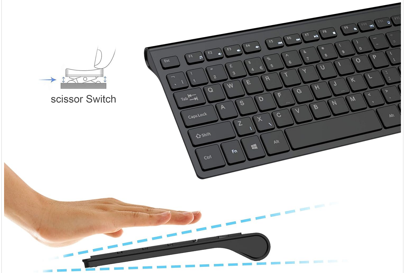
Image: Close-up view of the keyboard highlighting the scissor switch mechanism for smooth and quiet typing, and an illustration of the comfortable ergonomic typing angle.