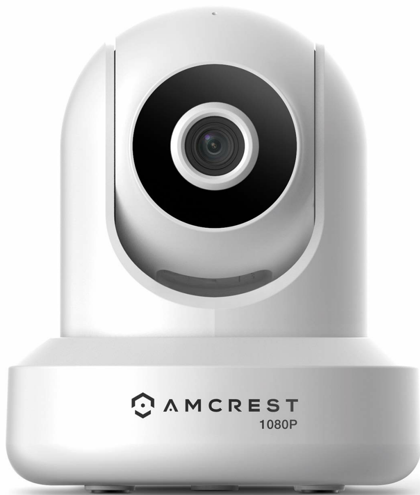
Figure 1.1: Amcrest 1080p WiFi Pan/Tilt Home Security Camera (IP2M-841W-V3)