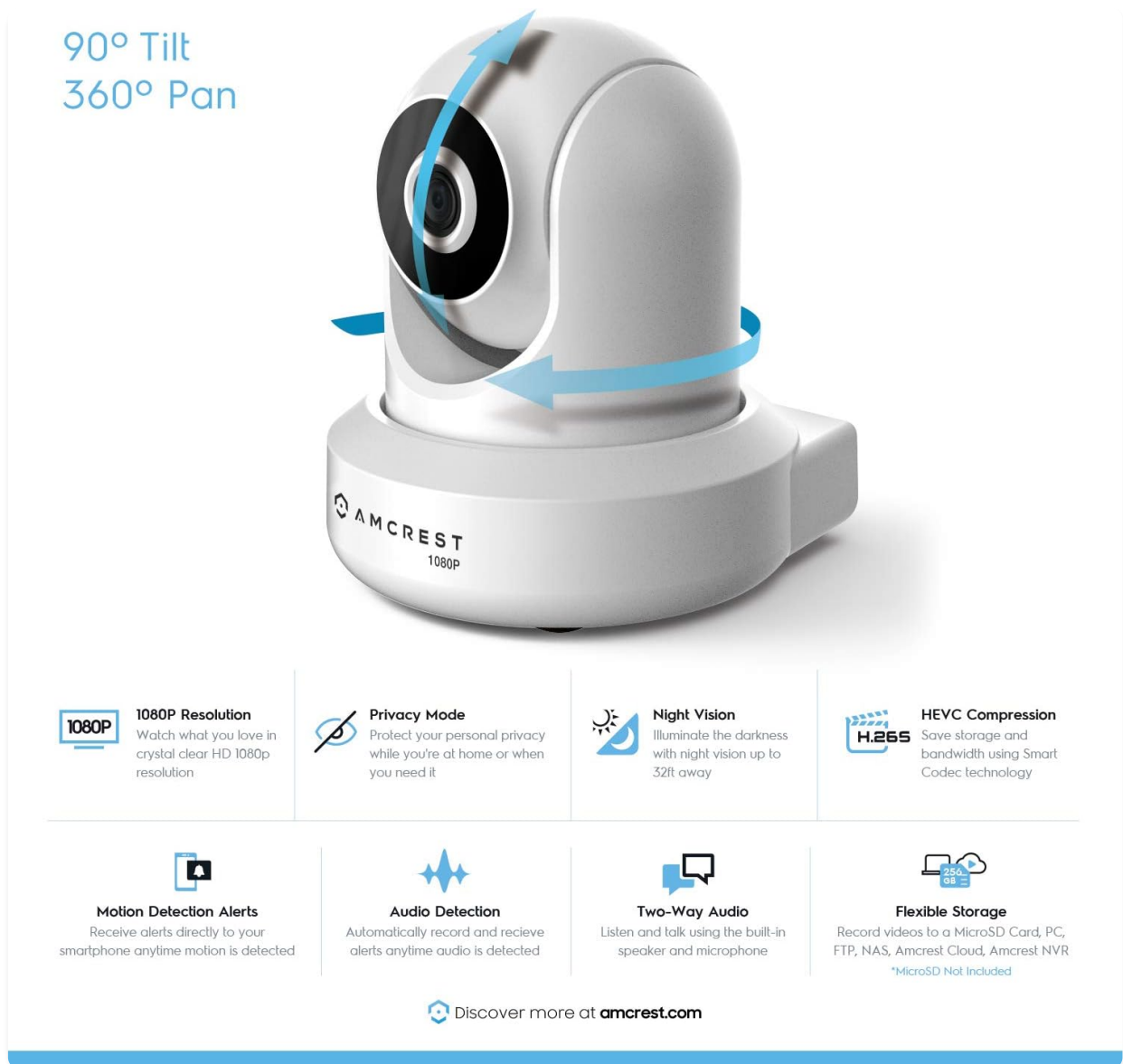
Figure 2.1: Contents of the Amcrest IP2M-841W-V3 package.