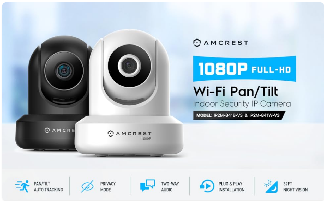
Figure 3.1: Overview of Amcrest IP2M-841W-V3 key features.