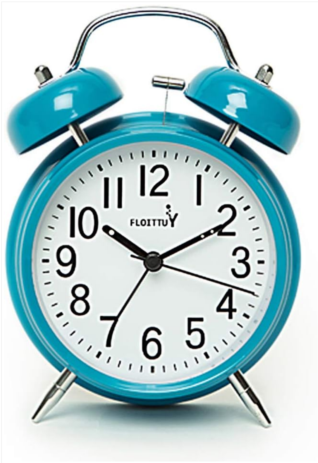
Image: Front view of the FLOITTUY 4" Twin Bell Alarm Clock in blue, showcasing its classic design with twin bells and a clear analog dial.