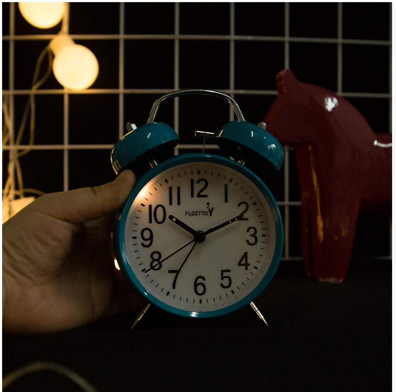
Image: A hand pressing the light button on the back of the alarm clock, demonstrating the backlight feature in a dark setting.