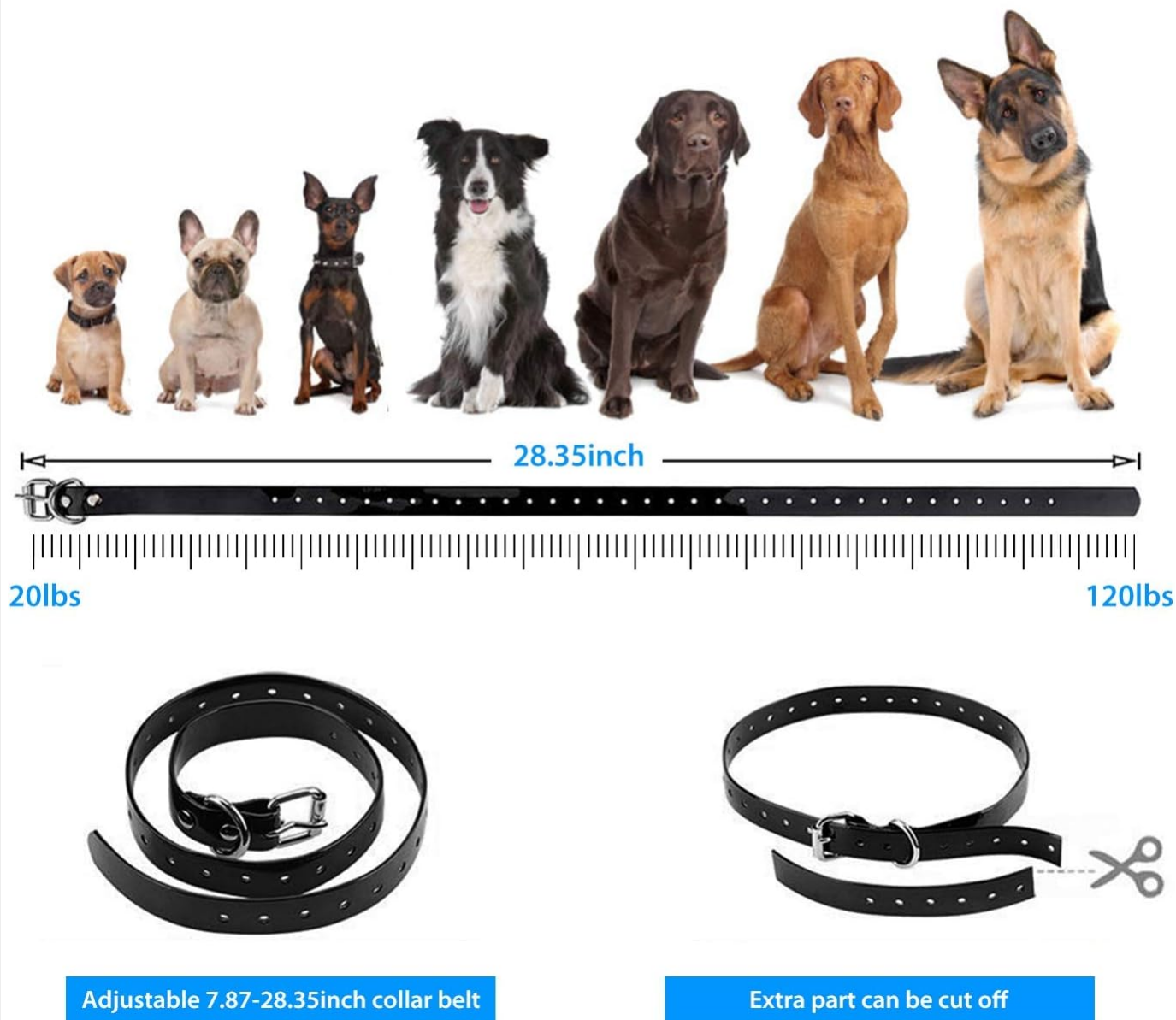
Image Description: This image illustrates the adjustable nature of the collar strap, showing its length (28.35 inches) and how it can be trimmed for a custom fit. It also depicts various dog breeds, indicating the collar's suitability for dogs weighing between 20lbs and 120lbs, and suggests it's suitable for most popular dogs without excessively dense or long neck hair.

Suit for most popular dogs without too dense and long neck hairs, such as akita, golden retriever, labrador and husky