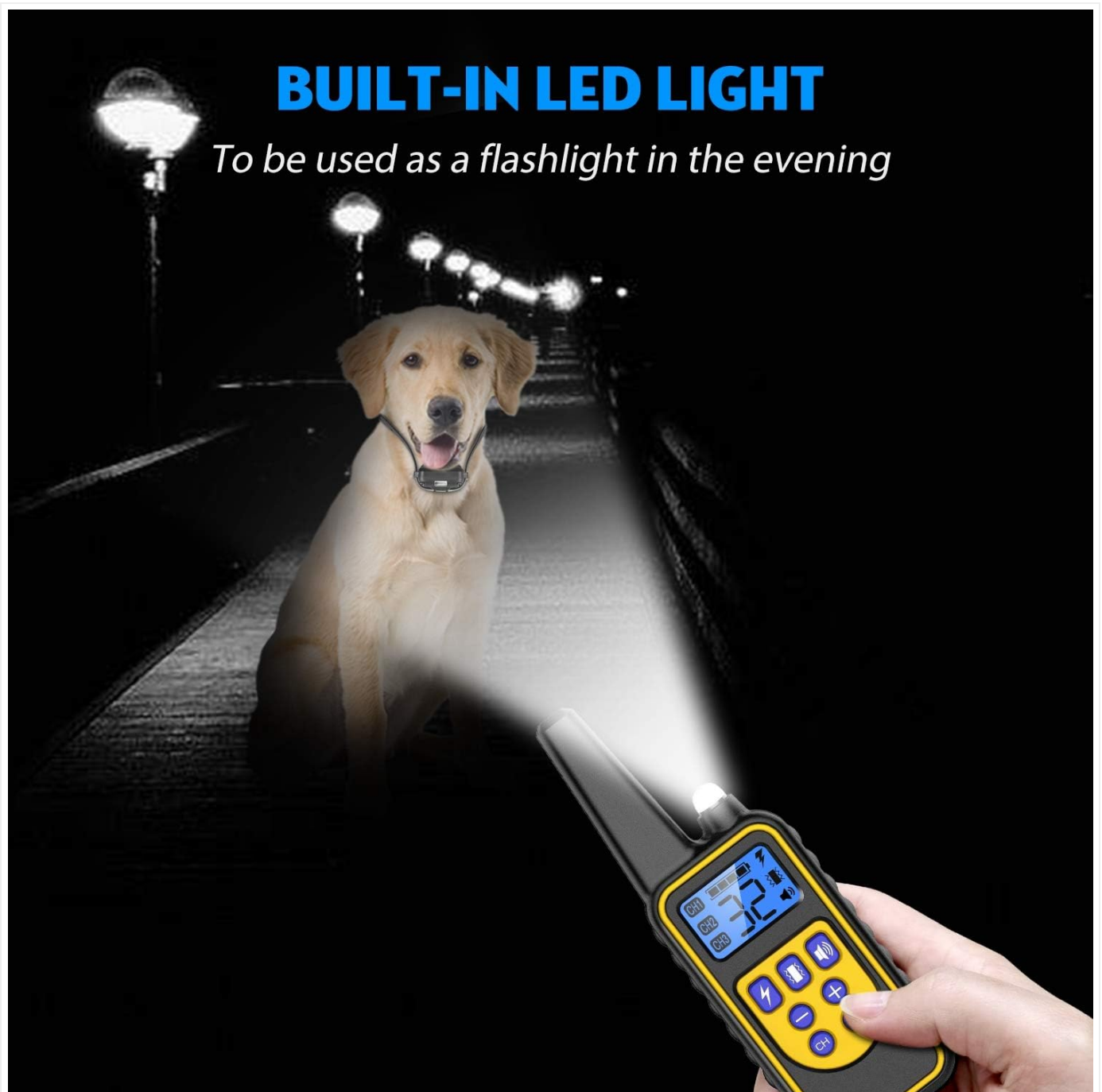
Image Description: This image shows a dog wearing the training collar in a dark outdoor setting, with a beam of light from the remote transmitter illuminating the dog. This highlights the built-in LED light feature of the remote, useful for locating or observing your dog in low-light conditions.