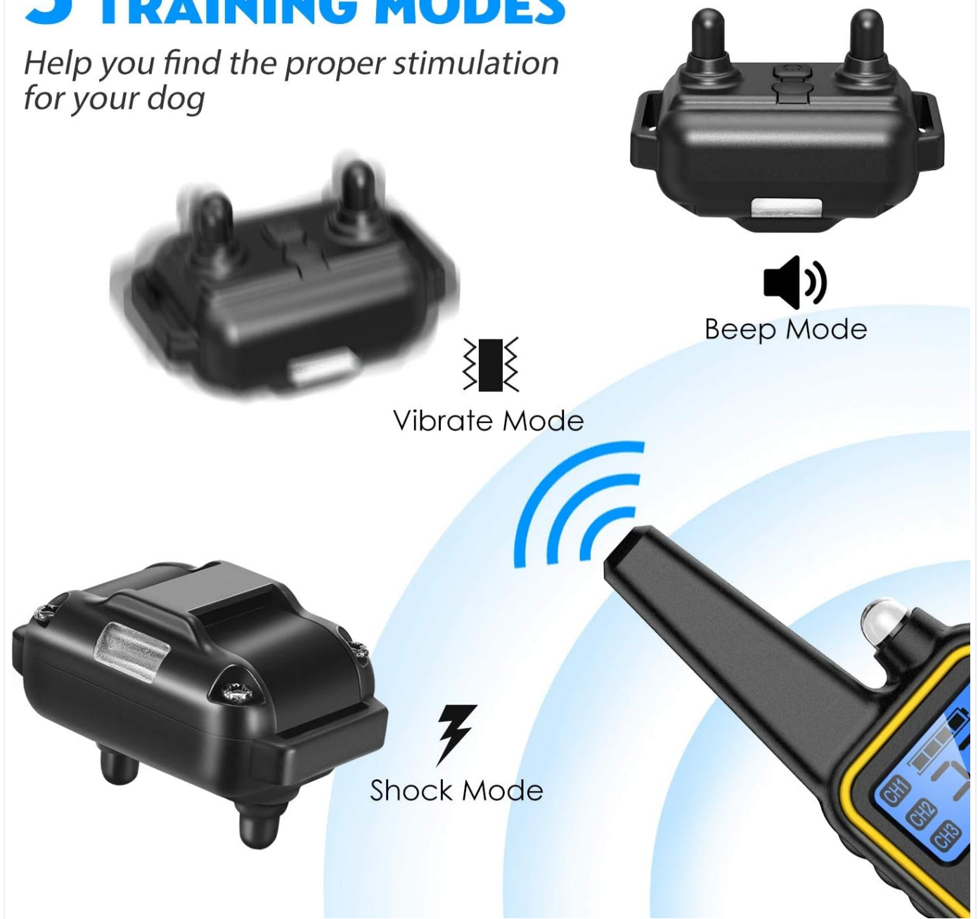
Image Description: This image visually represents the three training modes: Beep, Vibrate, and Shock. It shows the receiver collar in different states to symbolize each mode, helping users understand the distinct functions available for dog training.

Help you find the proper stimulation for your dog