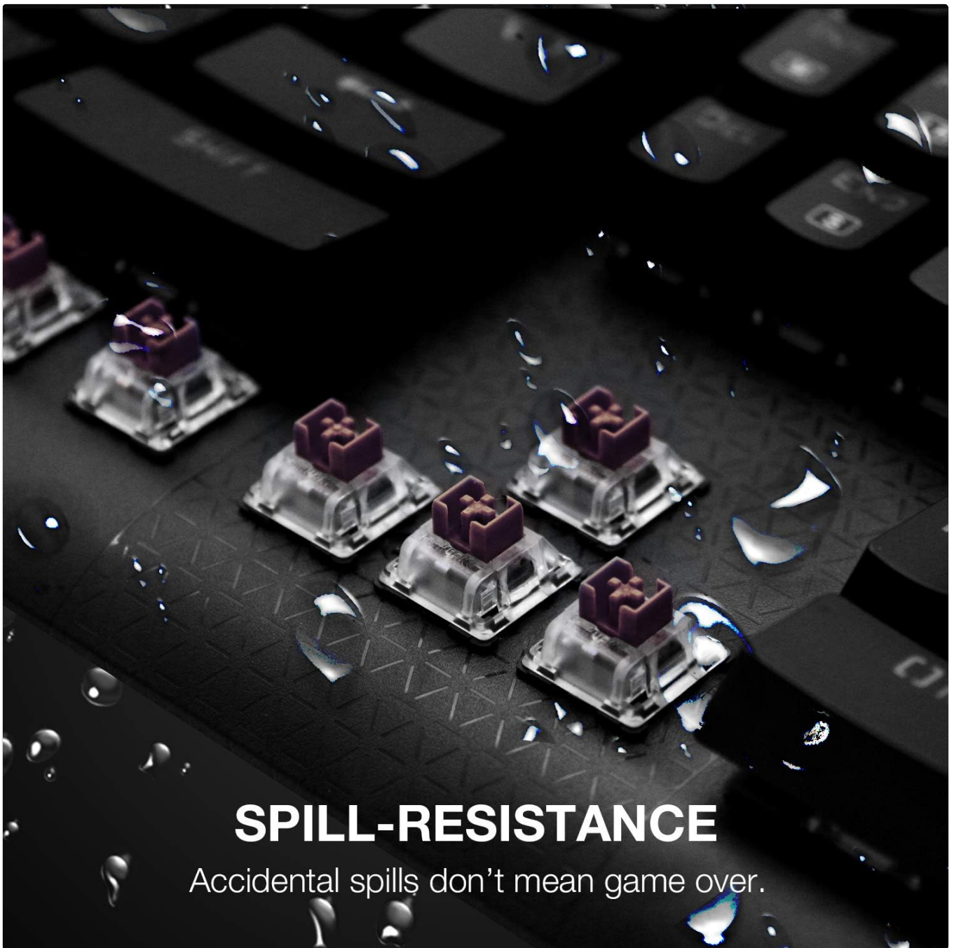
Figure 6: The keyboard's spill-resistant design.