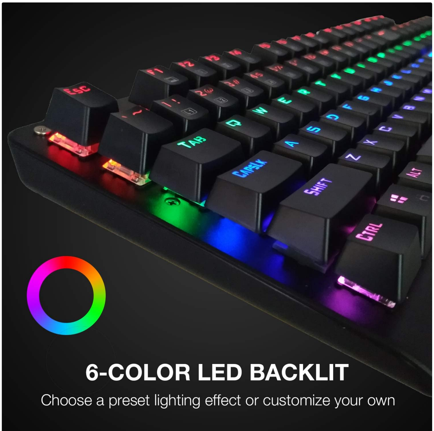
Figure 4: The keyboard's vibrant 6-color LED backlighting.