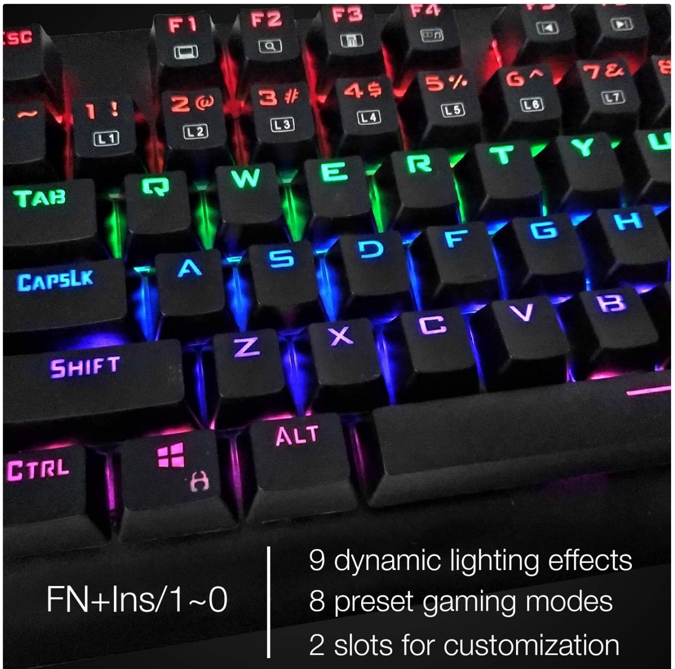
Figure 5: Key combinations for backlight control.