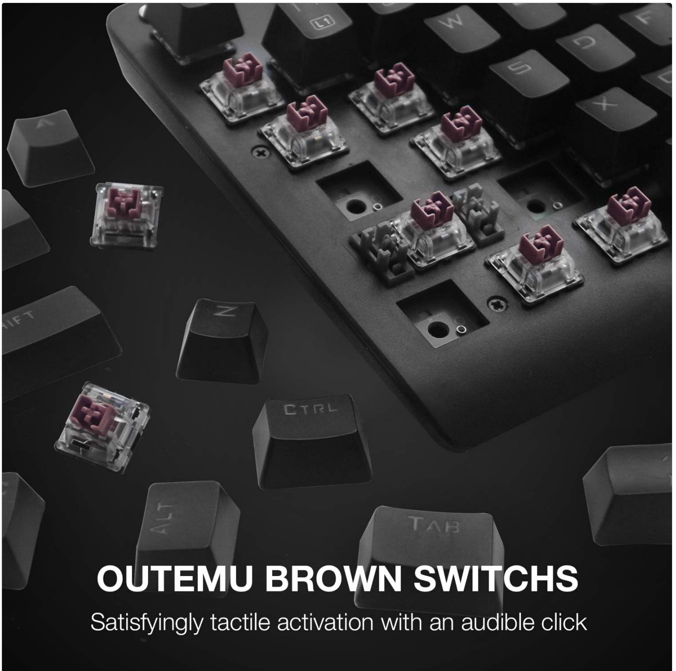
Figure 3: Close-up of Outemu Brown Switches.