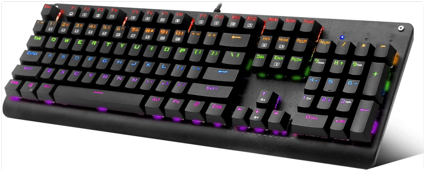
Figure 1: E-YOOSO K600 Mechanical Gaming Keyboard Overview

The E-YOOSO K600 Mechanical Gaming Keyboard is designed to provide a superior typing and gaming experience. It features durable mechanical brown switches, vibrant LED rainbow backlighting, and a robust, water-resistant design. This manual provides detailed instructions for setup, operation, maintenance, and troubleshooting to ensure optimal performance and longevity of your keyboard.