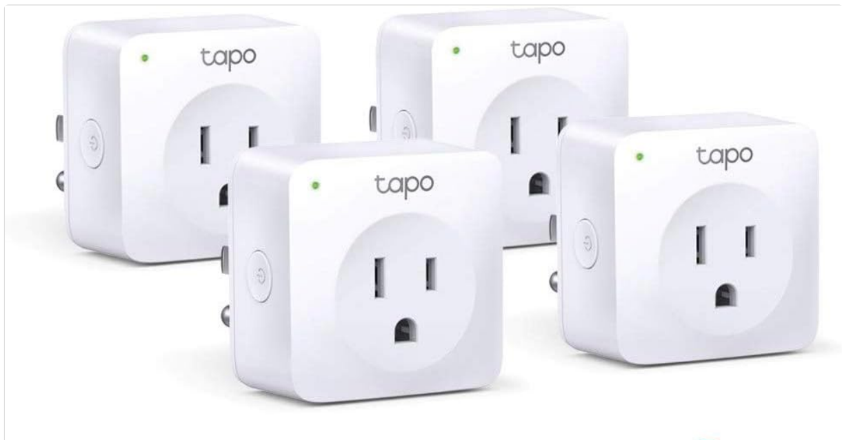
Image: Four Tapo P100 Smart Plugs

This manual provides detailed instructions for the setup, operation, and maintenance of your TP-Link Tapo P100 Smart Plugs. The Tapo P100 is a compact Wi-Fi smart plug designed to control connected devices remotely, set schedules, and integrate with voice assistants.