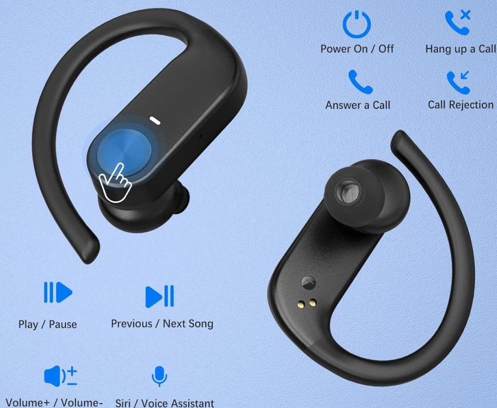
Image: Visual representation of the various button control functions for the earbuds.

Reject the tedious operation, one key tap to attain multiple functions, freeing your hands