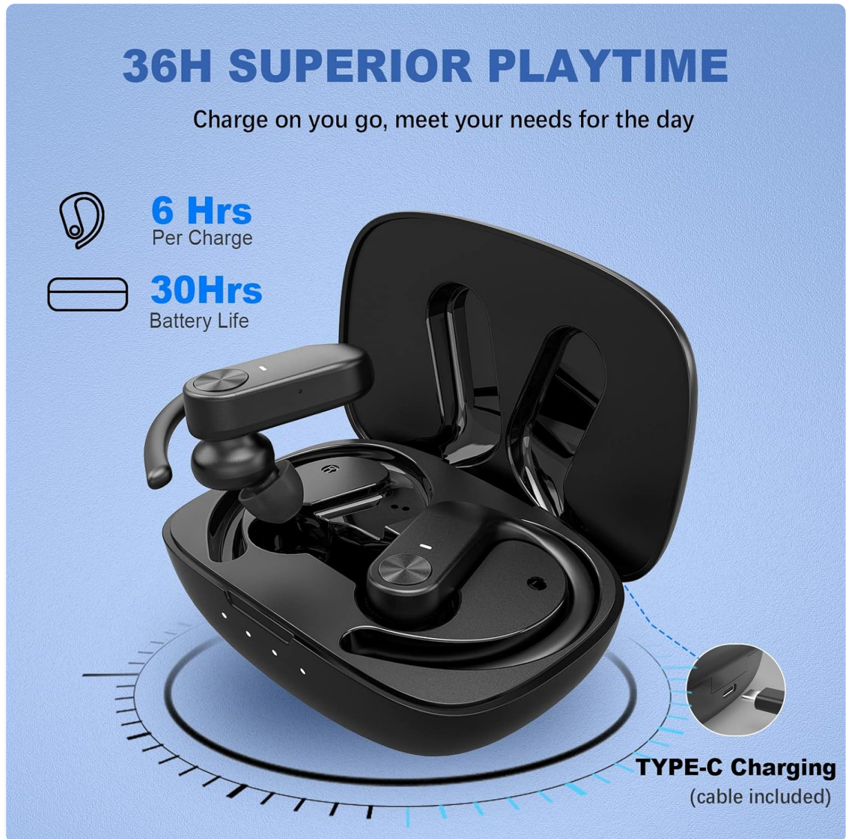
Image: The earbuds and charging case, highlighting their extended battery life and charging method.