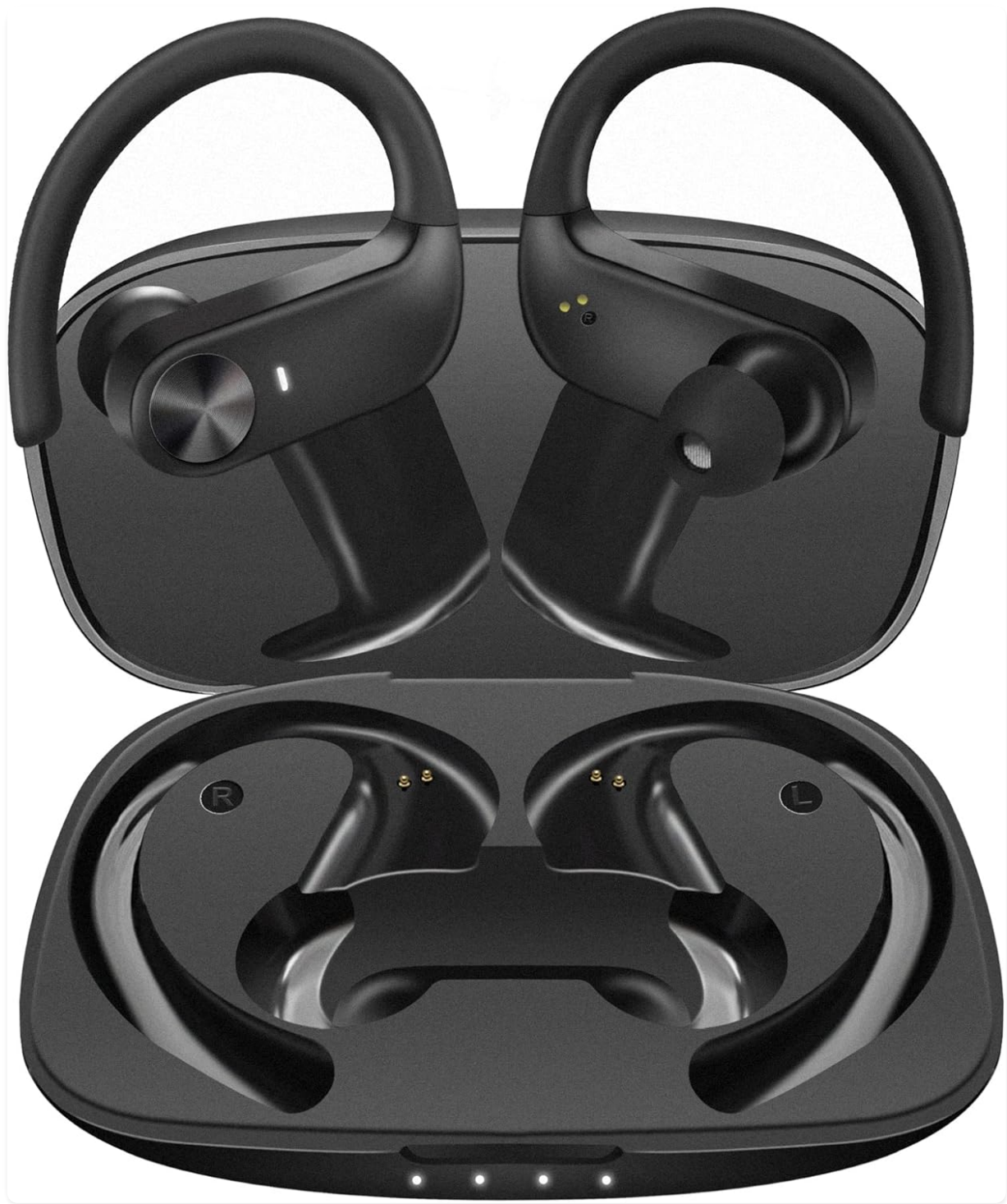
Image: BEBEN X8 True Wireless Earbuds in their charging case, showcasing their compact design.