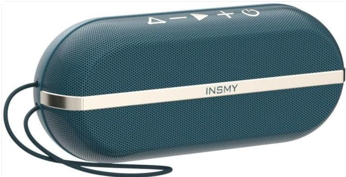
Figure 2: Side view of the INSMY Bluetooth Speaker, highlighting its compact and sleek design.