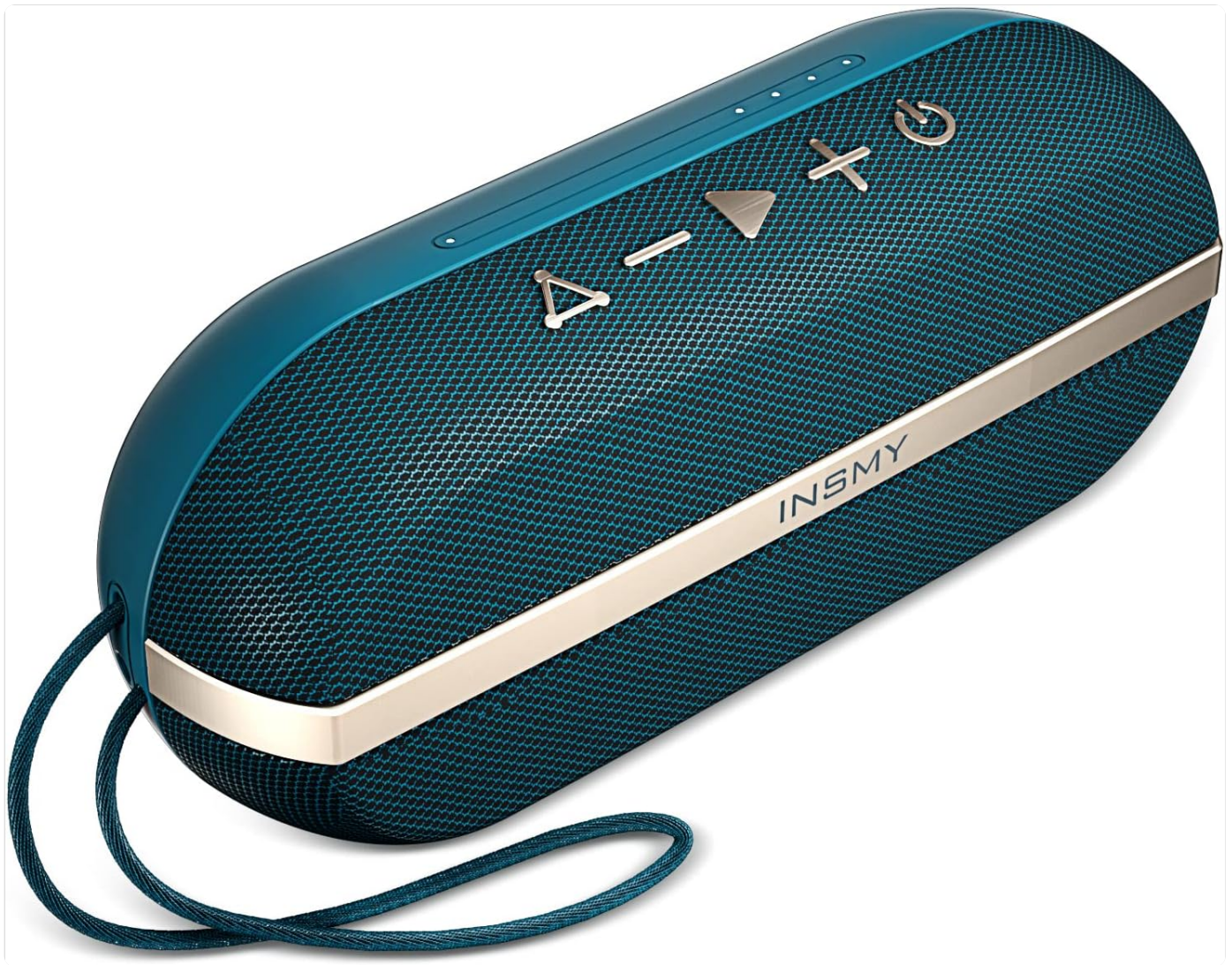
Figure 1: Front view of the INSMY Bluetooth Speaker, showcasing its blue mesh grille and control buttons.