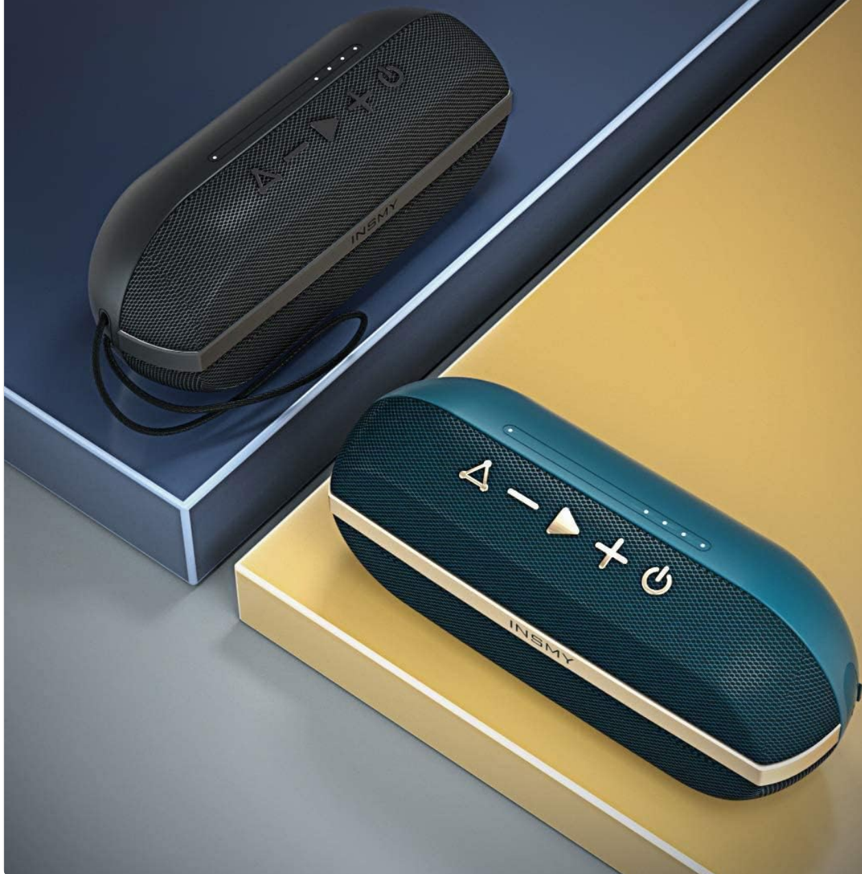
Figure 4: Two INSMY speakers configured for stereo pairing, enhancing the audio experience.

Pair two speakers via a single device for double the volume or bold stereo sound