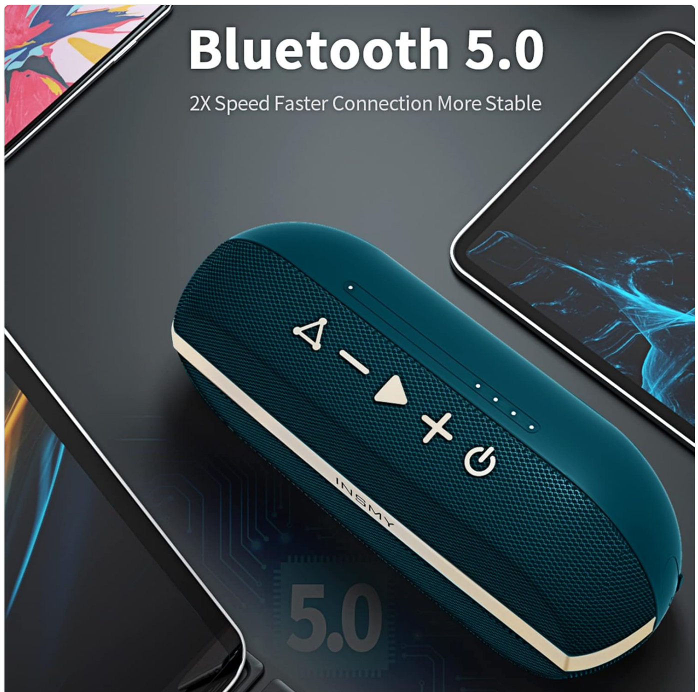
Figure 3: The INSMY speaker demonstrating its Bluetooth connectivity with various devices.