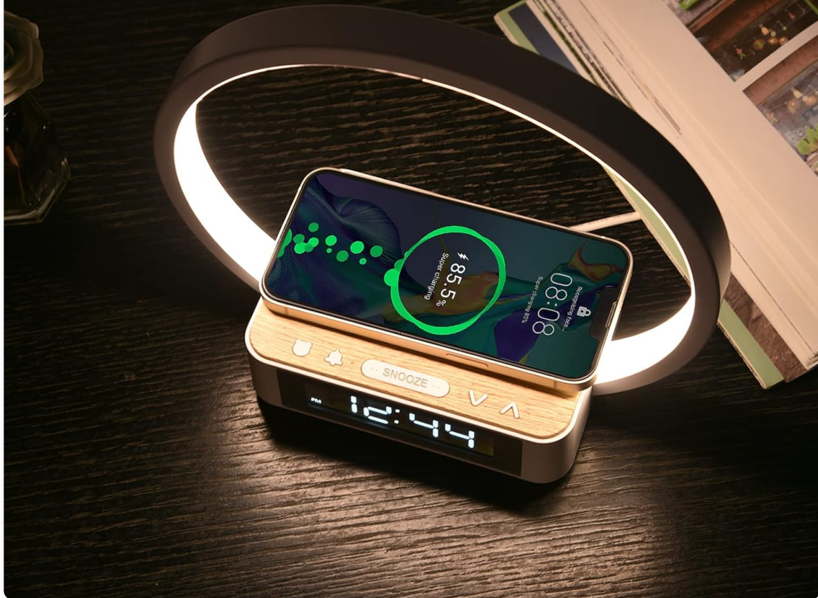
Image: A smartphone placed on the blonbar Desk Lamp's base, showing the Qi wireless charging function in progress.

Your browser does not support the video tag.