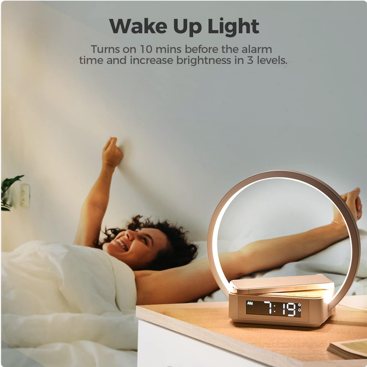
Image: A woman stretching in bed as the blonbar Desk Lamp illuminates the room, demonstrating the wake-up light feature.

Turns on 10 mins before the alarm time and increase brightness in 3 levels.