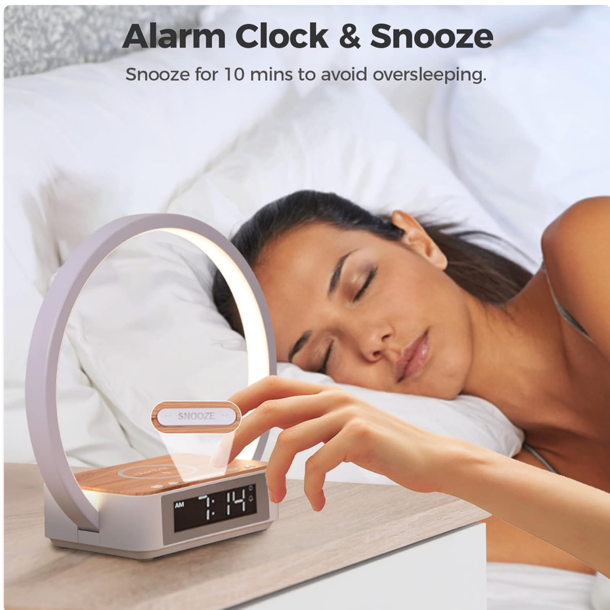
Image: A woman's hand reaching to press the 'Snooze' button on the blonbar Desk Lamp, with the time 7:14 displayed.