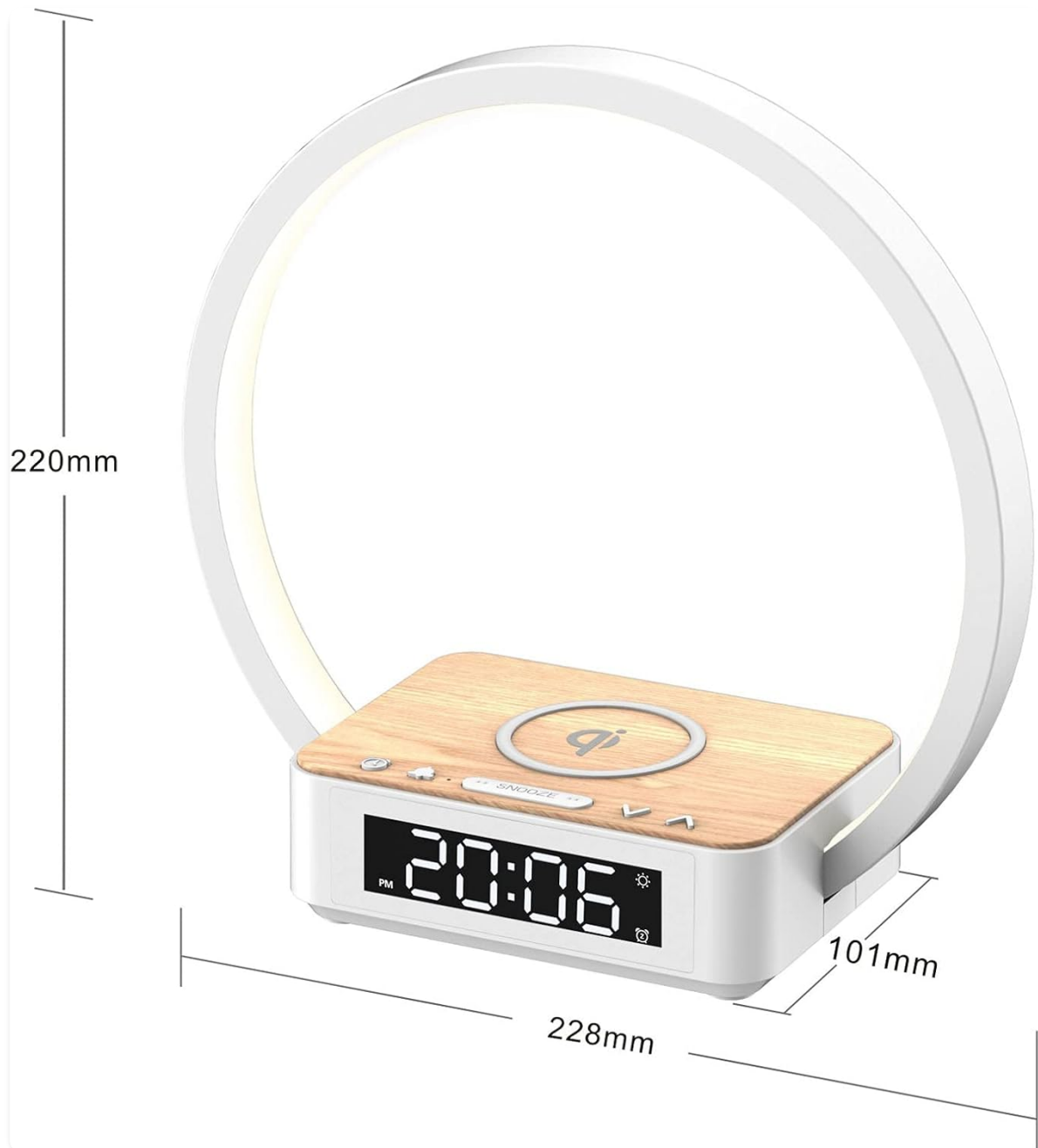
Image: Product dimensions for placement reference.

Your browser does not support the video tag.