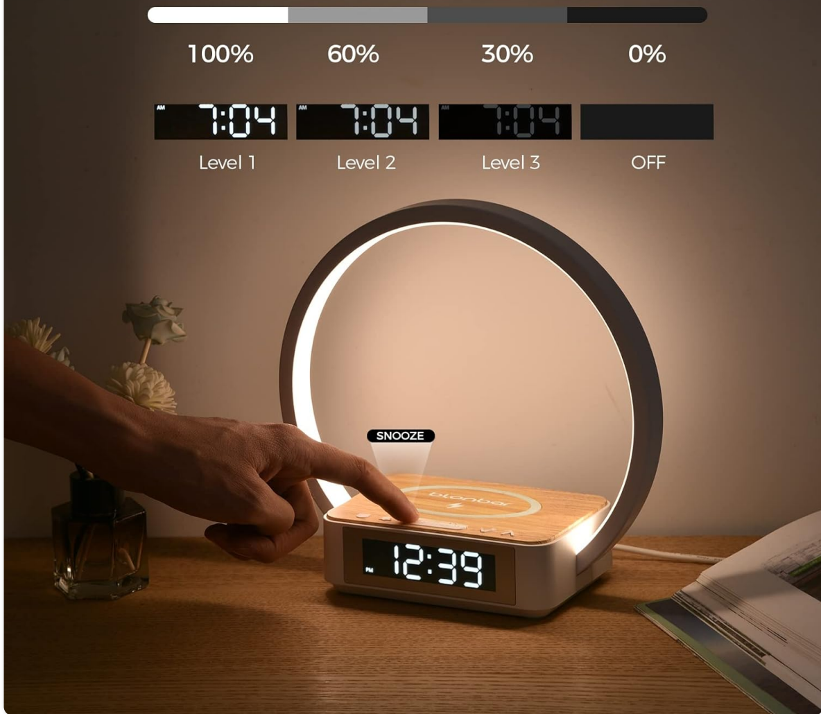
Image: Illustrates the LED screen brightness adjustment from 100% to 0% (off) across three levels.