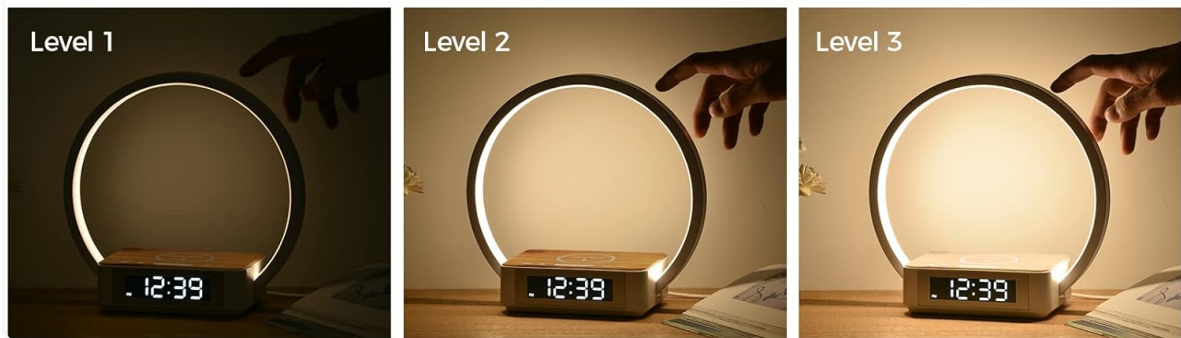
Image: The blonbar Desk Lamp, showcasing its integrated alarm clock, wireless charging pad, and LED light ring.