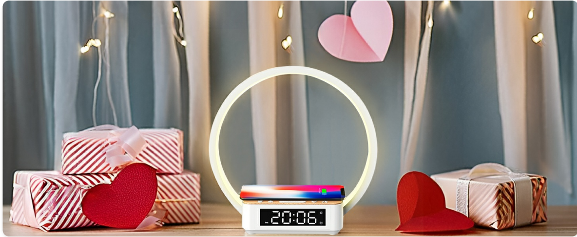
Image: The blonbar Desk Lamp positioned on a bedside table, highlighting its aesthetic appeal.