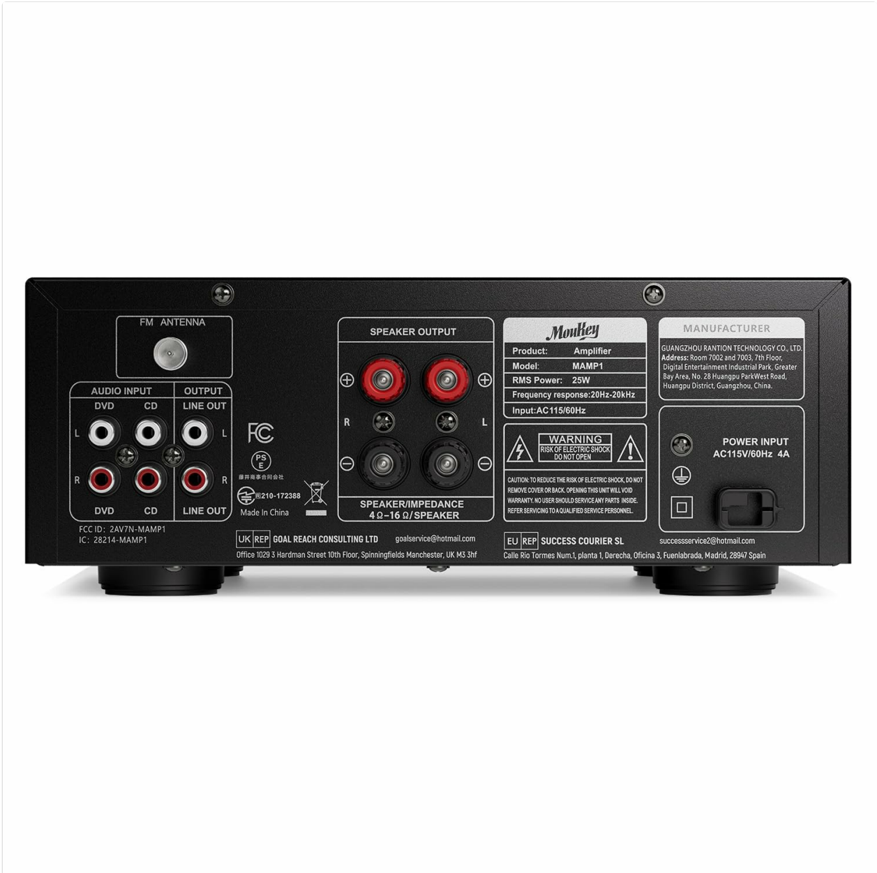
Image: Rear view of the Moukey MAMP1 amplifier, showing all input and output ports.

The rear panel houses the main audio input and output connections.