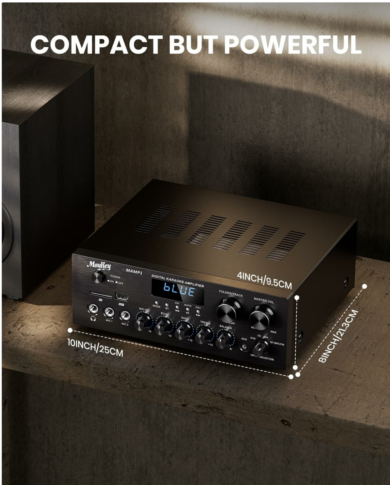
Image: The Moukey MAMP1 amplifier with its dimensions labeled.