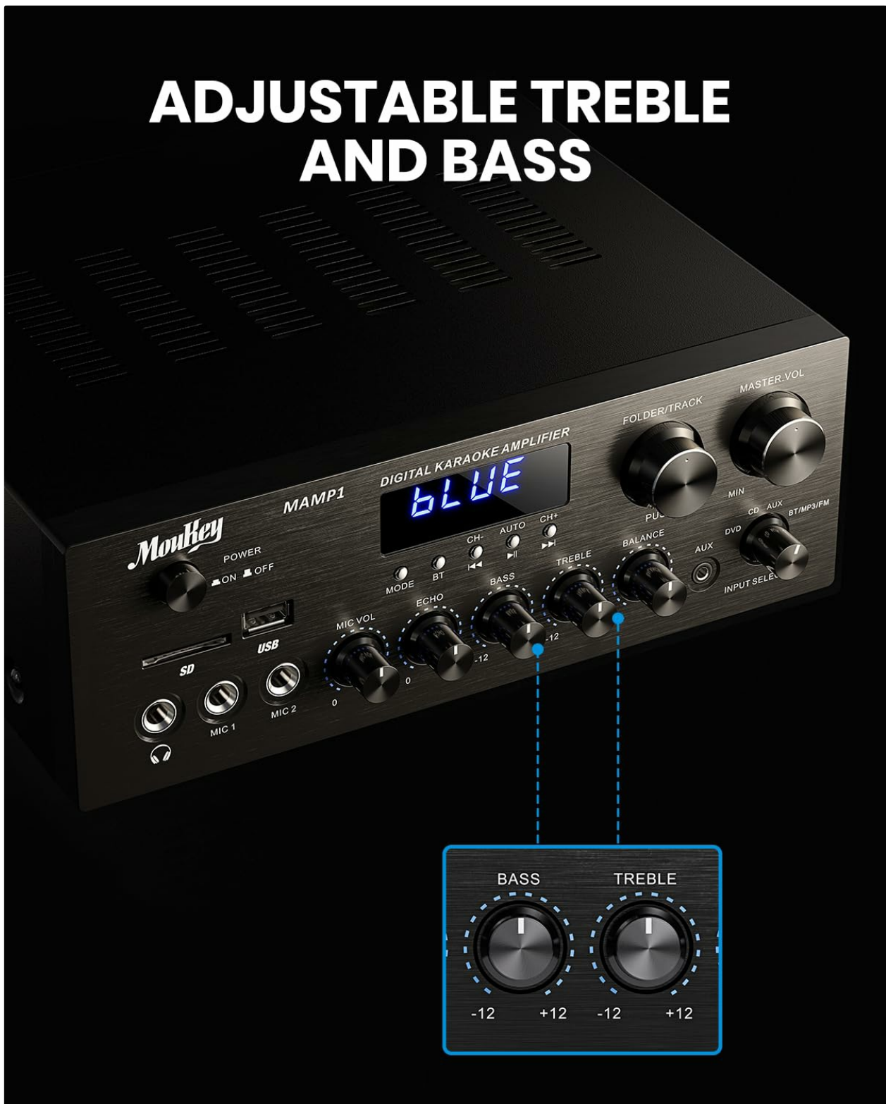
Image: Close-up of the Moukey MAMP1 showing the Bass and Treble adjustment knobs.