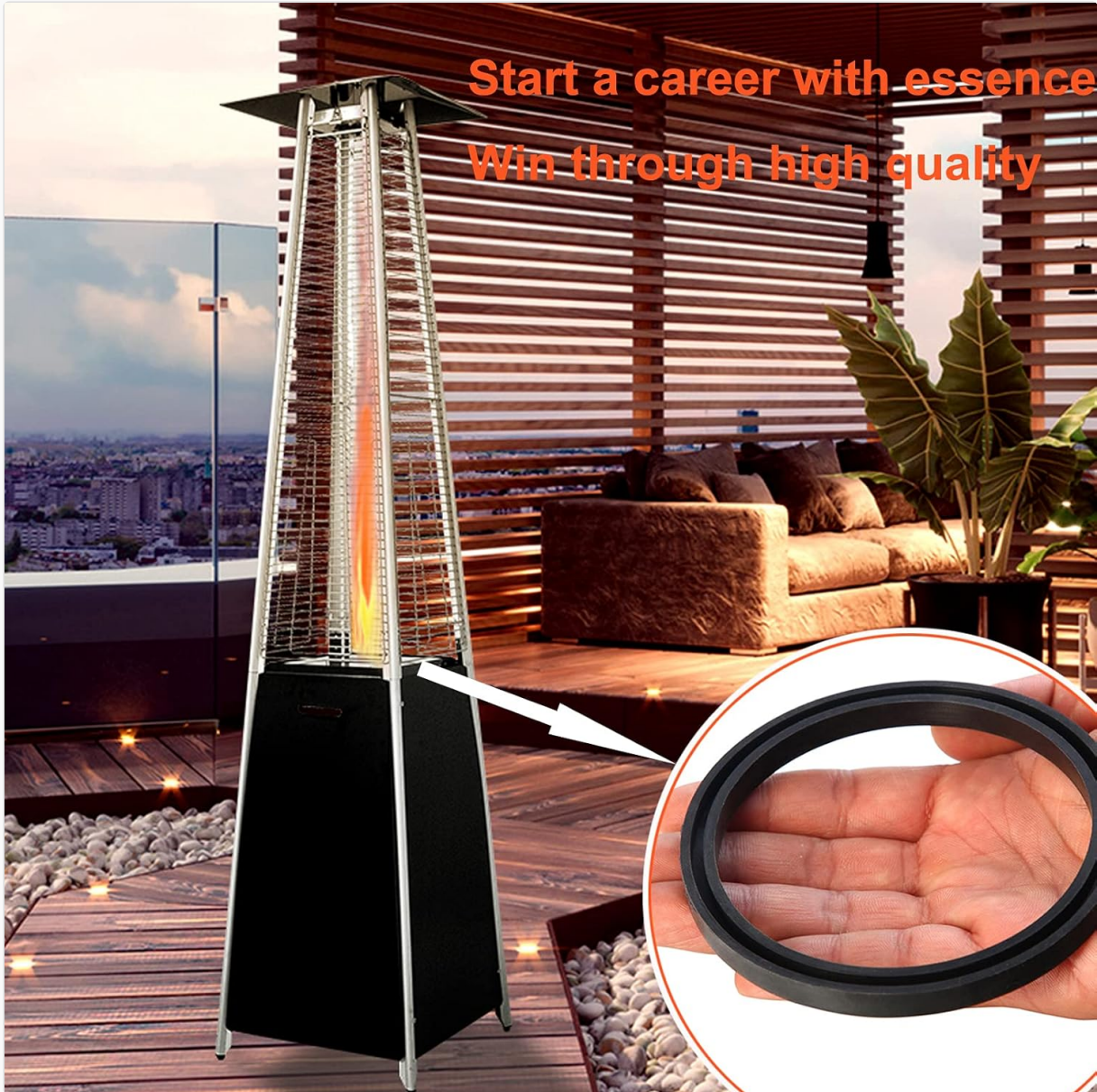
Image: A patio heater with a close-up of a hand holding the silicone support ring, indicating its placement during installation.

Video: This video demonstrates the process of installing the glass tube replacement, including attaching the rubber ring and carefully guiding the tube into the patio heater's frame.