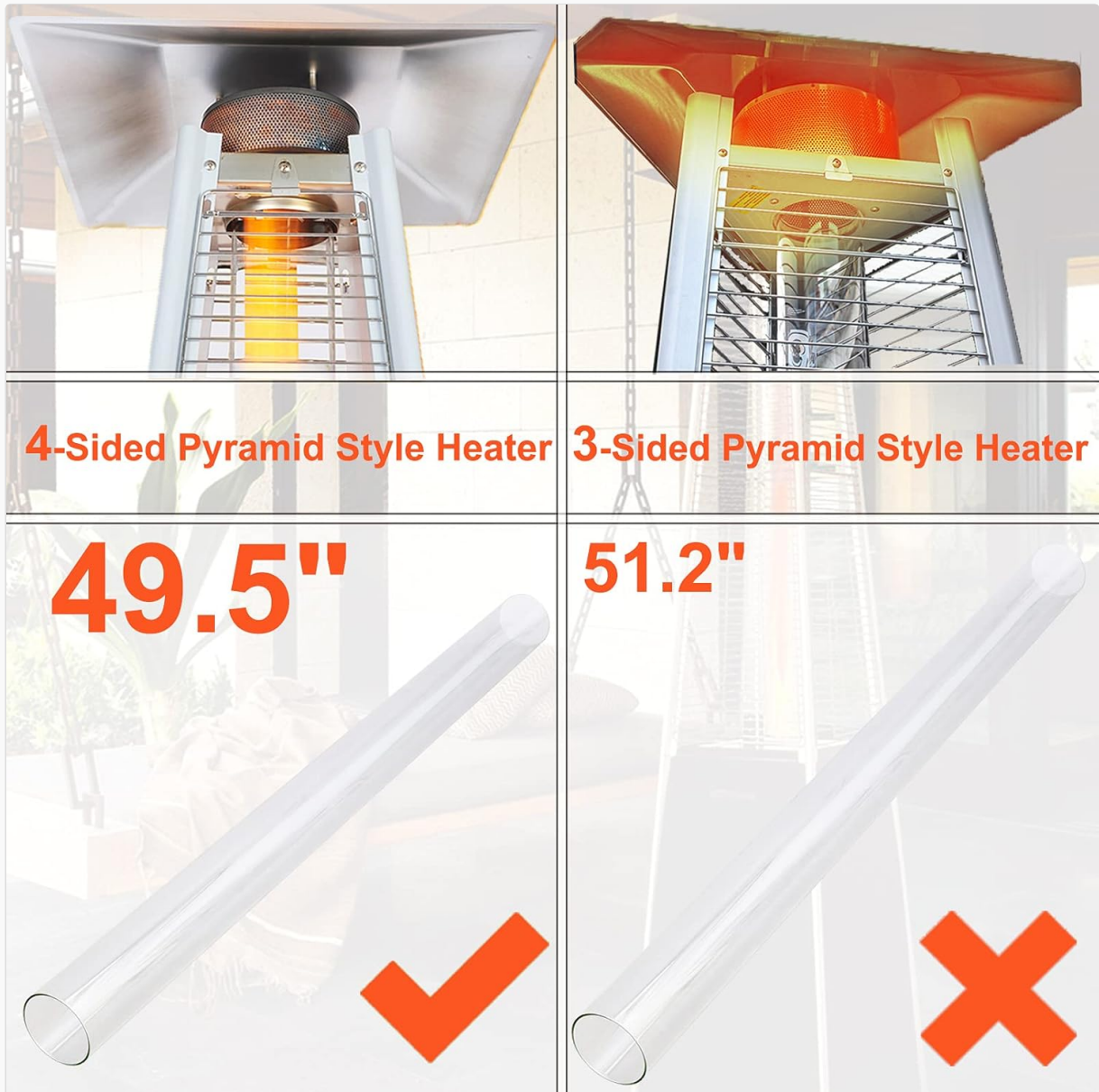
Image: Visual comparison illustrating that the 49.5-inch glass tube is suitable for 4-sided pyramid style heaters, but not for 3-sided models which typically require a 51.2-inch tube.

Reference model numbers for compatibility include: 584736, 639564, PH08-SB, HLDS01-GTHG, HLDS01-GTSS, HLDS01-GTPC.