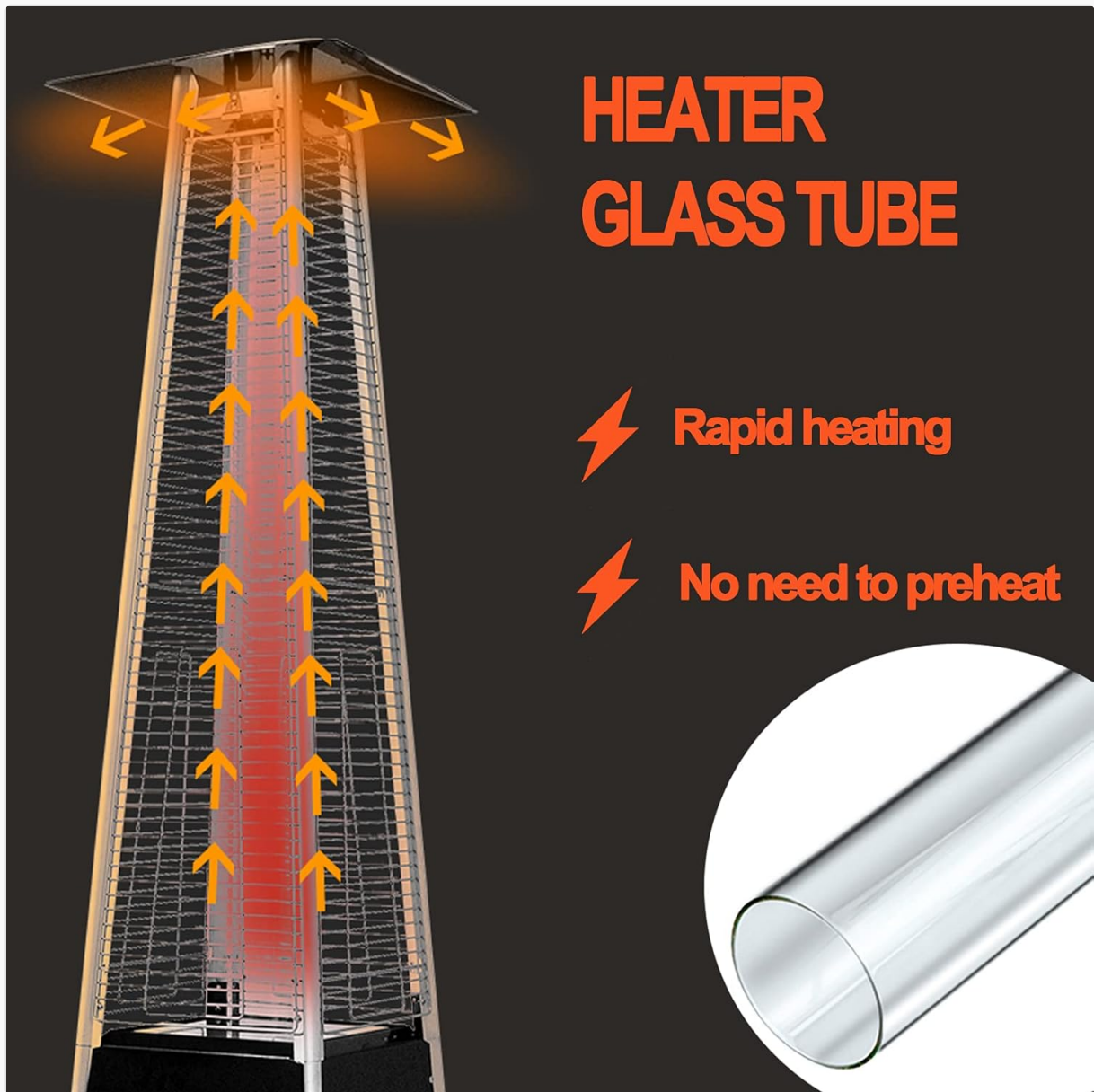
Image: A diagram illustrating the heat distribution within a patio heater, highlighting the rapid heating capability of the glass tube without the need for preheating.