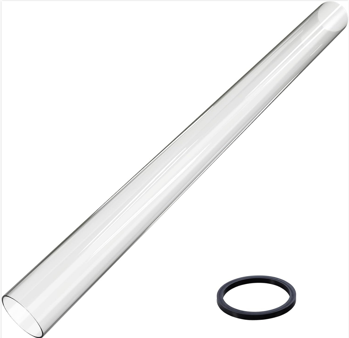
Image: The SUMNEW 49.5-inch glass tube replacement shown with its accompanying silicone support ring.