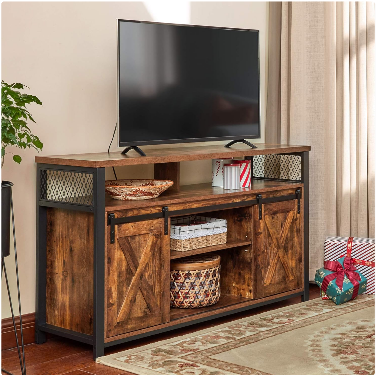
Image 1.1: The VASAGLE TV Cabinet ULTV46BX, showcasing its rustic brown and black industrial design with a television placed on its top surface.