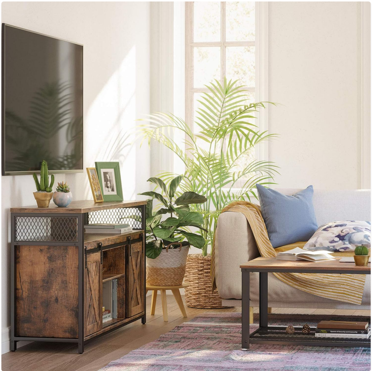
Image 6.2: An interior perspective of the TV cabinet, highlighting the adjustable shelves and open compartments suitable for organizing various media and decorative items.