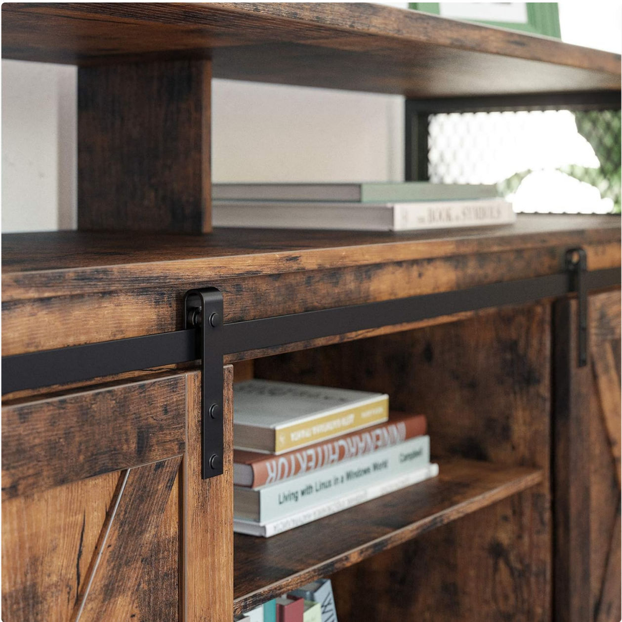
Image 6.1: A detailed view of the metal track and roller mechanism that enables the smooth operation of the sliding barn doors.