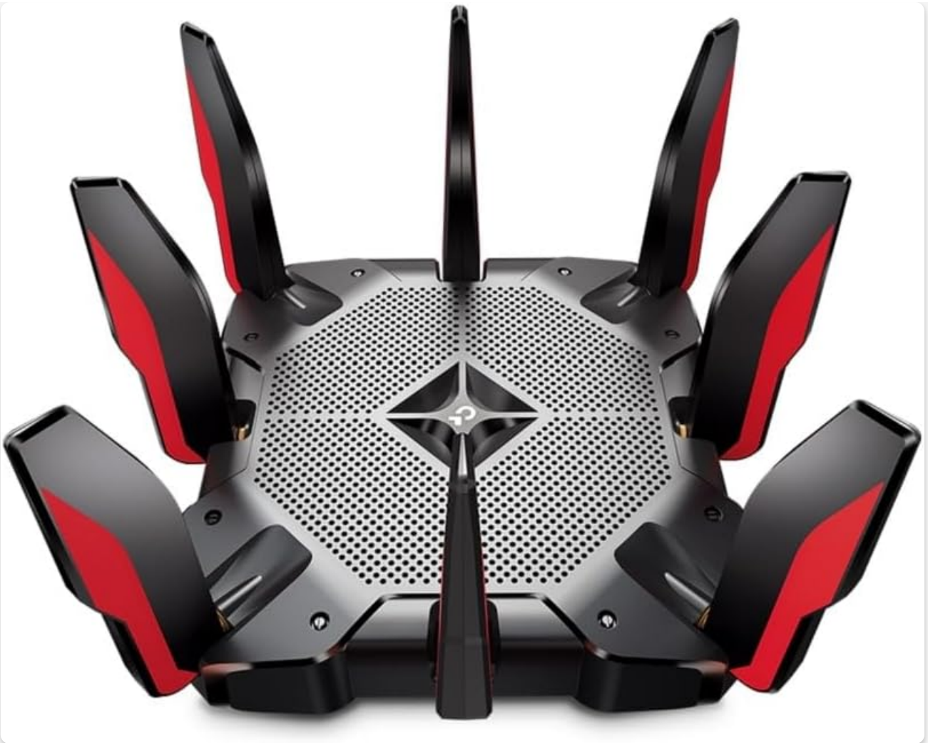
Image: The TP-Link Archer AX11000 router, showcasing its distinctive design with multiple external antennas.