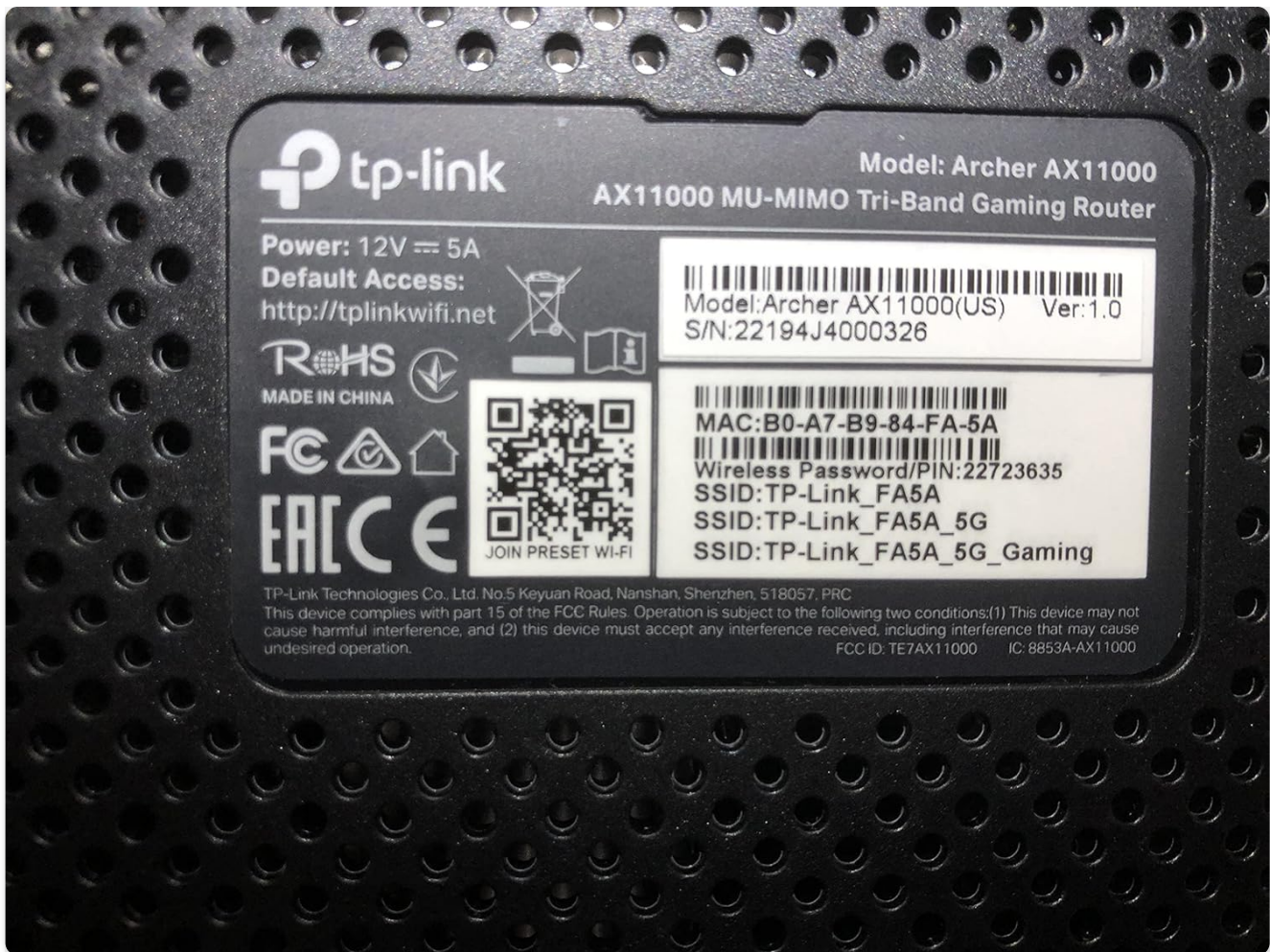
Image: The product label on the bottom of the router, displaying default Wi-Fi credentials and management access details. Default Wi-Fi Network (SSID): TP-Link_FA5A, Password: 22723635. Click here to connect to default Wi-Fi (if supported by device).