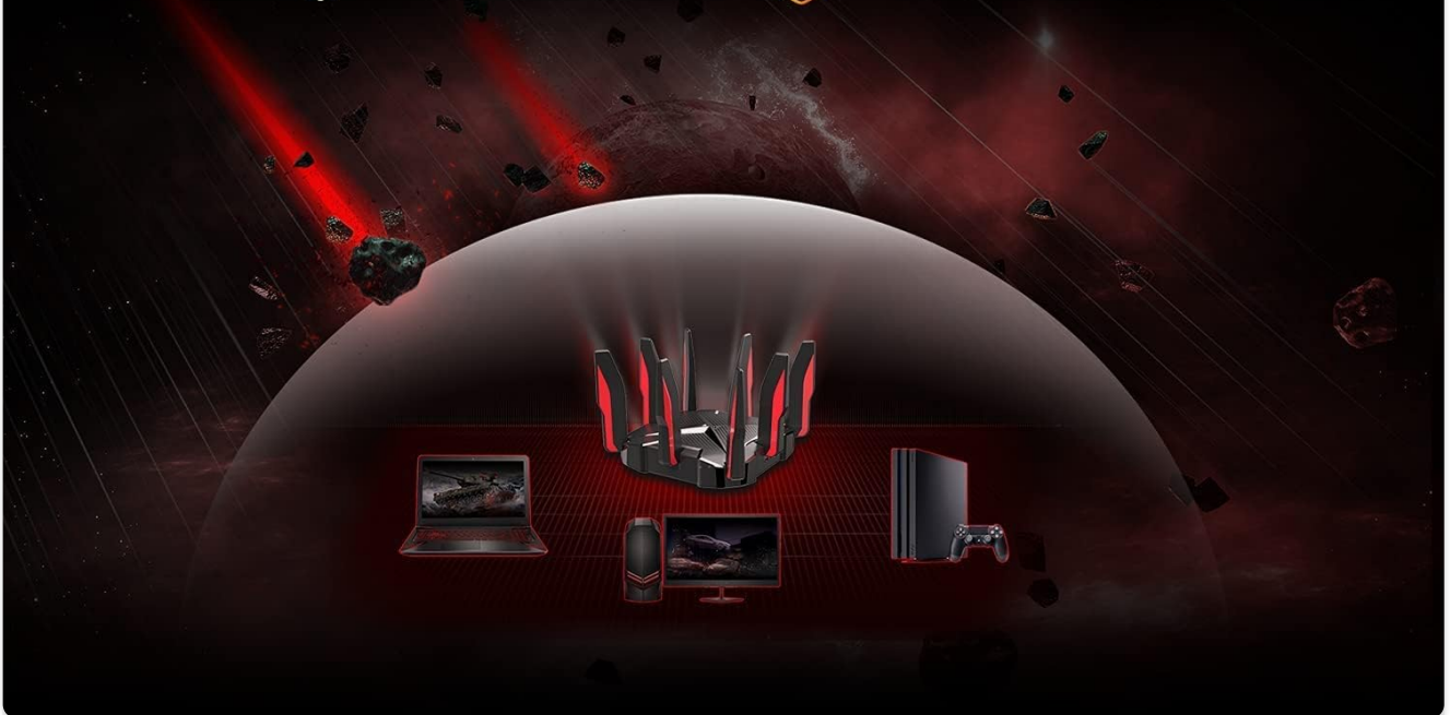
Image: Visual representation of the router's security features, HomeCare™ and WPA3.