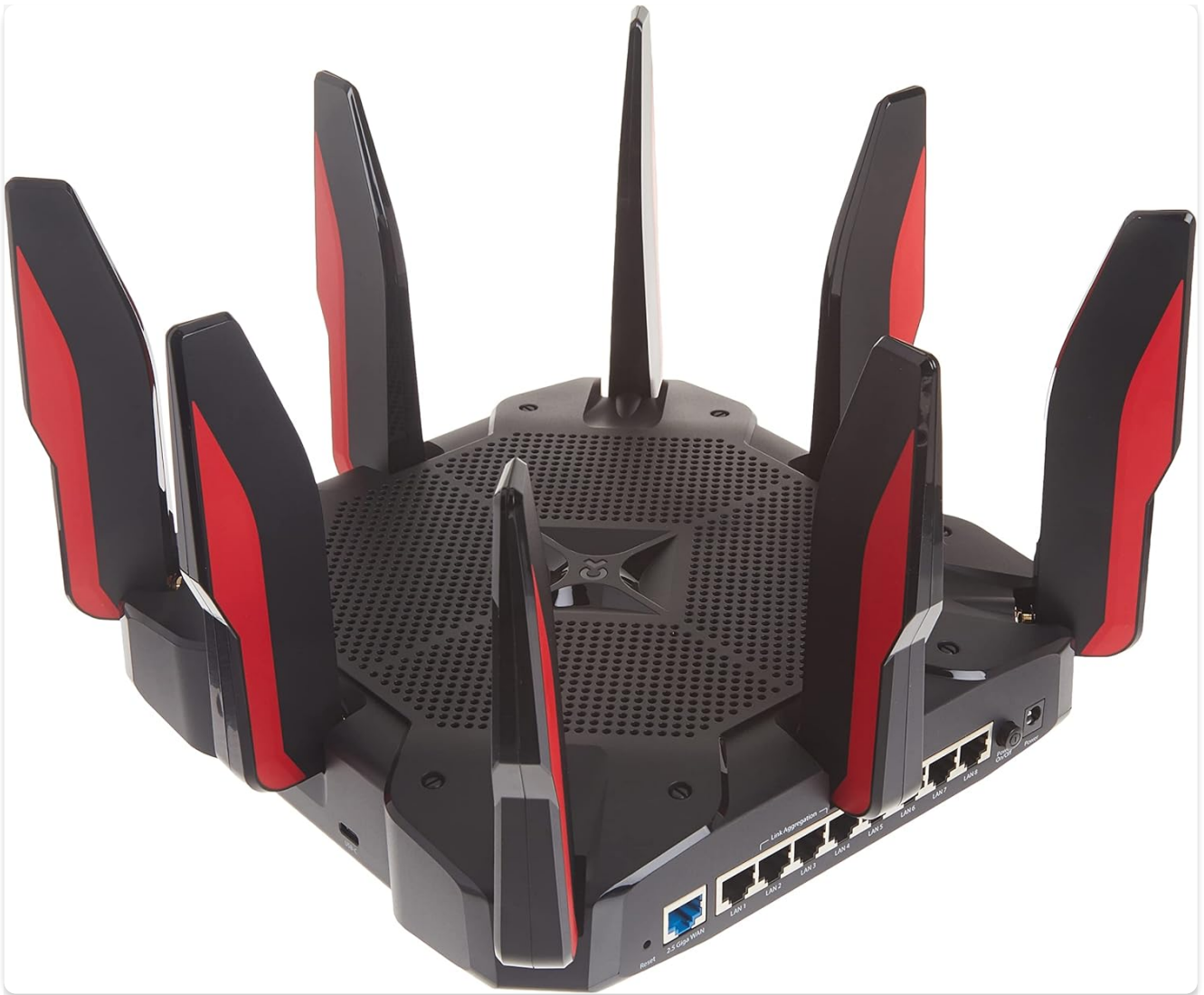
Image: Key technologies contributing to the router's extensive Wi-Fi coverage.