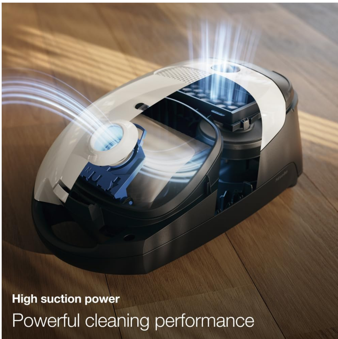
Image: An internal cutaway view of the Miele vacuum cleaner, illustrating the powerful airflow and high suction capabilities for effective