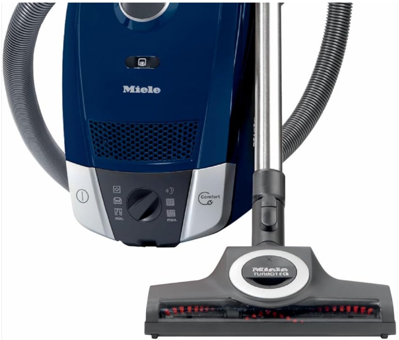
Image: The Miele Compact C2 TotalCare Canister Vacuum, showing the main unit, hose, telescopic wand, and the Turbo floorhead attached. This provides a complete view of the assembled product.