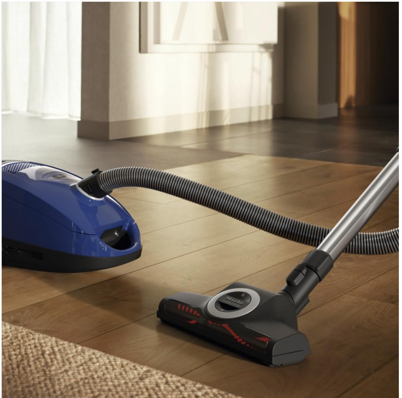
Image: The Miele Compact C2 TotalCare vacuum in operation, demonstrating its use on a hard floor surface with the appropriate floorhead.