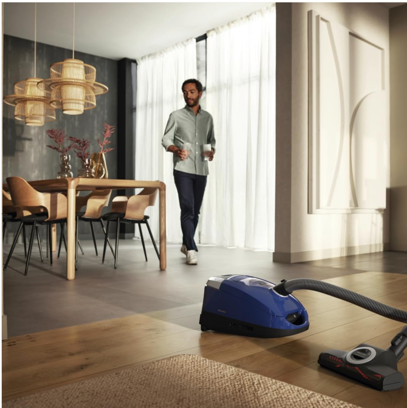
Image: The Miele Compact C2 TotalCare vacuum positioned in a modern living space, showcasing its compact design and ease of maneuverability during cleaning.