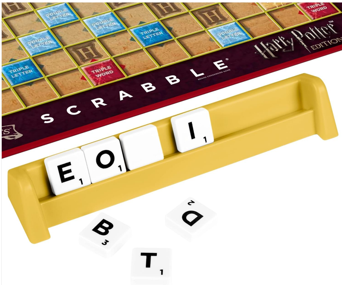
Image: A close-up view of a yellow letter rack holding several white Scrabble tiles, showing the letters 'E', 'O', 'I' with their respective point values. Additional loose tiles are visible in the foreground.