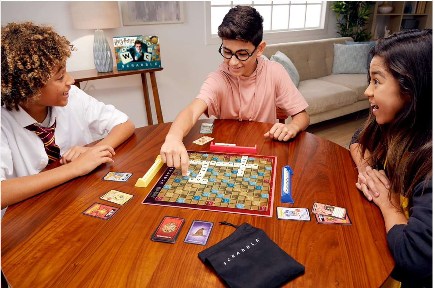
Image: Three players engaged in a game of Scrabble Harry Potter Edition, demonstrating active gameplay with tiles on racks and words forming on the board.