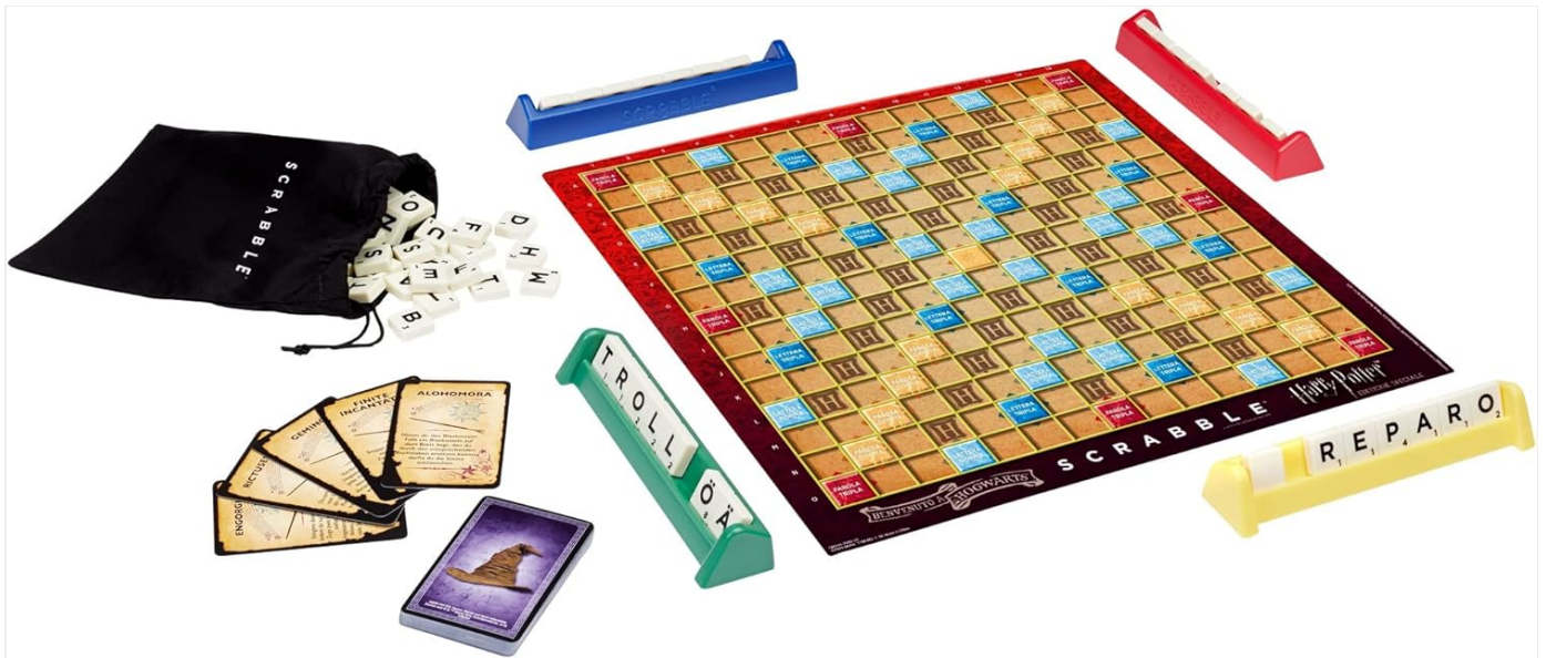
Image: A complete set of Mattel Games Scrabble Harry Potter Edition components, including the game board, four letter racks, a bag of letter tiles, and a stack of special Hogwarts cards.