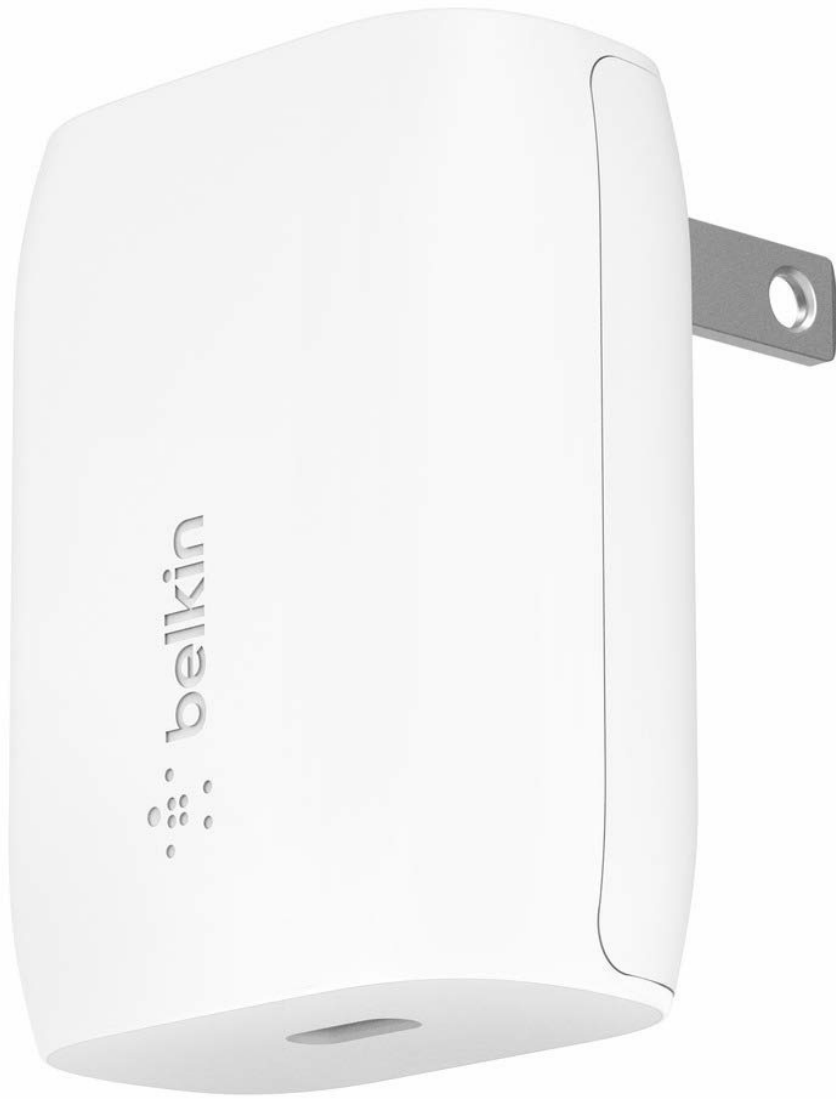
Image: Front view of the Belkin 18W USB-C Wall Charger, highlighting the USB-C port for device connection.