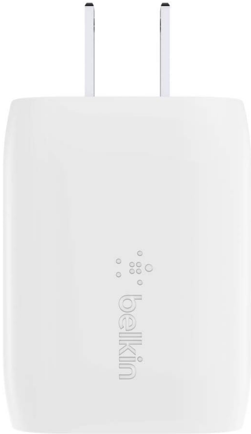
Image: Back view of the Belkin 18W USB-C Wall Charger, displaying the Belkin brand logo.