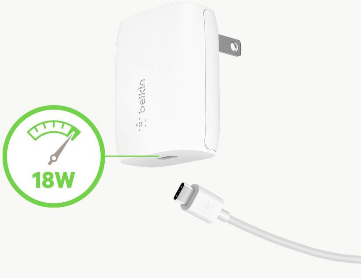
Image: The Belkin 18W USB-C Wall Charger with a USB-C cable plugged into its port, illustrating the connection point.

18W USB-C port supports USB-Power Delivery for ultra-fast charging of compatible devices.