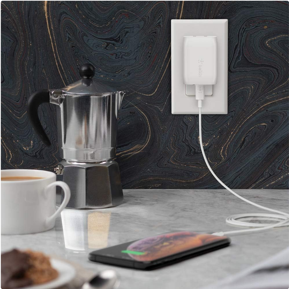
Image: The Belkin 18W USB-C Wall Charger in use, plugged into a wall outlet and charging a smartphone on a kitchen counter, illustrating its practical application.