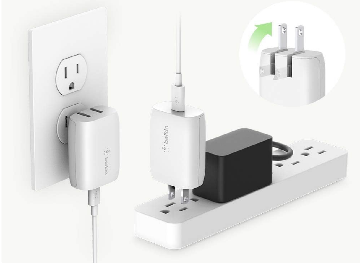
Image: The Belkin 18W USB-C Wall Charger plugged into a wall outlet, showcasing its compact and flat-to-wall design that does not obstruct adjacent outlets.

Designed to sit snug against your outlet and fit easily behind furniture.