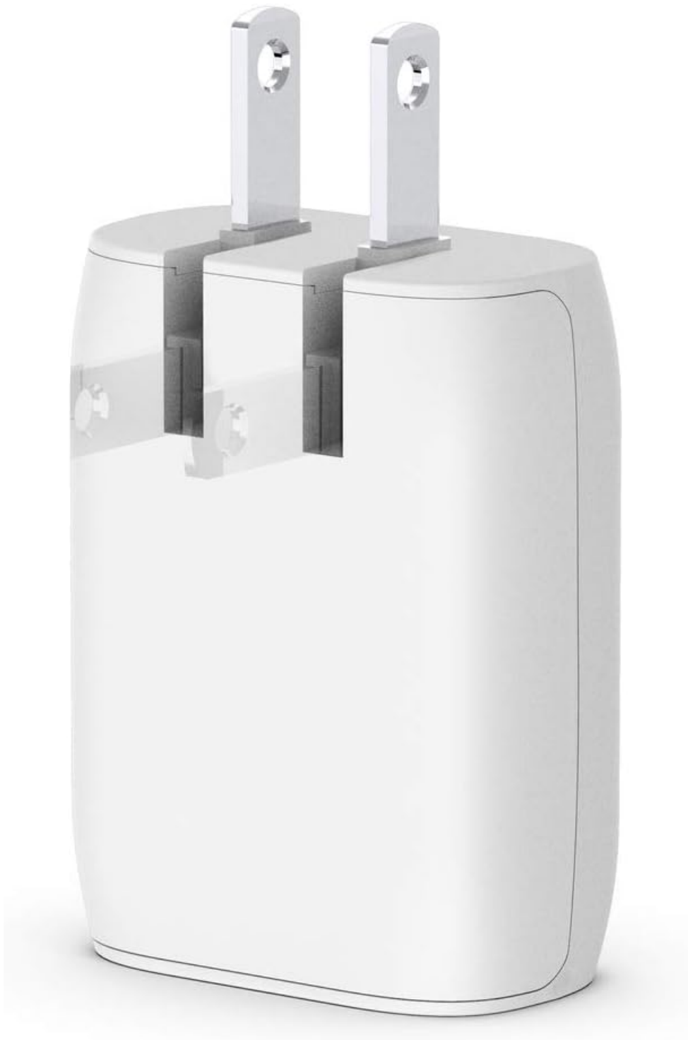
Image: Side view of the Belkin 18W USB-C Wall Charger, showing the foldable prongs ready for insertion into an outlet.