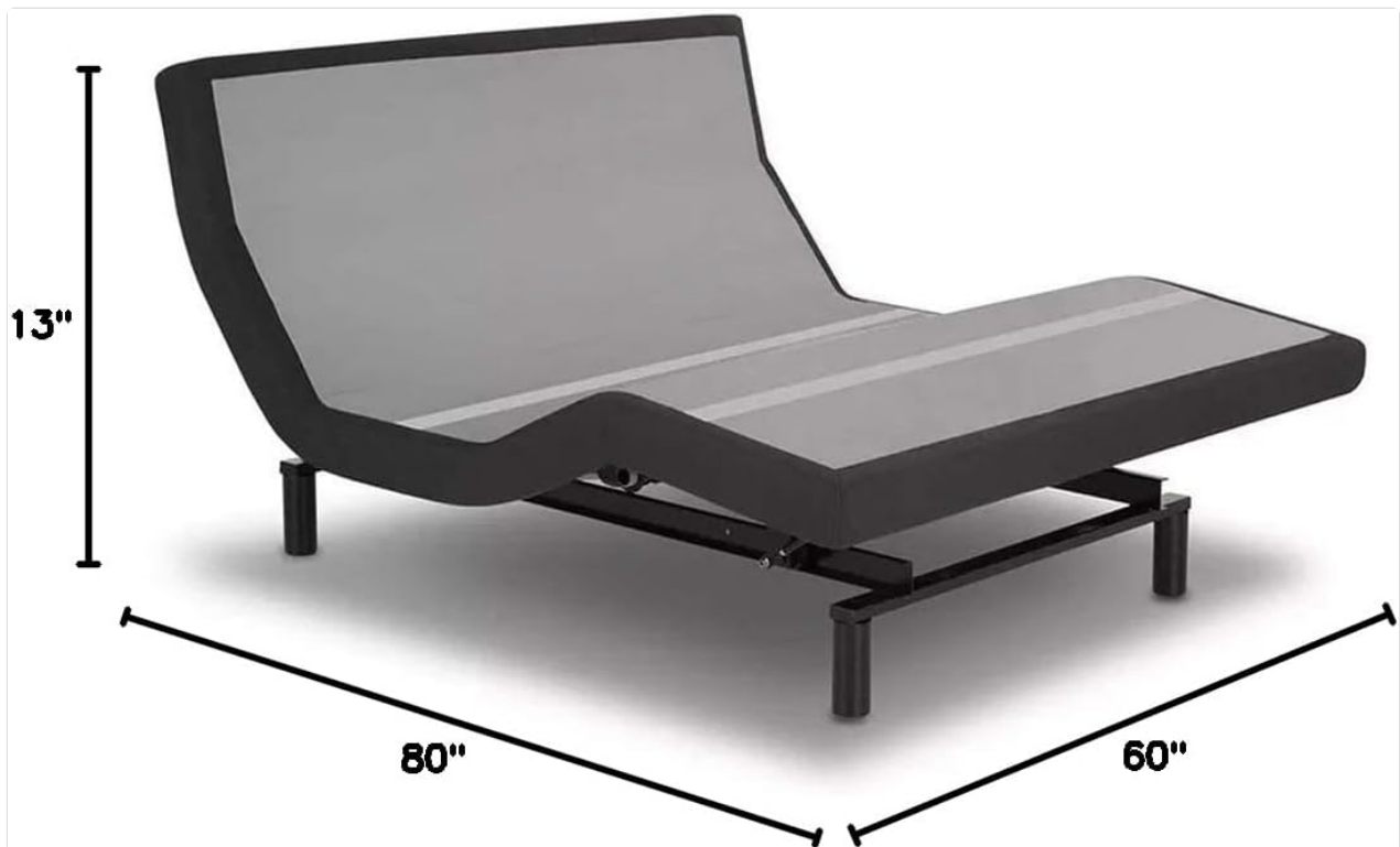
Figure 2: Product Dimensions. This image illustrates the length (80 inches), width (60 inches), and height (13 inches) of the Queen size Prodigy PT adjustable bed base.