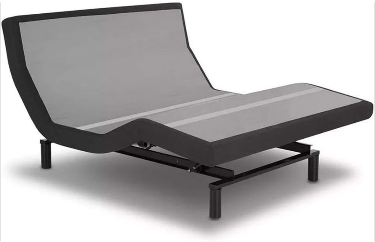
Figure 1: Leggett & Platt Prodigy PT Adjustable Bed Base. This image shows the bed base in a partially reclined position, illustrating the head and foot articulation.