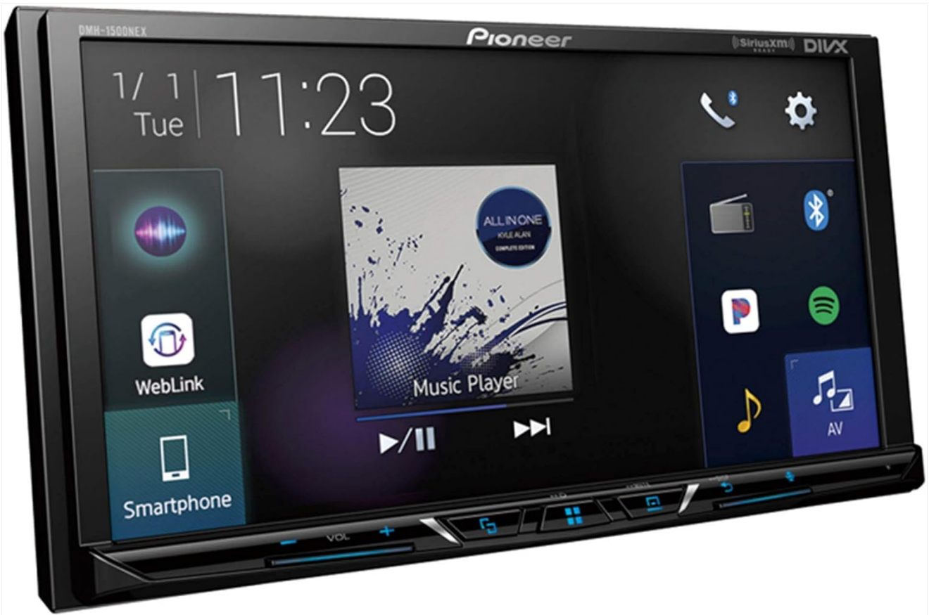
Figure 2: The DMH-1500NEX displaying a music playback screen, with options for WebLink and Smartphone connectivity visible on the left side of the interface. This illustrates the unit's multimedia capabilities and integration with mobile devices.