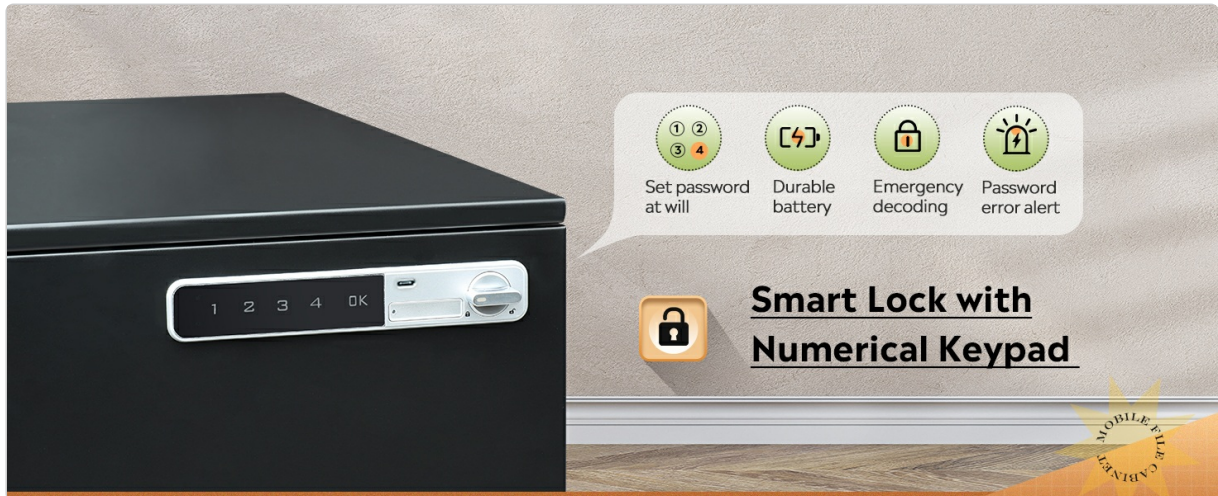
Image: A detailed view of the digital combination lock keypad, showing the numbered buttons and 'OK' button.

Your filing cabinet is equipped with a keyless digital combination lock for enhanced security.