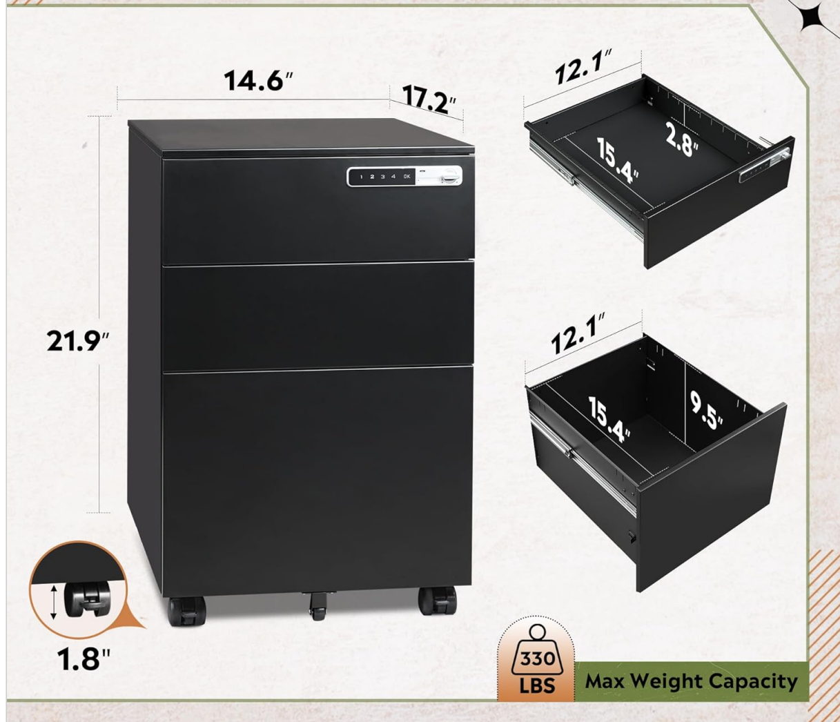
Image: The top two drawers of the cabinet, illustrating the adjustable pencil tray in the upper drawer and the spacious large file drawer below.