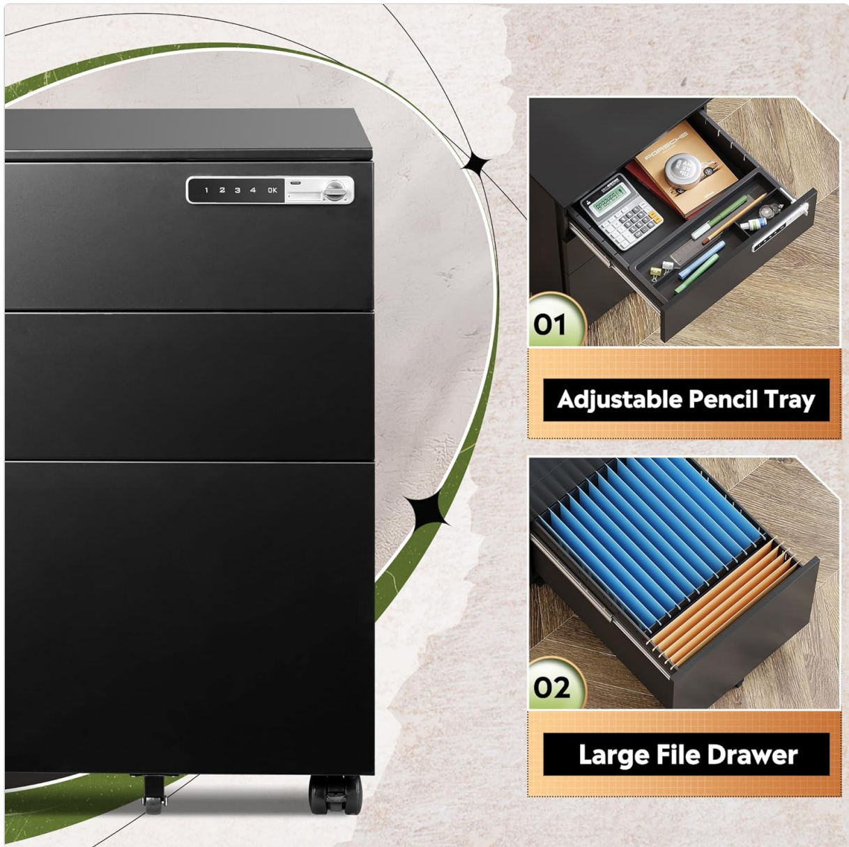
Image: The bottom file drawer demonstrating its capacity for Legal, A4, and Letter sized hanging files.