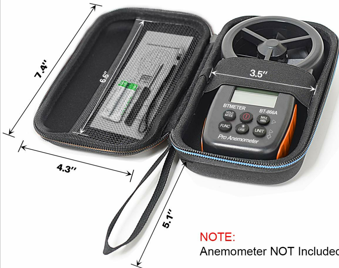
Figure 4.1: The case interior demonstrating how the anemometer and accessories fit, with approximate dimensions.

Perfect size to pack up the anemometer and accessories