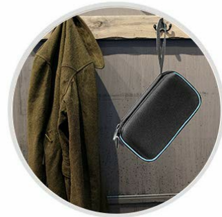
Figure 4.2: Portability of the case with its integrated hand strap.