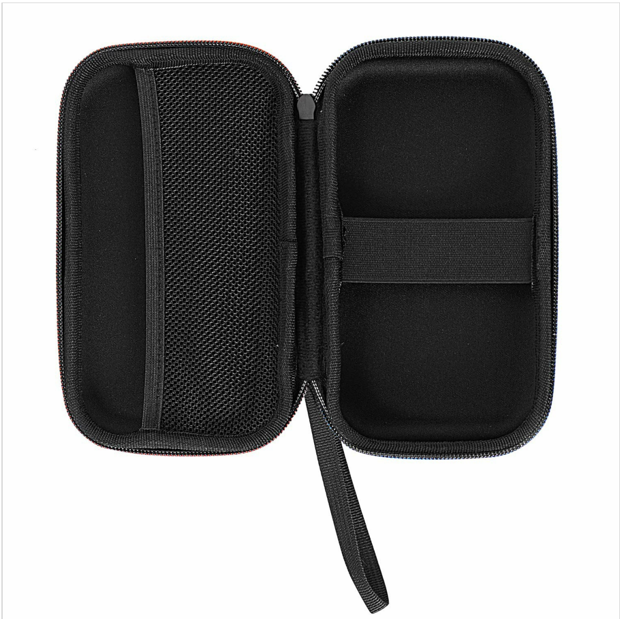
Figure 4.3: Interior view of the open case, showing the mesh pocket and elastic band.