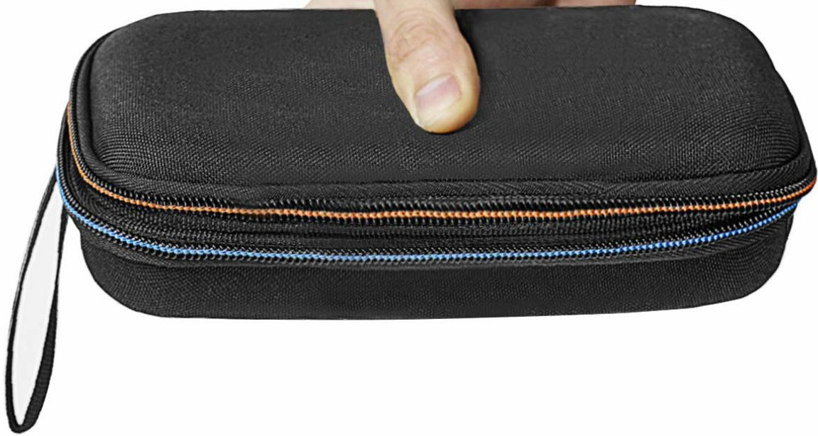
Figure 2.2: The compact EVA surface of the case, designed for secure handling.