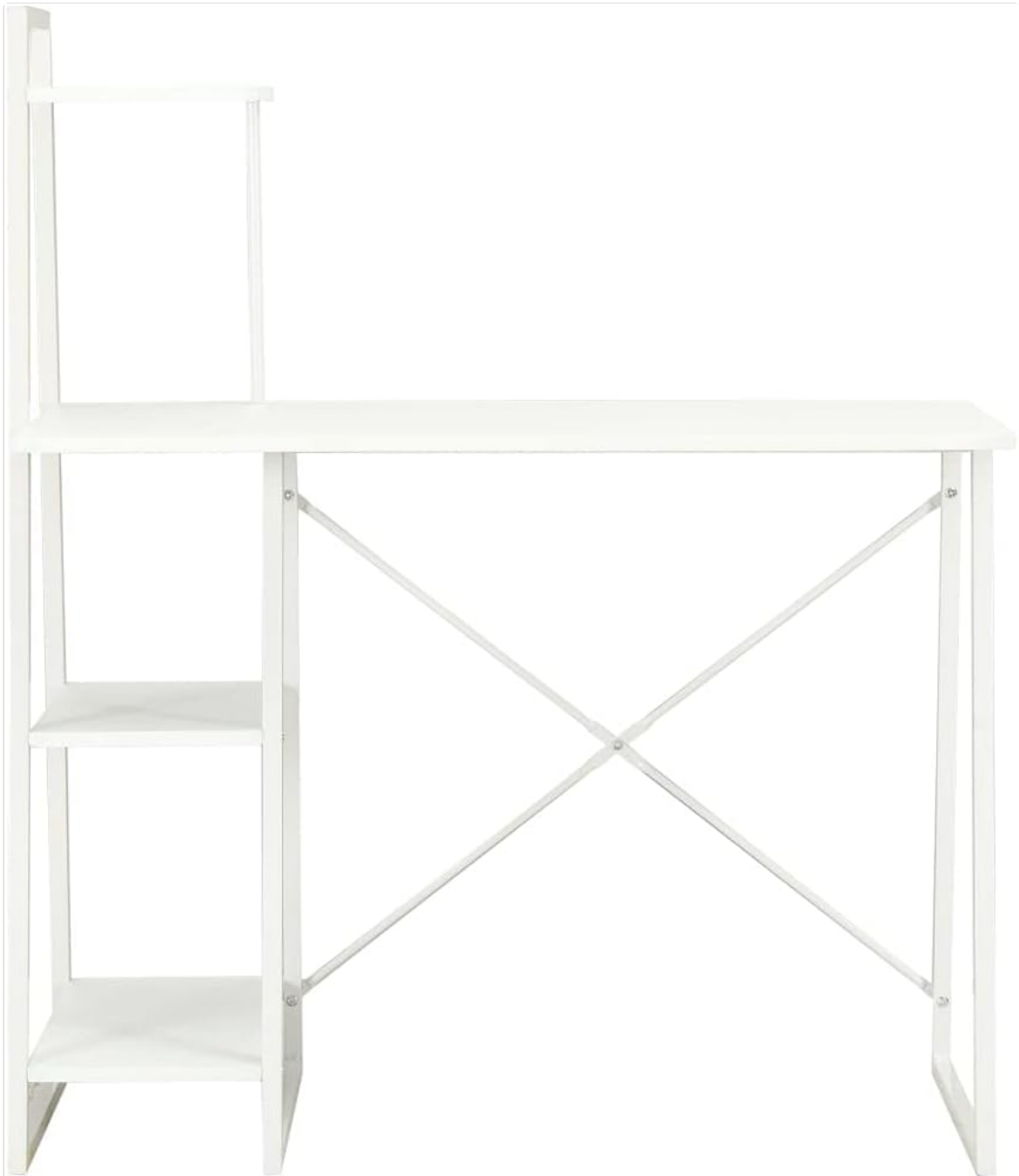
Figure 1: Front view of the vidaXL Desk with Shelves, showcasing its integrated design.