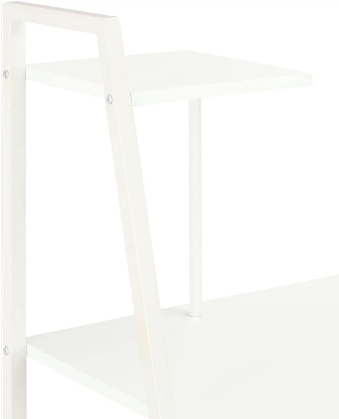
Figure 3: Detail of the integrated shelves, providing ample storage.

The vidaXL Desk with Shelves is designed for versatile use in various settings. Utilize the large tabletop for your computer, laptop, or as a primary workspace. The integrated shelves can hold books, office supplies, decorative items, or personal belongings. Arrange items on the shelves to maximize space and maintain organization.