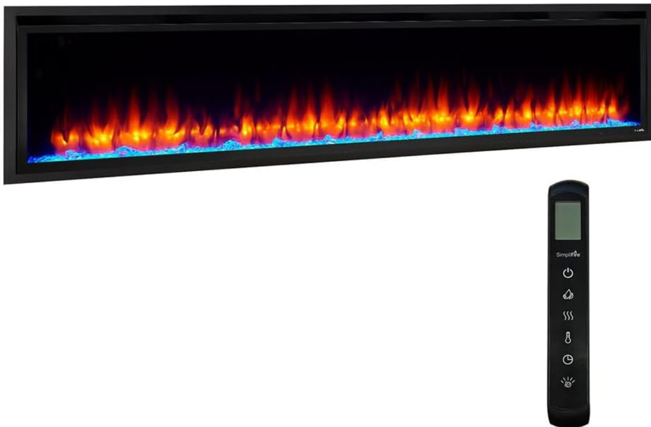
Image: SimpliFire Allusion Platinum Linear Electric Fireplace with its remote control, showcasing the sleek black frame and vibrant flame

Thank you for choosing the SimpliFire Allusion Platinum Linear Electric Fireplace. This manual provides essential information for the safe and efficient operation, installation, and maintenance of your new electric fireplace. Please read all instructions carefully before installation and use, and retain this manual for future reference.