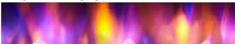
Blue with Orange highlights