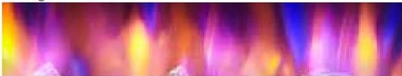
Orange with Blue highlights