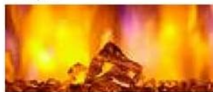
With no light