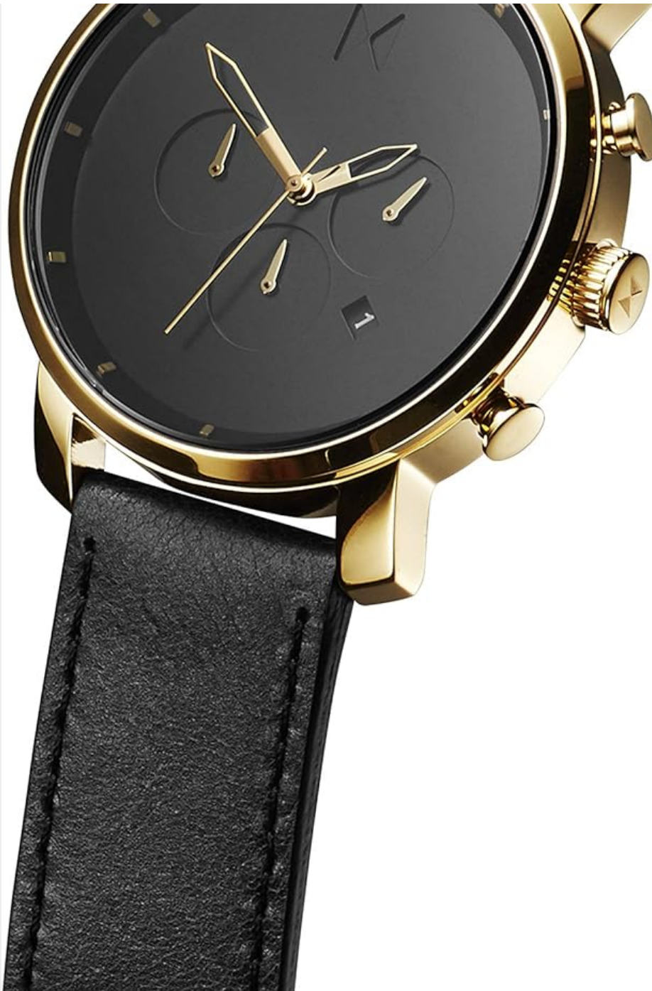
Figure 1: Front view of the MVMT D-MC01GL watch.