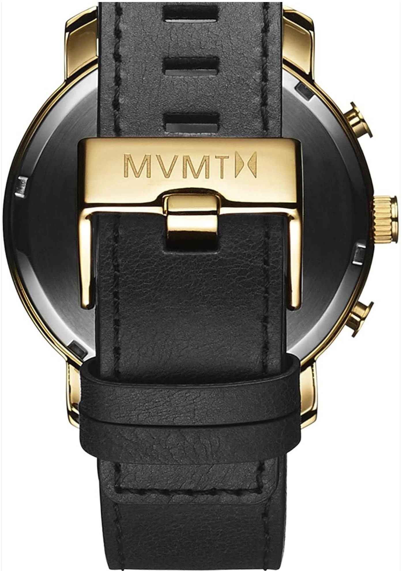
Figure 3: Back view of the MVMT D-MC01GL watch.