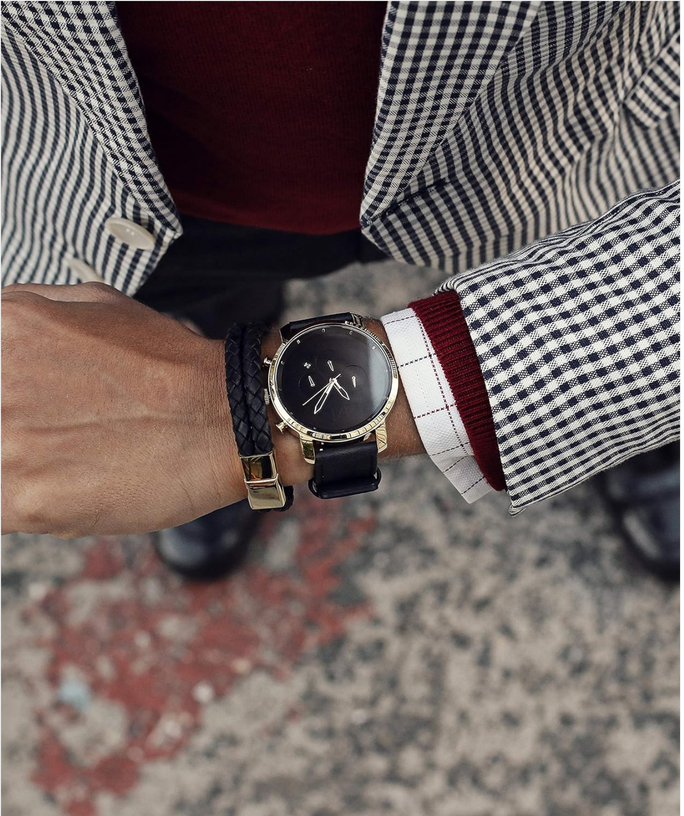
Figure 2: MVMT D-MC01GL watch worn on a wrist.

The black leather strap is equipped with a standard buckle clasp. Adjust the strap by inserting the pin into the appropriate hole for a comfortable and secure fit on your wrist.