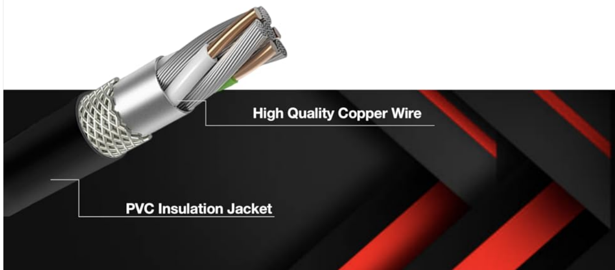
Image: High Quality Power Cable Design. This image provides a detailed cross-section view of the power cable,