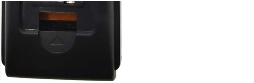
Figure 1: Battery compartment with batteries. Ensure correct polarity when inserting batteries.