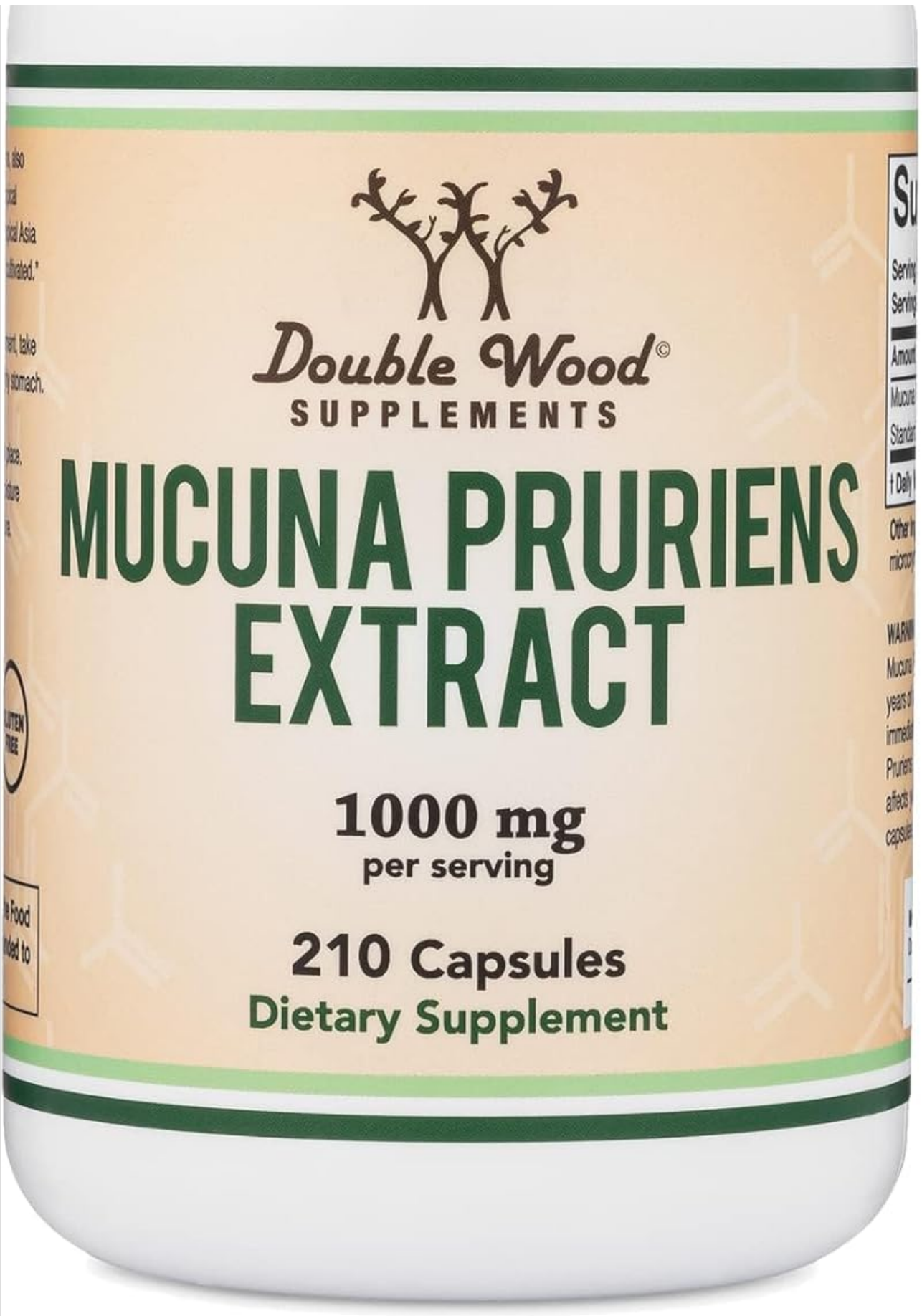
Image 1: Front view of the Double Wood Supplements Mucuna Pruriens Extract bottle, showing the brand logo, product name, 1000mg per serving, and 210 capsules count.