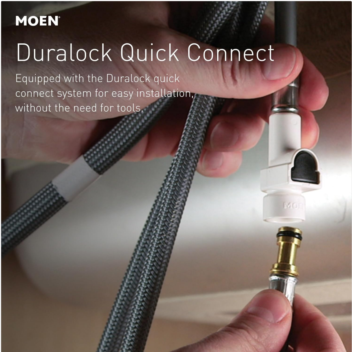
Figure 1: Duralock Quick Connect System. This system allows for easy installation without the need for additional tools, simplifying the connection process.

Equipped with the Duralock quick connect system for easy installation, without the need for tools.