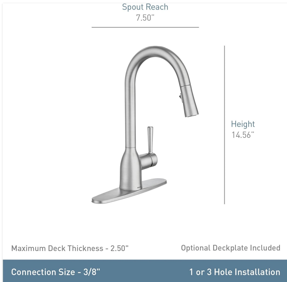
Figure 2: Installation Dimensions. This diagram illustrates the faucet's dimensions, including spout reach and height, and confirms compatibility with 1 or 3-hole installations.

Refer to the included instruction manual for detailed step-by-step installation procedures and required tools.