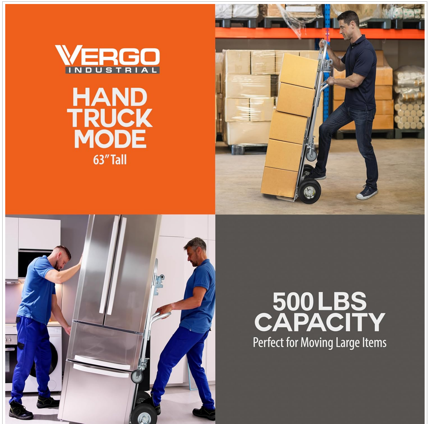
Figure 3: Hand Truck Mode (500 lbs capacity).

In this mode, the AS7B functions as a traditional hand truck, ideal for moving tall or stacked items. It has a maximum capacity of 500 lbs.