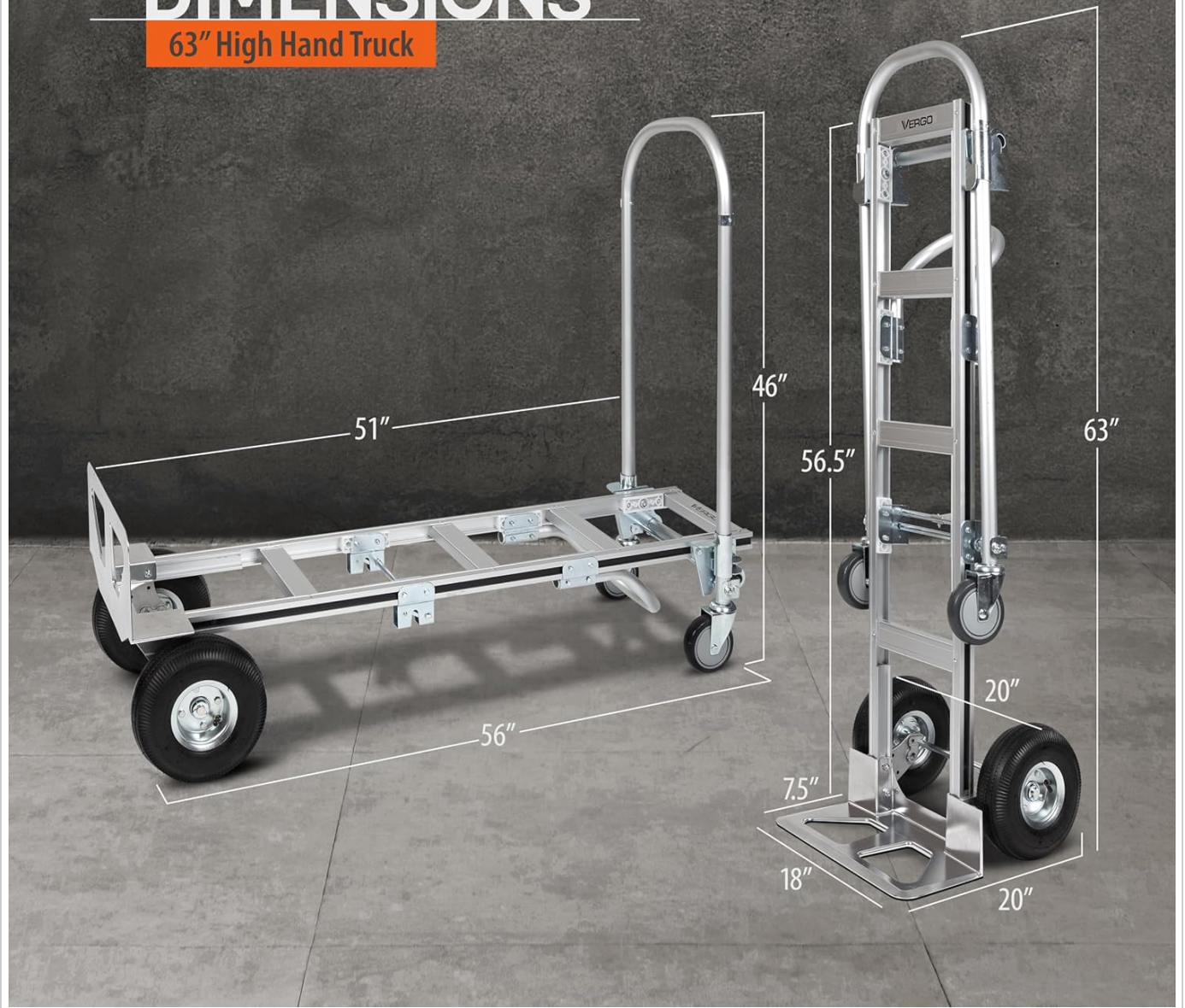
Figure 5: AS7B Dimensions.