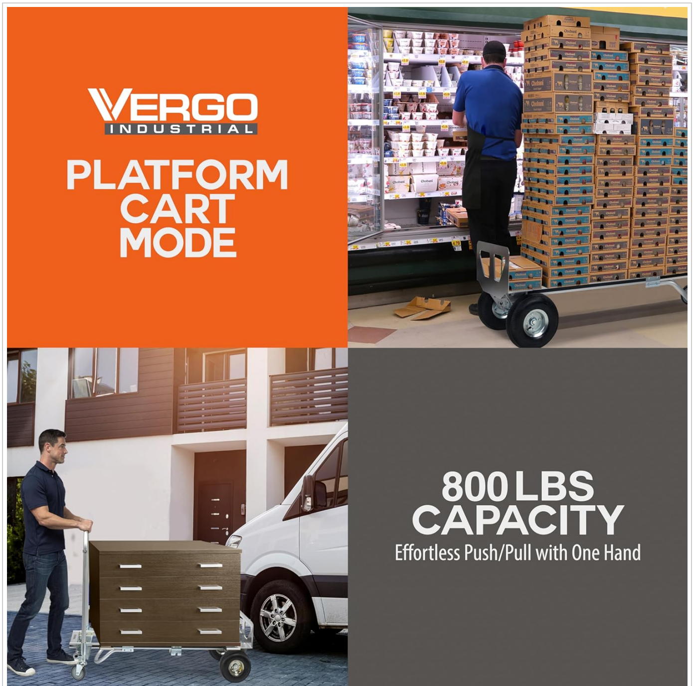
Figure 4: Platform Cart Mode (800 lbs capacity).

To convert to platform cart mode, release the locking mechanism (often a hand release lever) and extend the frame horizontally. This mode is suitable for larger, heavier, or multiple items, with a maximum capacity of 800 lbs.