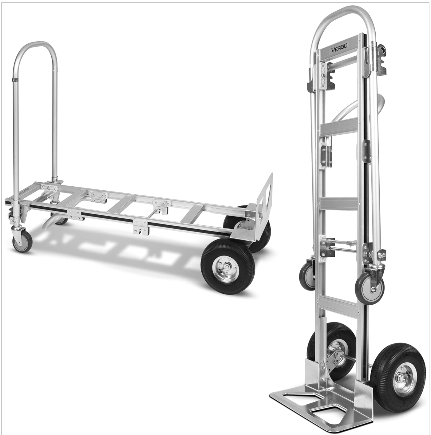
Figure 1: Vergo Industrial AS7B Convertible Hand Truck in its two primary configurations.