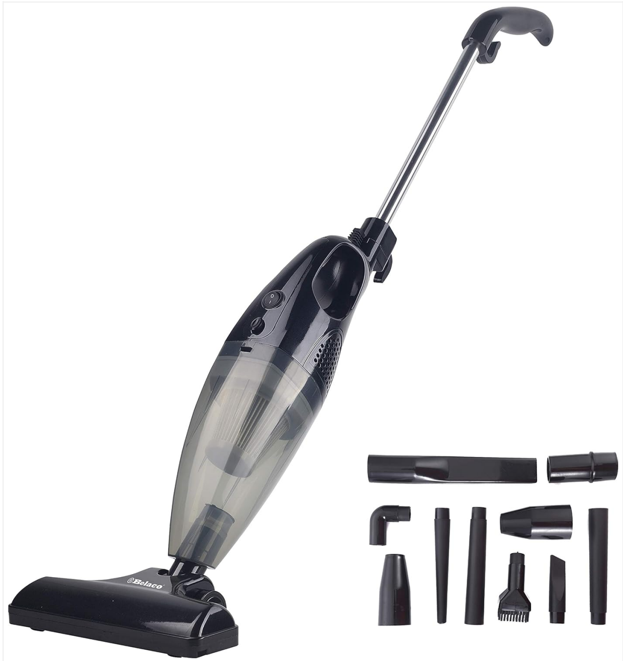
Image Description: The Belaco BSVC135 vacuum cleaner shown fully assembled in its upright configuration, alongside a collection of its included cleaning attachments. This image demonstrates the complete product package.

The Belaco BSVC135 can be assembled in two configurations: as an upright stick vacuum or as a handheld vacuum.