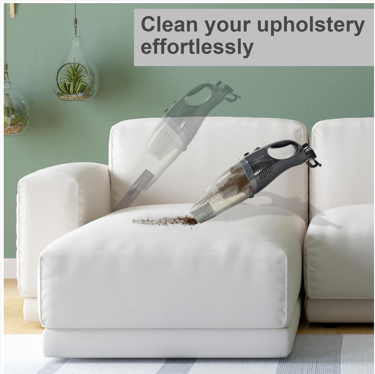
Image Description: The Belaco BSVC135 vacuum cleaner is shown in its handheld configuration, effectively cleaning the surface of a white upholstered sofa. This demonstrates its utility for targeted cleaning tasks.

For cleaning upholstery, car interiors, stairs, or hard-to-reach areas, convert the vacuum to handheld mode.