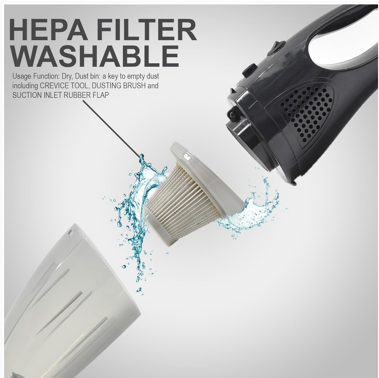
Image Description: A close-up view of the Belaco BSVC135 HEPA filter being cleaned under running water, illustrating the washable feature of the filter for easy maintenance.

The 2-layer HEPA filter (9) is washable and should be cleaned regularly to maintain suction power.