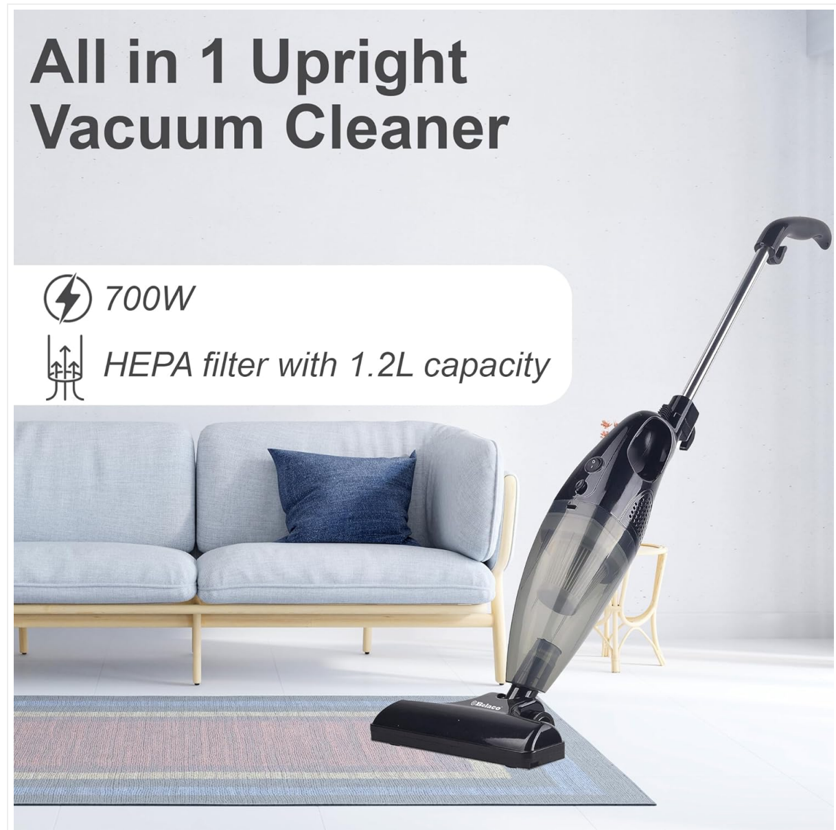
Image Description: The Belaco BSV135 vacuum cleaner is depicted in its upright configuration, actively cleaning a patterned rug in a modern living room setting. The image highlights its use for general floor cleaning.

For cleaning floors, carpets, and rugs, use the vacuum in its upright configuration with the vacuum head attached.