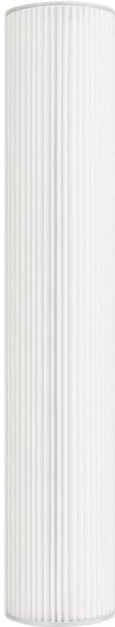
Figure 1: Nispira TPP240 TPP230 Replacement Filter. This image shows the cylindrical pleated filter, which is the primary component for air purification.