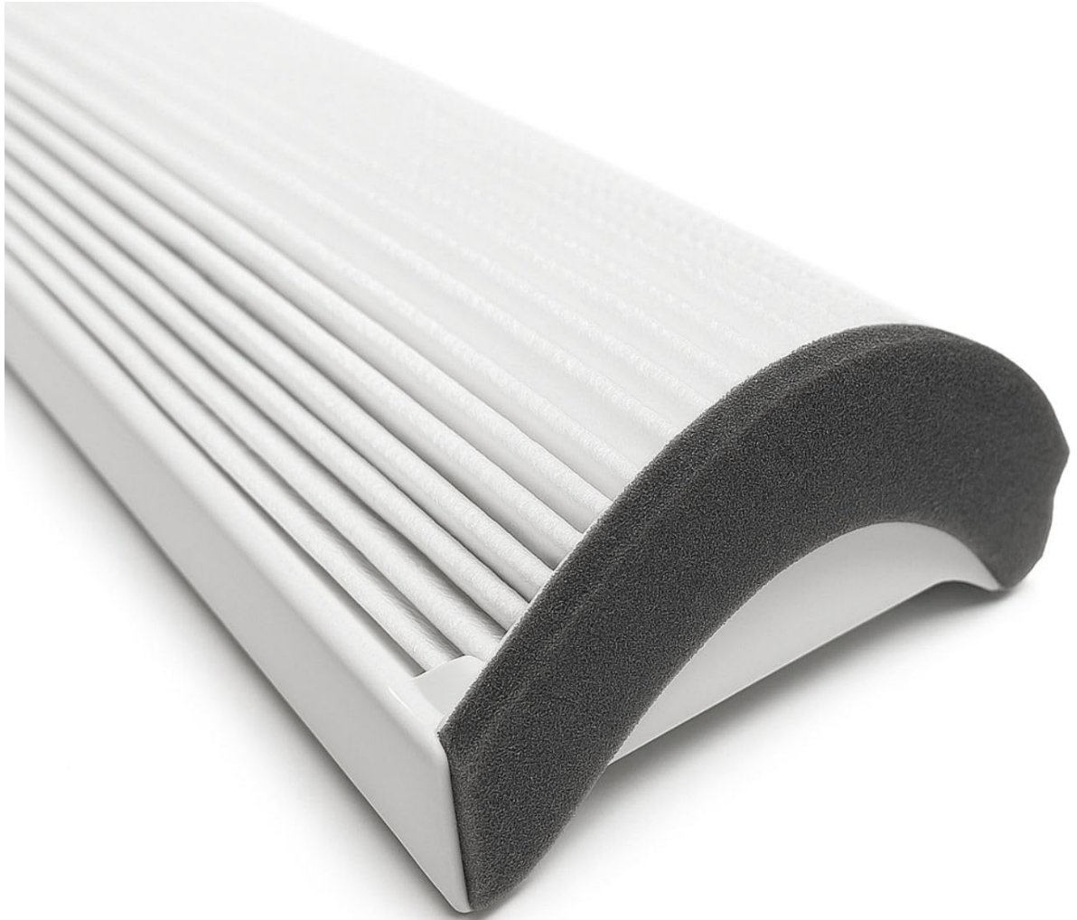
Figure 4: Airtight Seal. A close-up view of the filter's edge, showing the foam gasket designed to ensure a snug and airtight fit within the air purifier, preventing air bypass.