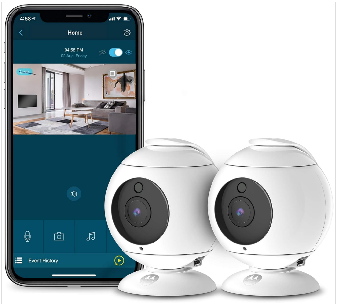
Image: The Motorola FOCUS89-2W camera shown alongside a smartphone displaying its live feed interface.