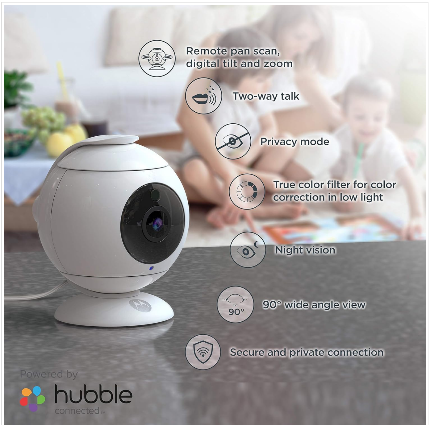
Image: An illustration highlighting key features of the Motorola FOCUS89-2W camera, such as remote pan, tilt, zoom, two-way talk, privacy mode, night vision, and 90-degree wide-angle view.