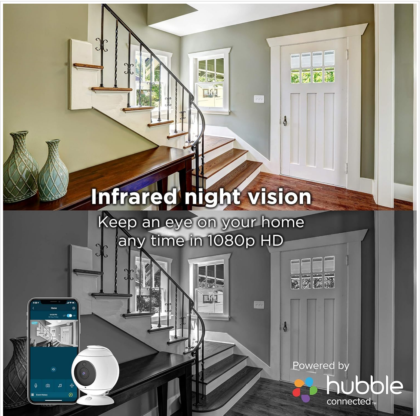
Image: A split image showing a room in daylight and the same room in darkness viewed through the camera's infrared night vision.