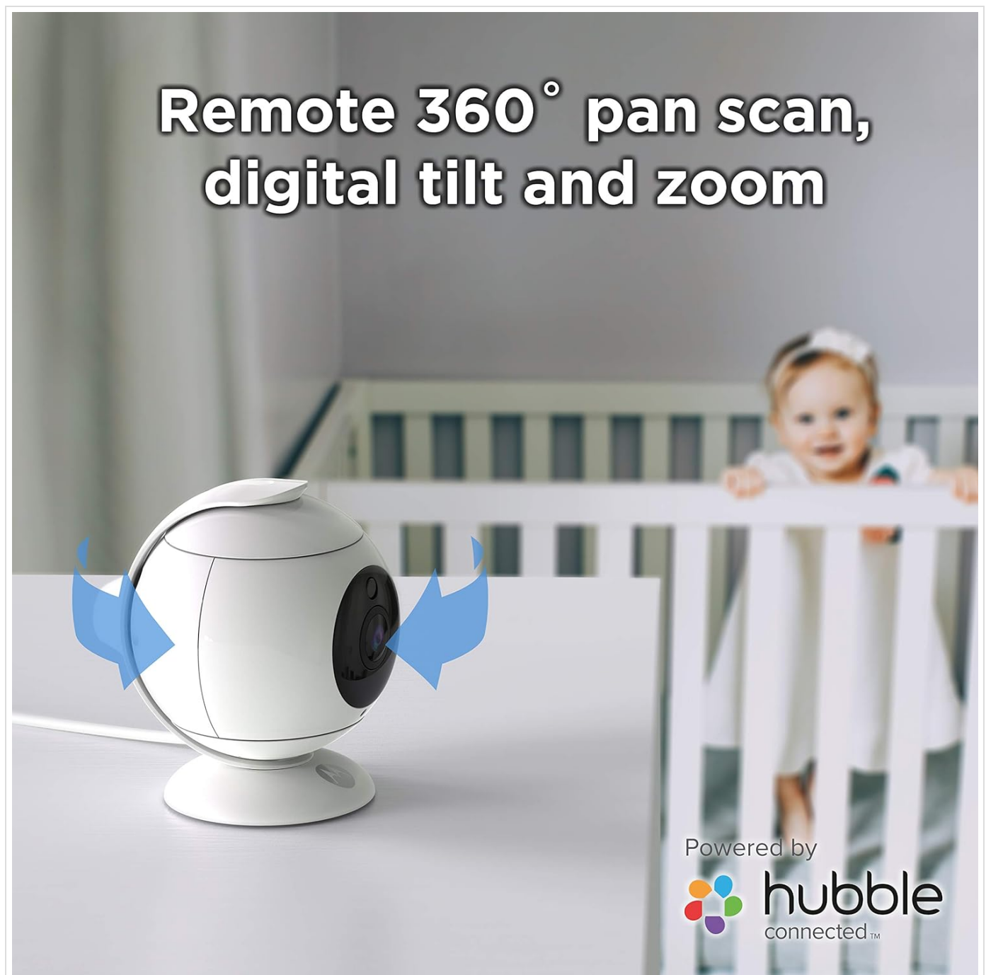
Image: The Motorola FOCUS89-2W camera rotating horizontally, illustrating its remote 360-degree pan scan feature.