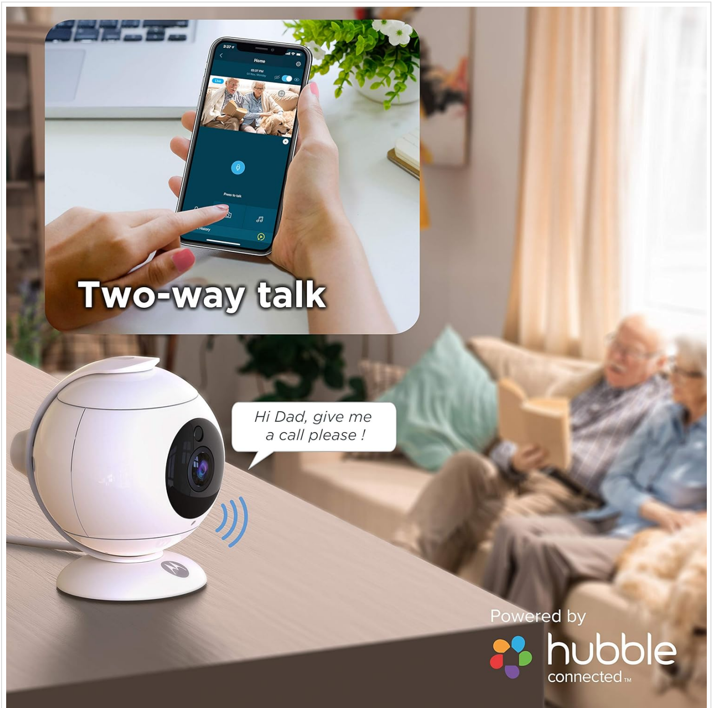
Image: The Motorola FOCUS89-2W camera illustrating its two-way talk function, with a speech bubble indicating communication.

Utilize the two-way talk feature to communicate through the camera. Press and hold the microphone icon in the app to speak, and release to listen.