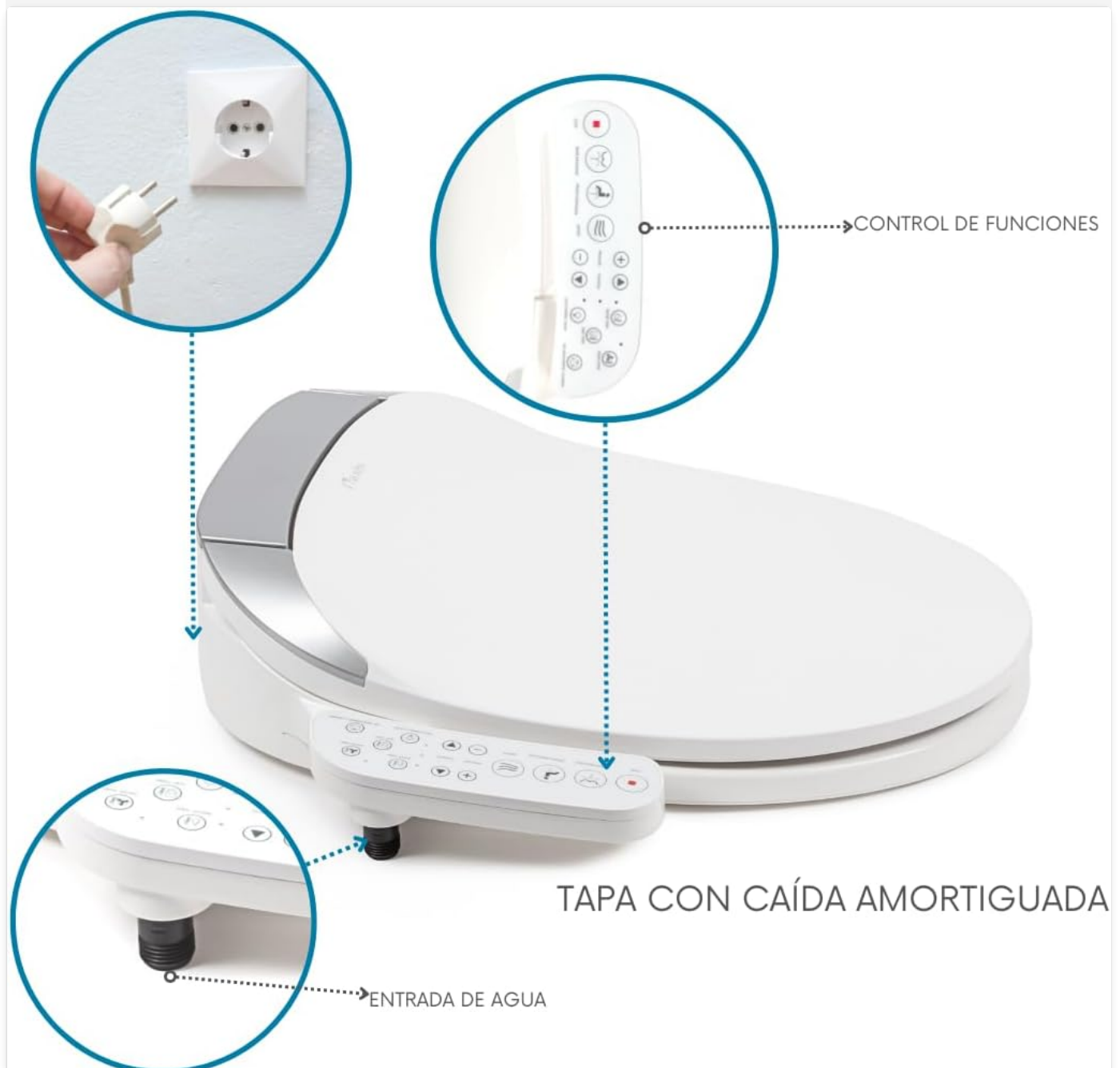
Figure 4.3: Overview of the Nashi Compact Pro bidet seat, highlighting the power connection point and water inlet. The control panel is also visible.

Video 4.2: Step-by-step installation guide for the Nashi Compact Pro bidet toilet seat. This video demonstrates securing the mounting plate, attaching the bidet seat, and connecting the water supply and filter.