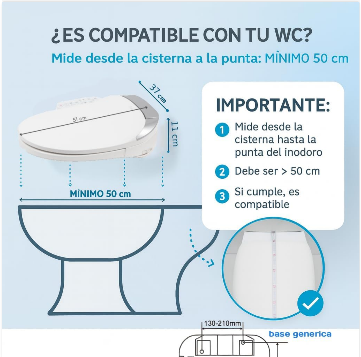
Figure 4.1: Diagram illustrating how to measure your toilet for compatibility. Ensure the distance from the cistern to the front of the bowl is at least 50 cm.

Measure the distance from the cistern to the front tip of your toilet bowl. The Nashi Compact Pro requires a minimum distance of 50 cm for proper fit. Refer to the diagram below for guidance.