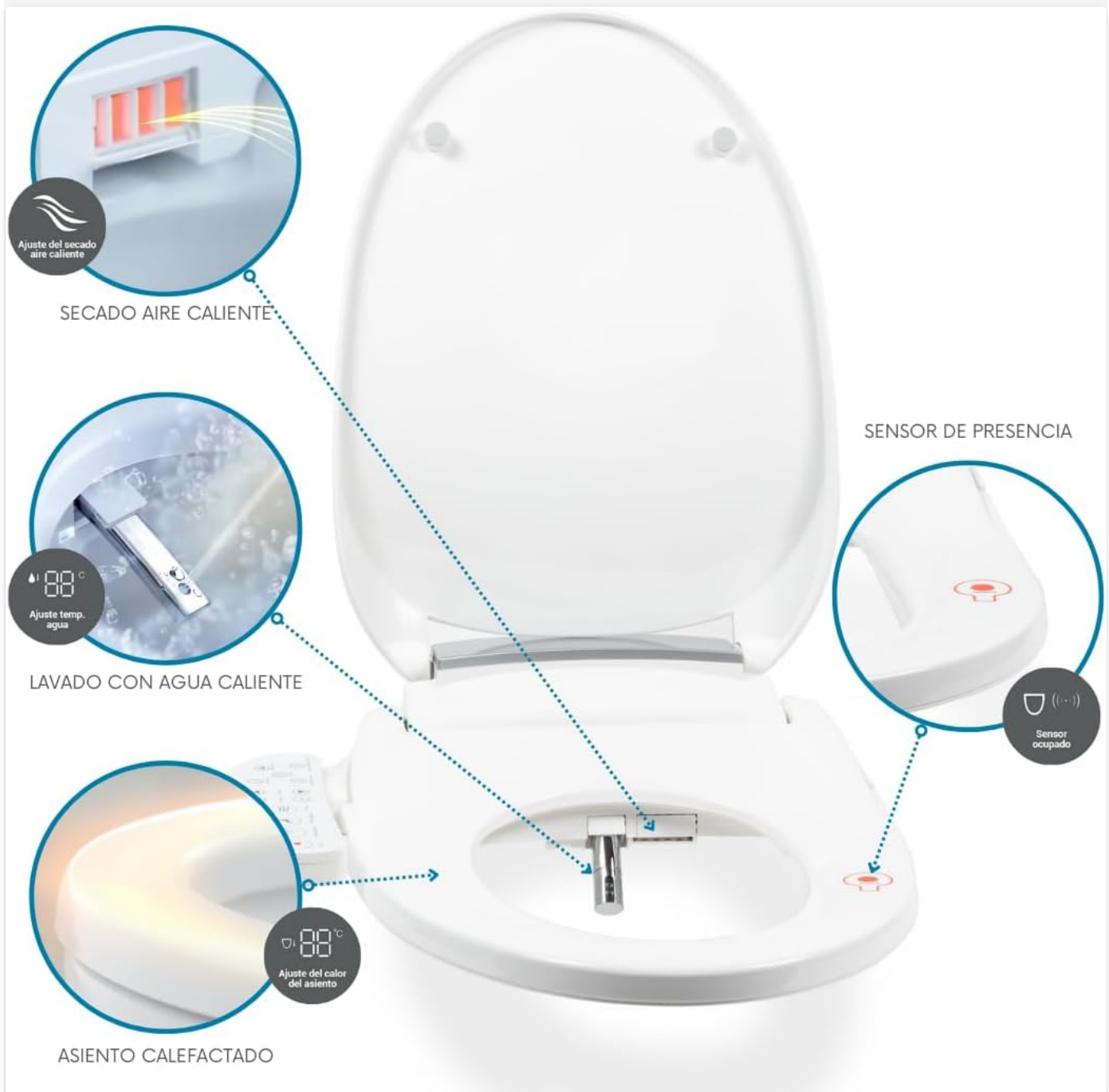
Figure 5.2: Visual representation of key operating features: heated seat, warm water wash, warm air drying, and the presence sensor.