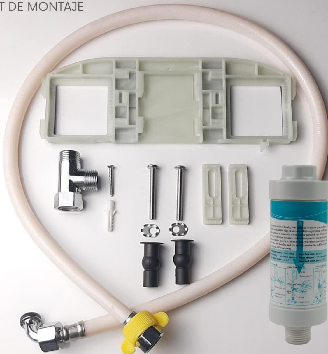
Figure 3.1: Installation kit components including hose, T-connector, screws, and water filter.