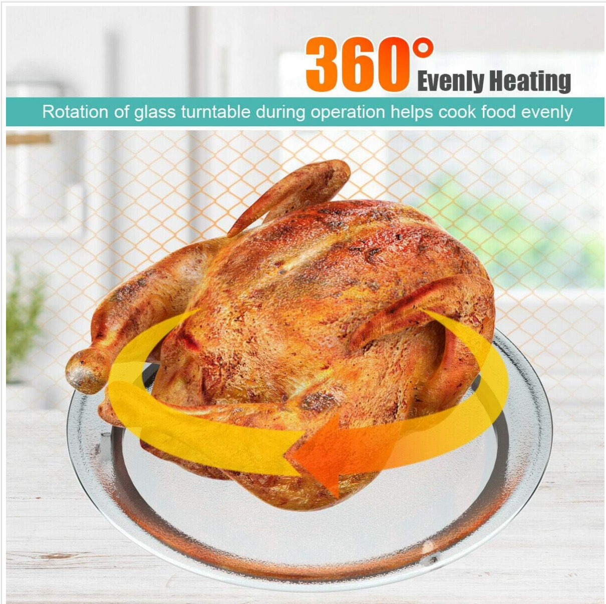
Image: The glass turntable rotating inside the microwave, illustrating 360-degree even heating.