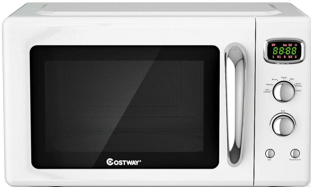
Image: The microwave displaying icons for eight pre-set auto-cooking functions, including Popcorn, Beverage, Potato, Meat, Reheat, Pizza, Vegetable, and Fish.