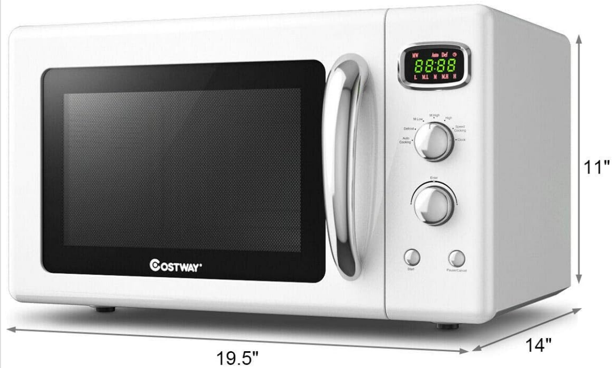
Image: A diagram illustrating the external dimensions of the microwave oven: 19.5 inches wide, 14 inches deep, and 11 inches high.