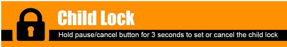
Image: The microwave with a prominent child lock icon and text explaining how to activate or deactivate the feature by holding the 'Pause/Cancel' button for 3 seconds.