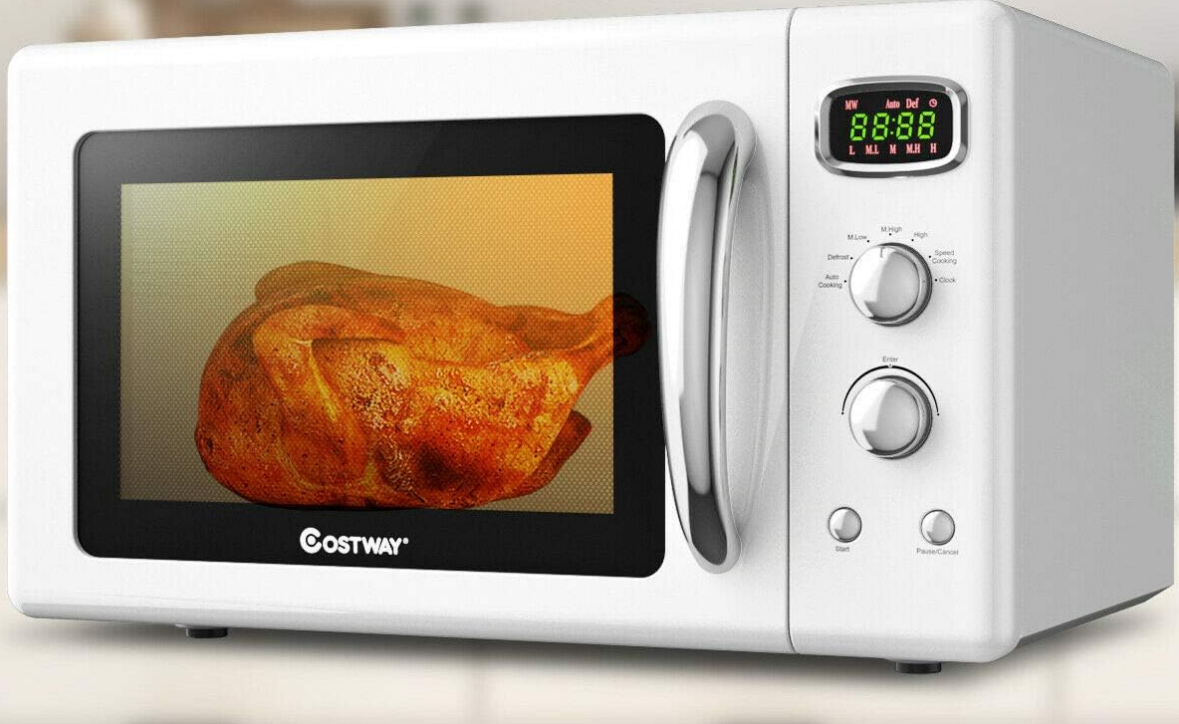
Image: A visual representation of the five microwave power levels, indicating their relative intensity and suggested uses.