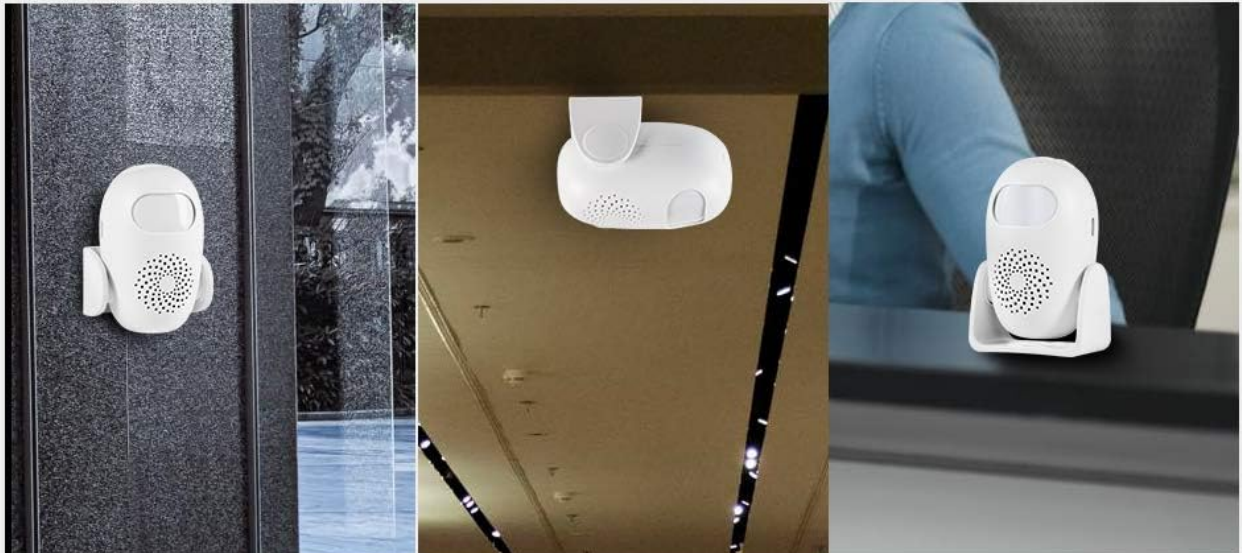
Image: Examples of installing the motion detector using various methods.

can be put anywhere, low battery reminder