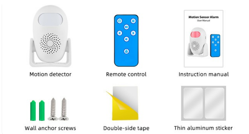
Image: The motion detector can be powered by either a Micro USB cable or 3 AAA batteries.