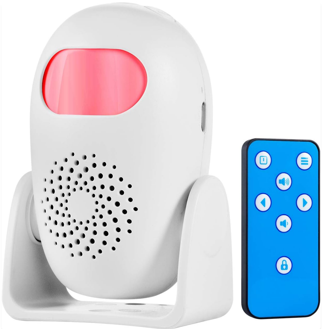
Image: The TOWODE Motion Detector Alarm unit with its accompanying remote control.