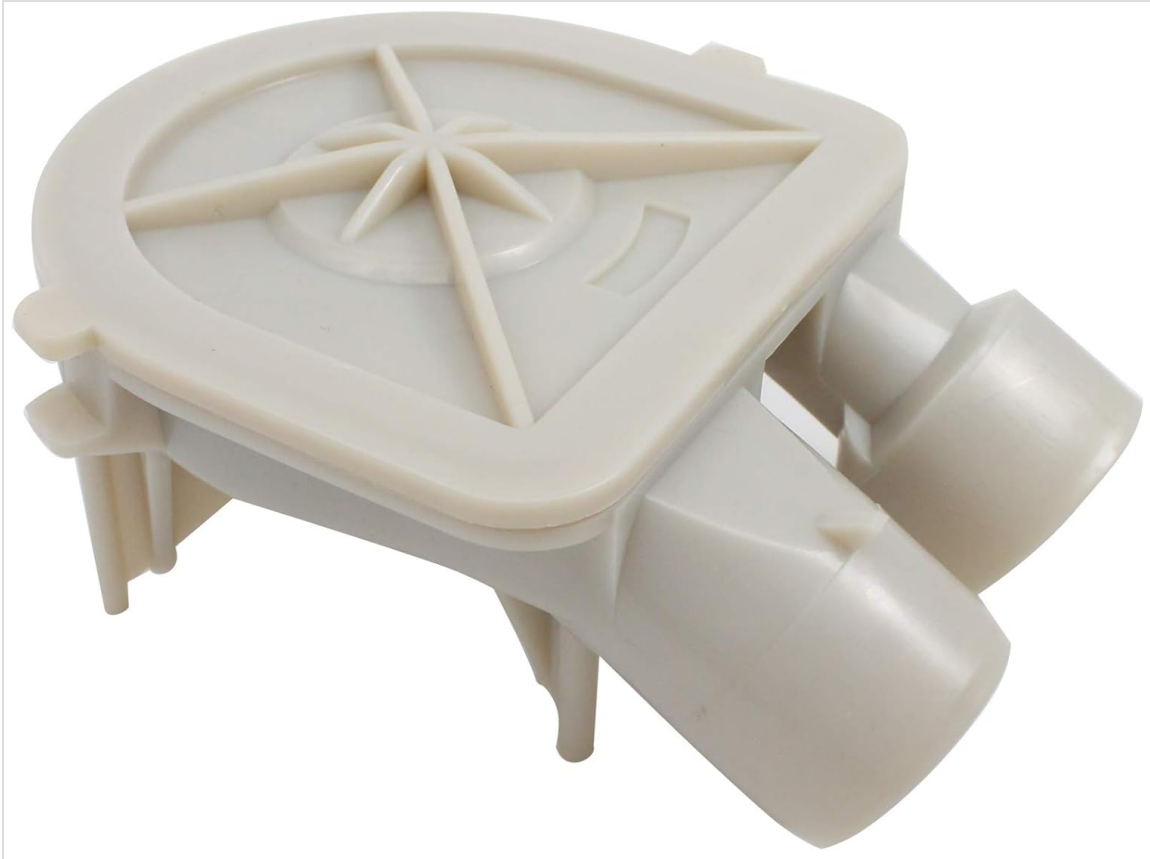
Figure 1: Top view of the 3363892 Drain Pump. This image displays the main body of the pump, including the inlet and outlet ports for water hoses, and the central housing for the impeller mechanism.

for removing water from the washer tub during the drain and spin cycles. This replacement pump is engineered for durability and reliable performance.