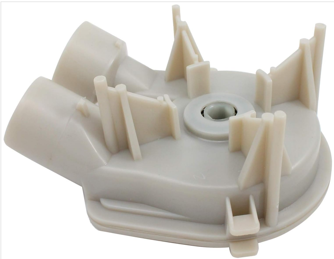
Figure 2: Side view of the 3363892 Drain Pump. This perspective highlights the mounting tabs used to secure the pump to the washing machine chassis, as well as the general shape and dimensions of the unit.