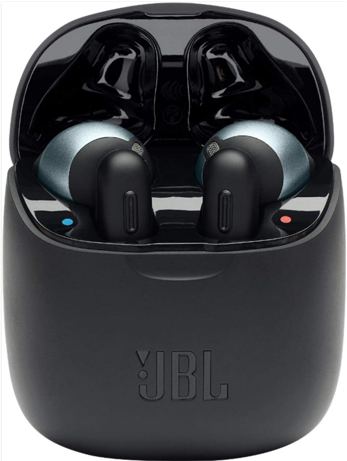
Image: The JBL TUNE 220TWS earbuds securely placed inside their open charging case.