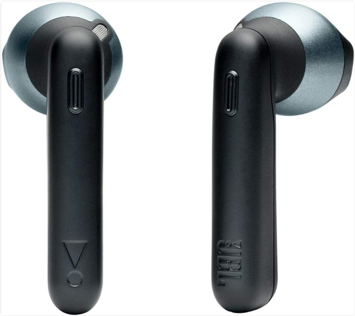
Image: Front view of the JBL TUNE 220TWS earbuds, showcasing their design.

The JBL TUNE 220TWS earbuds feature a sleek, ergonomic design for comfortable wear. Each earbud is equipped with a microphone for calls and intuitive controls for managing audio playback and voice assistant functions.