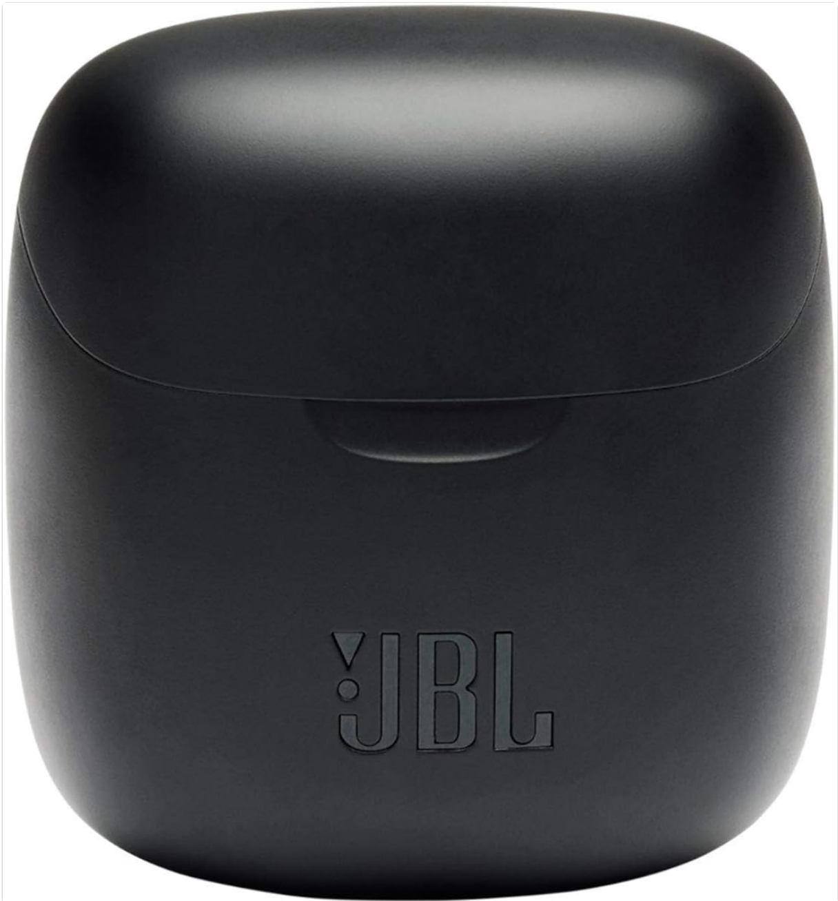
Image: The JBL TUNE 220TWS charging case in its closed position.