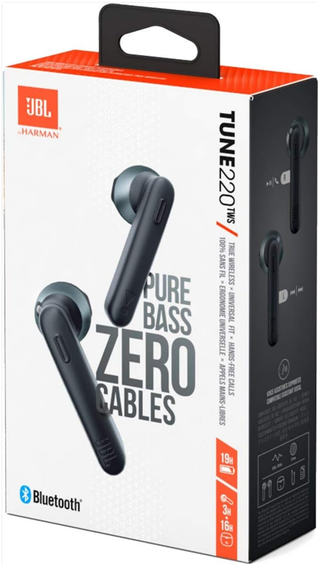
Image: The retail packaging of the JBL TUNE 220TWS headphones, showing the earbuds and charging case.