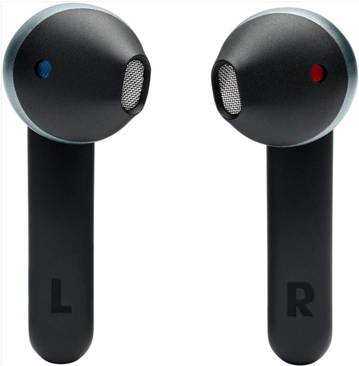
Image: Close-up of the left and right JBL TUNE 220TWS earbuds, indicating their respective sides.

The compact charging case not only protects your earbuds but also provides additional battery life, allowing you to extend your listening time on the go.